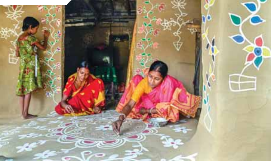
Women make 'rangoli' on the occasion of Lakshmi Puja, in Nadia