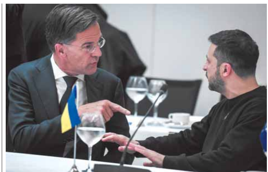
NATO Secretary General Mark Rutte (left) speaks with Ukraine's President Volodymyr Zelenskyy during the NATO-Ukraine Council working dinner at NATO Headquarters in Brussels on Thursday.