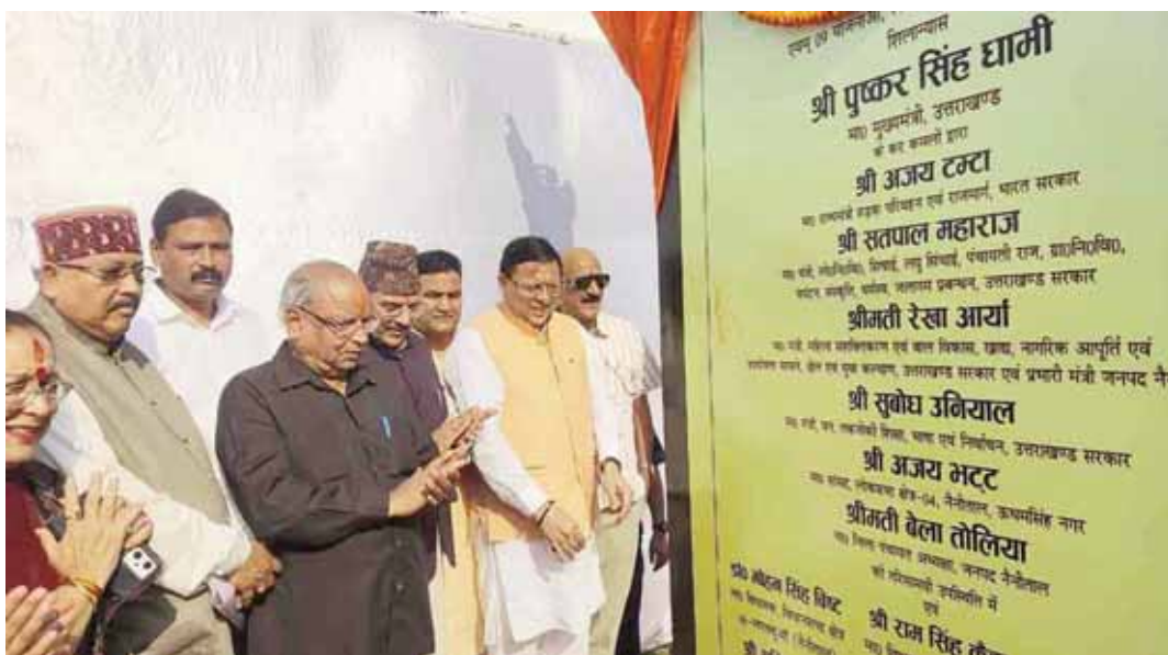
CM Pushkar Singh Dhama launches development works along with ministers Satpal Mahara, Subodh Uniyal and others in Haldwani on Tuesday

Addressing the gathering on the occasion, the CM thanked the families affected by the Jamrani project for dedicating their future to this project to enable the better future of the State and its people. About 300 acre land has been allocated free to the Irrigation department at Gadariyabagh village in Prayag Farm area of Udham Singh Nagar district to resettle the affected families, he said, while adding that all round development will be ensured in this area too. Dhama said that the 117 MLD water from Jamrani