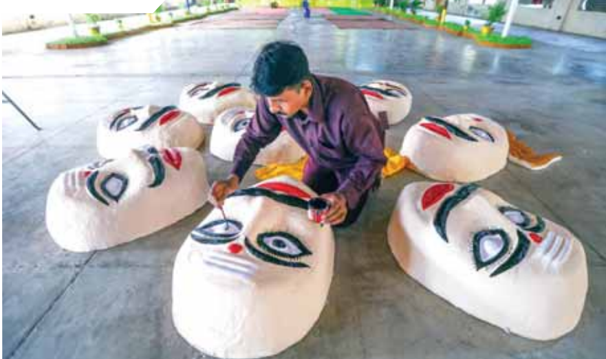
An artist paints effigies of the demon king Ravana on the Dussehra, in Prayagraj