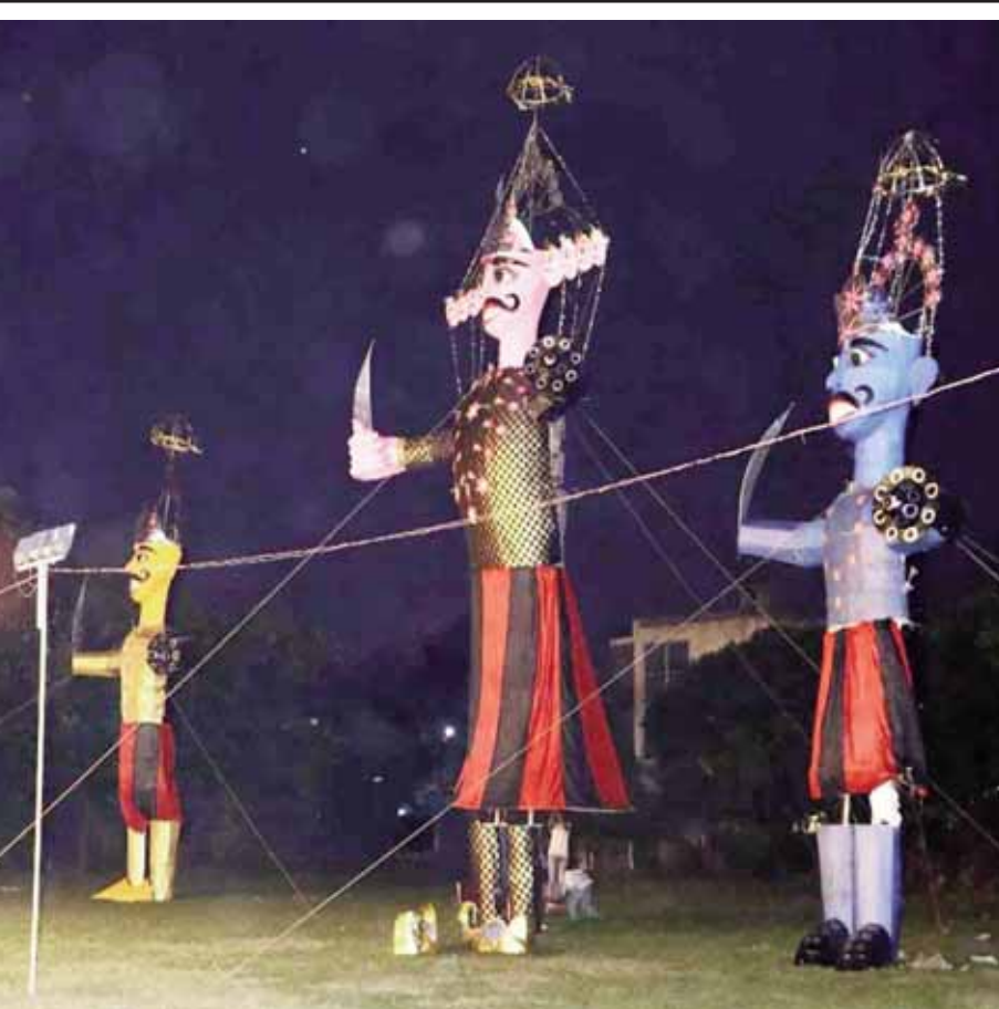
Effigies of Ravan, Kumbhakaran and Meghnad placed on Bannu School grounds in Dehradun for Dussehra celebration

The CM stressed over the need to work for maintaining social harmony and unity and said that Lord Ram was a symbol of truth, justice and peace. He appealed to the people to walk on the path shown by Lord Ram.