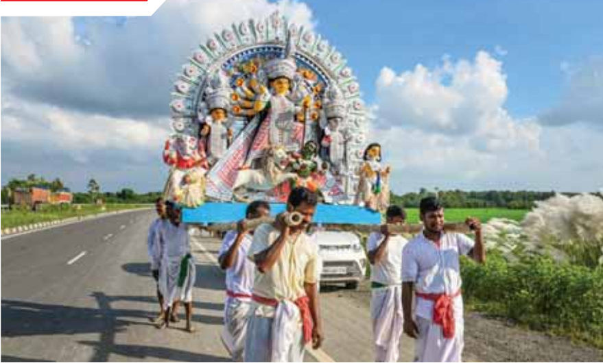
Devotees carry an idol of Goddess Durga to a puja venue, in Nadia