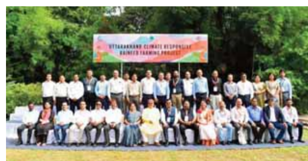
water availability in the rain-fed hilly areas due to which the productivity of most crops is being affected, he added.

DEHRADUN: Addressing Uttarakhand Climate-Friendly Rainfed Agriculture Project workshop held at Forest Research Institute on Tuesday, the State Watershed Management and Irrigation minister Satpal Maharaj said that Uttarakhand is being affected gravely by global climate change. Climate change has led to an increase in natural disasters, rise in temperature and decrease in