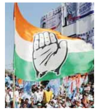
cant impact in UP. In the last state elections, Congress won just six seats, largely because it contested as an ally of SP. Without that partnership, Congress risks becoming a minor player in the state's political landscape. "The outcome in Haryana is pivotal because it reflects Congress's ability - or inability - to stand on its own. Failing to form Government, the Congress has now lost the bargaining power," feels political analyst. The upcoming by-elections in UP are not just a regional political contest; they hold national significance as a test for the opposition's INDIA alliance. Formed to counter the dominance of the Bharatiya Janata Party (BJP), the alliance includes Congress, SP, and other regional parties. But the internal dynamics of this coalition are already strained by seat-sharing disputes, and the by-elections will test whether the alliance can present a united front.

As political results unfold in Haryana, their ripple effects are likely to shape the future of political alliances in Uttar Pradesh (UP), particularly the dynamics between the Congress and the Samajwadi Party (SP). Political analysts say that the outcome could weaken Congress's bargaining position in its alliance with SP, with direct implications for the upcoming by-elections for 10 crucial seats in UP. These by-elections will serve as a litmus test for the effectiveness of the opposition's INDIA alliance, raising questions about Congress's role and influence in the state. A senior Samajwadi Party leader told this reporter that the Haryana election results clearly indicate Congress is rapidly losing its base. The leader urged Congress to reconsider its rigid stance on seat-sharing and accept the offer made by the SP. "The reality is that Congress lacks strong candidates to contest elections," the leader said, adding, "Even in Jammu and Kashmir, Congress can claim it won, but in truth, it secured only 6 out of the 49 seats won by the alliance. A similar situation unfolded in Uttar Pradesh as well." According to political analyst Rajesh N Bajpayee, the Congress has historically struggled to make a signifi-