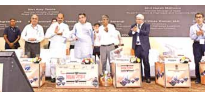
The Union Minister of Road Transport and Highways, Shri Nitin Gadkari launching the 'Humsafar Policy' 2024 at The Ashok Hotel, in New Delhi