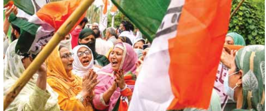
Supporters of Congress and National Conference (NC) celebrate as the Congress-NC alliance leads during the counting of votes of Jammu & Kashmir Assembly elections, in Srinagar, Tuesday