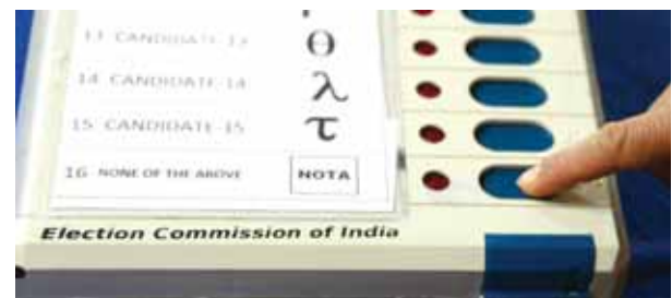
After the Supreme Court order in September 2013, the Election Commission (EC) added the NOTA button on the EVMs as the last option on the voting panel. Before the apex court order, those not inclined to vote for any candidate had the option of filling what is popularly called form 49-O. But filling out the form at the polling station under Rule 49-O of the Conduct of Elections Rules, 1961, compromised the secrecy of the voter. The Supreme Court had, however, refused to direct the EC to hold fresh polls if the majority of the electorate exercised the NOTA option while voting.

More voters in Jammu and Kashmir used the None of the above (NOTA) button against those in Haryana, latest Election Commission data shows. In elections to the 90-member Haryana assembly, out of over two crore electors, 67.90 per cent had exercised their franchise. Out of these, 0.38 per cent used the NOTA option on the voting machine. In the three-phased Jammu and Kashmir assembly polls to 90 seats, 63.88 per cent of the total electorate voted. Out of these, 1.48 per cent opted for the NOTA option. According to trends, not more than two per cent of the voters have opted for the NOTA option, indicating continued reluctance of electors in choosing the option. Introduced in 2013, the NOTA option on electronic voting machines has its own symbol — a ballot paper with a black cross across it.