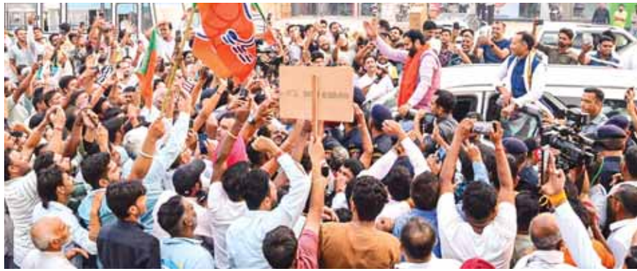
Haryana Chief Minister Nayab Singh Saini greets supporters after winning the Assembly elections from Ladwa constituency, at Ladwa, in Kurukshetra district, Tuesday