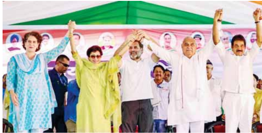
the state who have worked very hard and were looking forward to forming their government after 10 years. "It will not be business as usual in Haryana and I am sure the Congress high command would identify those who negated the efforts to

eral secretary Jairam Ramesh said the Haryana result is a victory of manipulations, and subverting the will of people. He also alleged that it is a defeat of the transparent and democratic processes. The knives were out in the Congress even before the declaration of final results, as party veteran Kumari Selja, who had been sulking during the election which was effectively led by former chief minister Bhupinder Singh Hooda, said that "it will not be business as usual" and called for introspection. "The Haryana poll results are disappointing and I am pained at the disappointment of the Congress workers in