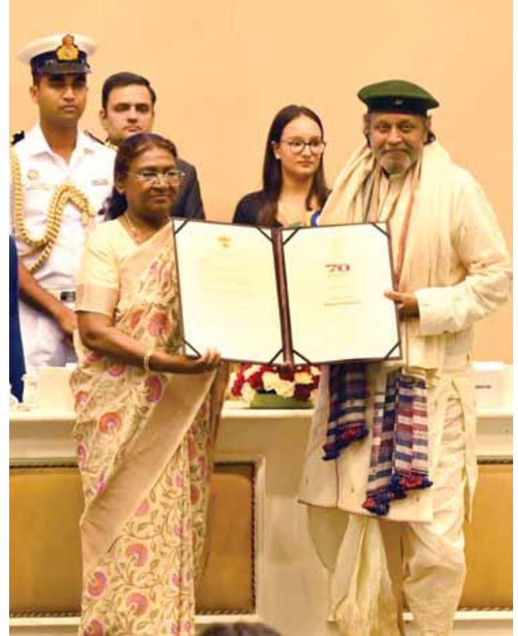
President Droupadi Murmu presents the Dadasaheb Phalke Award to veteran actor Mithun Chakraborty during the 70th National Film Award ceremony at Vigyan Bhawan, in New Delhi, Tuesday