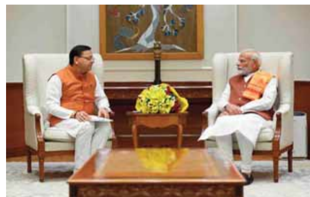
shows the faith the people of the country have in the leadership of PM Modi. PM Modi's recommendation for these

In the meeting, the CM requested that approval for construction of 21 stalled hydro power projects (total capacity 2,123 MW) should be given as the expert committee-2 con-