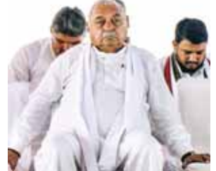
assembly elections held last month, it was a mixed bag for the Congress and the BJP - the saffron party headed for defeat in Jammu and Kashmir but bucked early morning trends to move ahead of the Congress in the nail biting Haryana contest. If the trends hold, the Congress may well have to settle for a loss in the heartland state and a 'second partner win' in the union territory. At 2PM, the ruling BJP had crossed the majority mark in the Haryana assembly and was leading or had won 47 seats, while the Congress was ahead or had won 38 seats, according to the trends available on the Election Commission website. Several exit polls had predicted a big Congress victory in Haryana. What started as buoyant result in Jammu and Kashmir also seemed headed for a disappointing turn in Jammu and Kashmir for the Congress as though its alliance with the National Conference seemed set for majority, the Mallikarjun Kharge-led party was leading or had won only six seats. The Congress also raised with the Election Commission the issue of an "unexplained slowdown" in updating of results of Haryana elections on the poll watchdog's website and urged it to direct officials to update accurate figures so that "false news and malicious narratives" can be countered immediately. In a letter to the Chief Election Commissioner and Election Commissioners, Congress general secretary Jairam Ramesh said that between 9 and 11 am there was an "unexplained slowdown" in updating of results on the ECI's website.