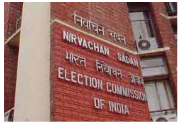
has been an "unexplained slowdown" in updating of results on the ECI's website. In its response, the poll authority said counting of votes is being carried out according to Rule 60 of Conduct of Election Rules at the designated counting centres and by the designated authorities following statutory and regulatory regime. The EC said the entire counting process in Haryana and Jammu and Kashmir is unfolding in the presence of candidates, observers and micro-

Earlier in the day, the Congress had raised with the Election Commission the issue of an "unexplained slowdown" in updating of results of Haryana elections on the poll watchdog's website and urged it to direct officials to update accurate figures so that "false news and malicious narratives" can be countered immediately. In a letter to the Chief Election Commissioner and Election Commissioners, Congress general secretary in-charge communications Ramesh said between nine and 11 am, there