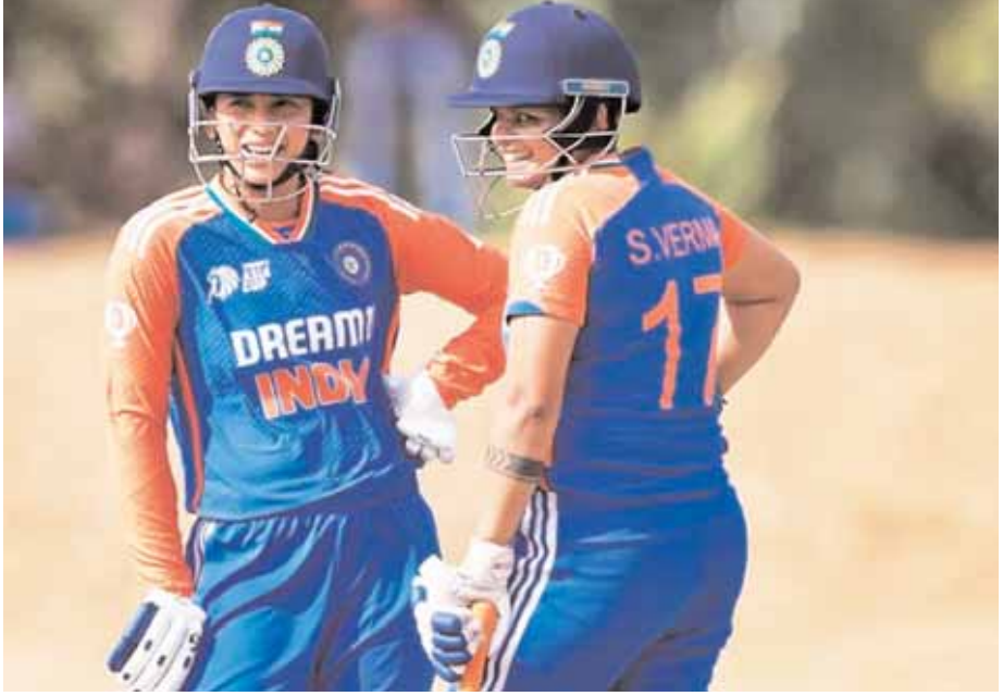
"We understand how important we both are to the team, especially during the powerplay, so we try to perform well for ourselves, our teammates, and the country." The younger partner added, "Smriti di is an exceptional timer of the ball, and she

Shafali Verma, the significant other of the blockbuster Indian opening pair, says her no-holds-barred approach goes well with Smriti Mandhana's elegance and both can "sense each others feelings just by our facial expressions" while batting. One of the factors behind the Indian women's cricket team's dominance in recent times has been the success of its openers, and Shafali admits they know how "important" they are to the team's fortunes. "I've been opening with Smriti for the past two-three years, and now we can sense each other's feelings just by our facial expressions while batting. We know each other's strengths and weaknesses, and we give each other positive vibes," Shafali told Star Sports when asked about her on-field relationship with Mandhana.