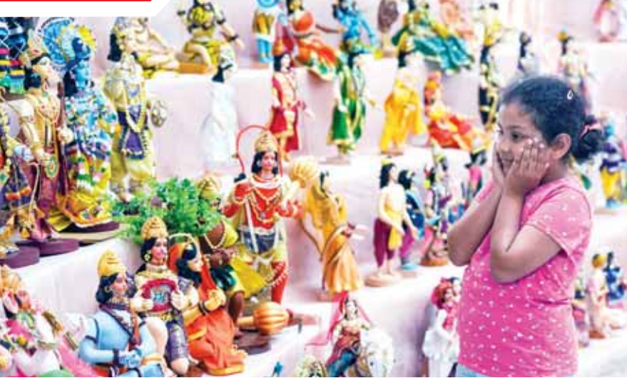
A child looks at dolls depicting scenes from Ramayana during the Dussehra Doll festival, in Bengaluru