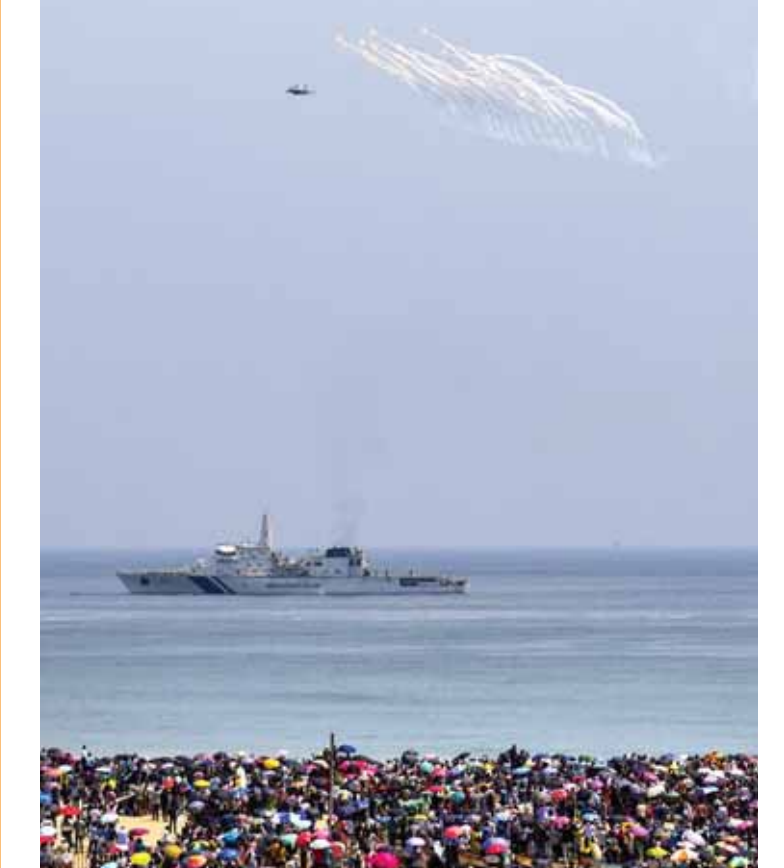
People watch the final rehearsal of Indian Air Force (IAF) aircrafts ahead of its 92nd anniversary celebrations, in Chennai