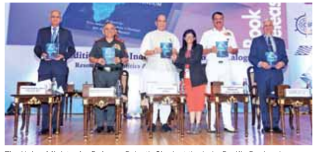
The Union Minister for Defence, Rajnath Singh at the Indo-Pacific Regional Dialogue (IPRD) 2024, in New Delhi on October 04, 2024