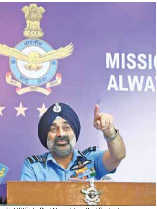
Chief of the Air Staff (CAS) Air Chief Marshal Amar Preet Singh addresses a press conference at Akash Air Force Mess, in New Delhi on Friday

China is rapidly developing infrastructure on its side across the Line of Actual Control (LAC) and India is also matching up by improving its airfields in the border areas, IAF chief AP Singh said here on Friday.