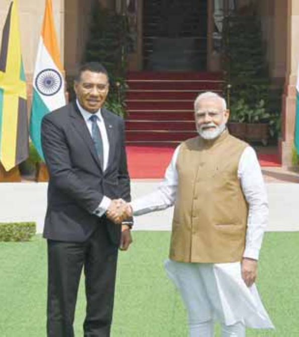
Prime Minister Narendra Modi with his Jamaican counterpart Andrew Holness prior to their meeting at Hyderabad House, in New Delhi on Tuesday.