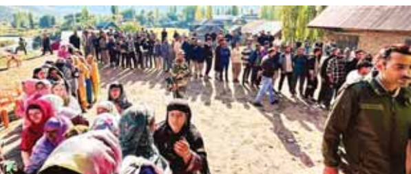
People wait in queues to cast their votes at a polling booth during the third and final phase of Jammu & Kashmir Assembly elections, at Gurez valley in Bandipora district, J and K, Tuesday