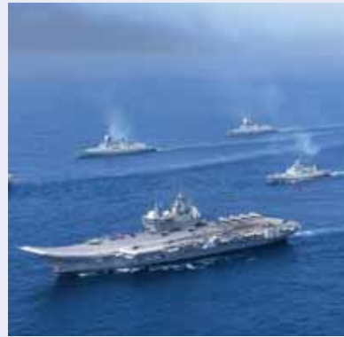
The Australian think tank 'Lowy Institute' ranked India as the third strongest Asian power in the Asia Power Index. US and China occupied the first and second position

followed by India in the third place. Considering the economic growth, future potential and the diplomatic influence of India on an improvement, India successfully managed to rank better with passing years than the countries like Japan, Australia and Russia.