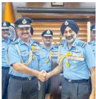
Academy, Defence Services Staff College and National Defence College, the air officer is a qualified flying instructor and an experimental test pilot with more

Air Chief Marshal A P Singh, an accomplished fighter pilot with more than 5,000 hours of flying experience, on Monday assumed charge as new chief of the Indian Air Force, succeeding incumbent Air Chief Marshal V R Chaudhari who superannuated. Air Chief Marshal Singh was serving as Vice Chief of the Air Force in his previous assignment. Born on October 27, 1964, Air Chief Marshal Singh was commissioned into the fighter pilot stream of the Indian Air Force in December 1984. In his long and distinguished service spanning nearly 40 years, he has served in a variety of command, staff, instructional and foreign appointments. An alumnus of the National Defence