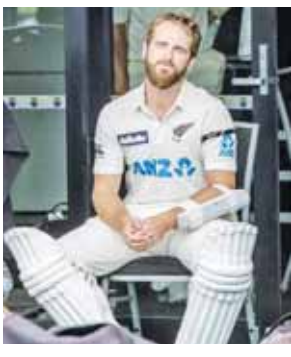
NZ head coach Gary Stead said in a media release. "While things are looking promising, we think the best course of action is for him to stay in New Zealand and focus on the final part of his rehabilitation so he'll be good to go for England," Stead added.

PTI ■ NEW DELHI Senior batter Kane Williamson will miss the third Test against India at Mumbai to ensure full recovery from a groin injury ahead of the home series versus England, starting from November 28. Williamson did not play in the first two Tests against India, which the Kiwis won to take an unassailable 2-0 lead in the three-match series. It also ended India's 18-series winning streak at home dating back to 2012. The final Test of the rubber will be played at the Wankhede Stadium from November 1. "Kane continues to show good signs, but isn't quite ready to jump on a plane and join us,"