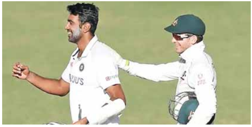
to him. I said we cannot wait to get you to the Gabba. "...Because he was annoying us, fair to say. He is a fantastic cricketer. He was getting me out all the time and that was annoying me as well," Paine said in a podcast of 'thegradecricketer'. Ashwin too replied in kind to Paine, saying: "Just like we wanna get you to India. That will be your last series."

PTI ■ MELBOURNE Former Australia captain and wicketkeeper batter Tim Paine doesn't regret sledging Ravichandran Ashwin during the third Test of the 2020-21 Border-Gavaskar Trophy, saying he did it to unsettle the India off-spinner, who was "annoying" him by getting his wicket frequently. After losing the series opener at Adelaide, India defied all odds to clinch the series 2-1. Ashwin played a vital role in drawing the third Test in Sydney, batting for 42.4 overs with an aching back alongside Hanuma Vihari. After failing to break Ashwin's resolve with the bat, Paine started poking the Indian from behind the stumps. "I can't wait to get you to the Gabba, Ash, I'll tell you what, woohoo," Paine said ahead of an over from off-spinner Nathan Lyon. But Paine does not regret it. "No, I don't because to this day Ashwin didn't play in that (Brisbane) Test match. I wasn't talking to the Indians, I was talking