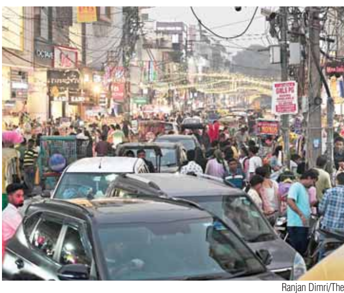
Ranjana Dimri/The Pioneer

colonies, encroachment and consequent traffic congestion in markets like Kamla Nagar." Another such market is also in the Govindpuri area where the weekly market, where day to day items are sold at affordable prices, on Wednesday creates a complete breakdown of traffic, making it extremely hard for not just vehicles but pedestrians to move. Further exacerbating the issue, are the encroachments by vendors who set up their shops on the roadsides, and the consumers who lead to limited space on the road for free flow of traffic on a street which is situated close to Govindpuri metro station and residential apartments. "I live in Govindpuri extension and every Wednesday, the roads that are already narrow due to encroachments and parking on the roadside become even worse. There are vendors with their shops and the customers are standing on the roads making it very