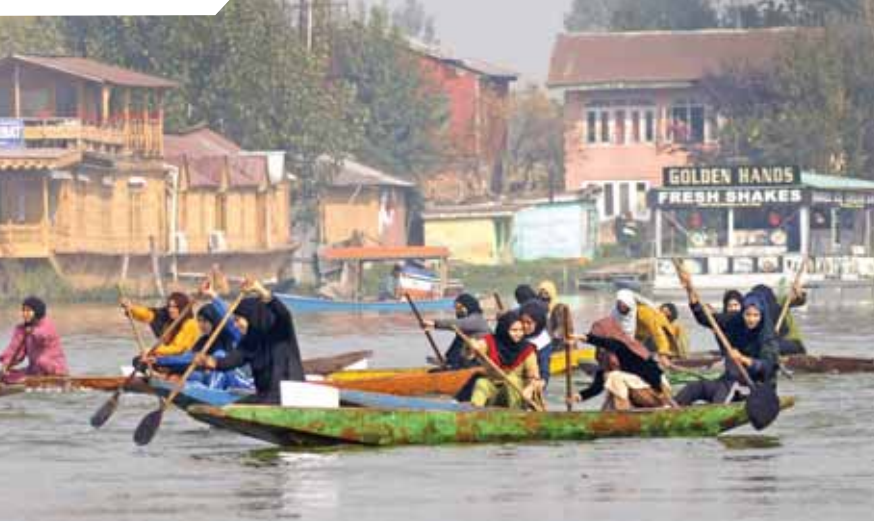
Women compete in a boat race at the Dal Lake, in Srinagar