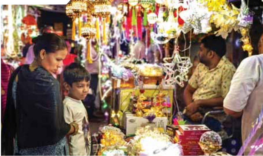
People buy decorative items at a market ahead of the Diwali festival, in Amritsar