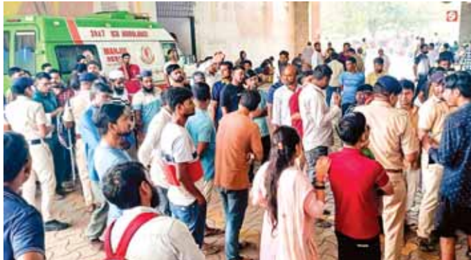
Police personnel, passengers and others at Bandra railway station after a stampede, in Mumbai, Sunday

At least 10 passengers were injured, two of whom severely, in a stampede that took place when scores of passengers rushed to board an unreserved compartment of the Gorakhpur-bound Antyodaya Express platform number-one of Bandra Terminus (BDTS) Railway Station in the small hours of Sunday. The incident took place at around 2.45 am, when the 22921 Antyodaya Express was slowly moving onto platform no 1 from the yard to head to Gorakhpur. A large number of passengers made headway into one of the unreserved compartments, leading to utter chaos and consequent stampede. "On 27.10.2024 at about 02.45 hrs, passenger train number 22921 Antyodaya Express was slowly being placed on platform number 01 from the BDTS yard, when some passengers present on the platform tried to board the moving train and 02 passengers fell and got injured," the Western Railway said in a statement issued here.