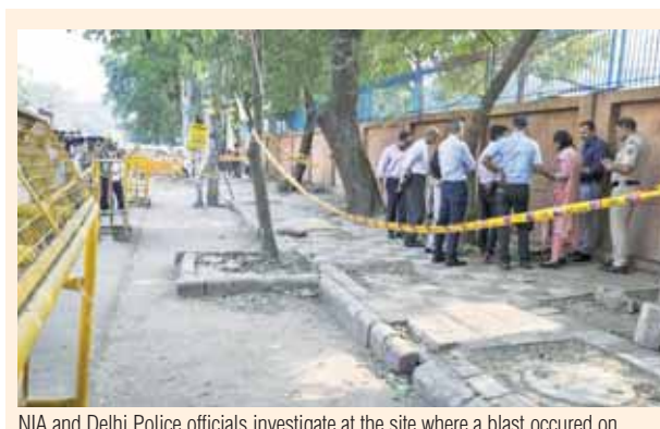
NIA and Delhi Police officials investigate at the site where a blast occurred on Sunday, near a CRPF school at Prashant Vihar, in Rohini area of New Delhi

year in Galwan. Twenty Indian army personnel including the commanding officer died in the clash while more than 40 Chinese troops were also killed. Both the sides then amassed troops and weaponry on their respective sides of the LAC. In fact, India, not willing to take any chances, also deployed its troops even during the winter months at the LAC. Earlier, the troops used to withdraw to their bases during the winters. At one point of time, more than 50,000 troops from each side were facing each other on friction points at the LAC. Given the situation, India and China, since 2020, held several rounds of talks at the military and diplomatic levels. While Corps Commanders of the two sides held military level talks, the diplomatic level talks were held under the aegis of Working Mechanism for Consultation and Coordination (WMCC) on India-China Border Affairs.