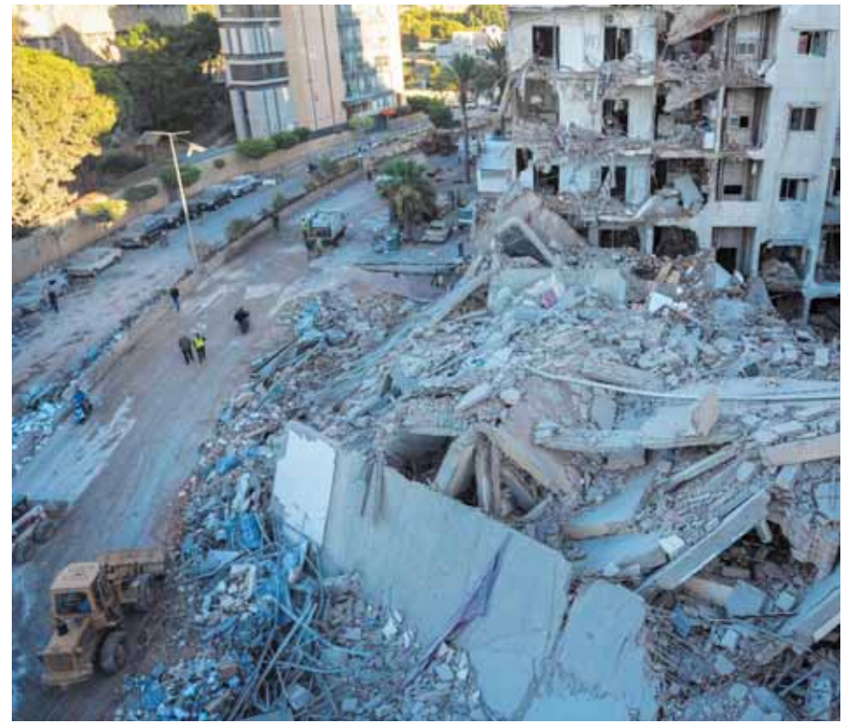
Rescue workers use a bulldozer to remove rubble of destroyed buildings at the site of an Israeli airstrike on Sunday night that hit several branches of the Hezbollah-run Qard al-Hassan Association in Beirut's southern suburb, Lebanon, on Monday.

urged Israel to scale back some strikes, especially in and around Beirut. In a separate development, the Israeli military apologised for a strike on Sunday in southern Lebanon that killed three Lebanese army soldiers. It said it targeted a vehicle in an area that Hezbollah had recently used for attacks without realising it belonged to the Lebanese military. The military said it is "not operating against the Lebanese Army and apologises for these unwanted circumstances". Lebanon's army is a respected institution within the country, but it is not powerful enough to impose its will on Hezbollah or defend Lebanon from Israel's invasion. The army has largely kept to the sidelines as Israel and Hezbollah have traded blows over the past year.