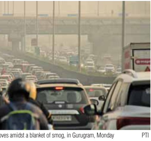
Heavy evening traffic moves amidst a blanket of smog, in Gurugram, Monday

Gate ISBT, Sadar Bazar, Chirag Dilli, roads surroundings major markets including Sarojini Nagar, Chandni Chowk, Lajpat Nagar, Kamla Nagar were among those areas witnessed heavy traffic on Monday. These stretches are the busiest roads known for heavy traffic flow during the week. Lakhs of people commute in and from Delhi to Gurugram, Noida, Faridabad and Ghaziabad daily. Neighbouring Noida has been consistently contributing between 10 and 11 per cent to Delhi's pollution, while Ghaziabad's share ranges from 5 to 10 per cent, as per the DSS -