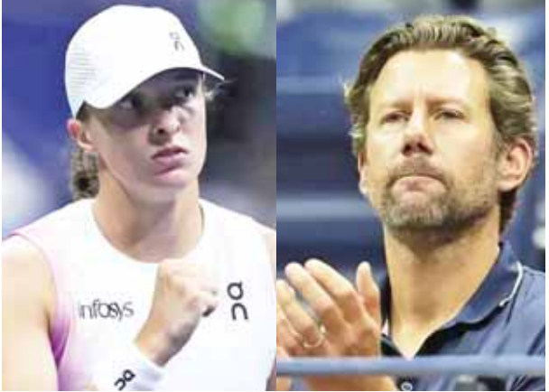
on Thursday. "I want to say that I'm very excited and looking forward to working with Wim. He seems to have a great attitude, vision and huge experience at a very top level of tennis. It's always crucial to try and get to know each other better but we're off to a good start and I can't wait to compete soon." Swiatek is 54-7 this season with five titles and about $7.5 million in prize money. She won the French Open in June for her third consecutive title in Paris and fourth in the past five years, raising her career haul to five Grand Slam

AP ■ WASHINGTON Iga Swiatek is hiring Wim Fissette to be her new coach, announcing via social media that she is bringing aboard someone who has worked with a long list of top players that includes Naomi Osaka, Kim Clijsters and Victoria Azarenka. "I'm excited and motivated to start a new chapter," posted the No. 1-ranked Swiatek, who parted ways with Tomasz Wiktorowski two weeks ago after three years together. Swiatek hasn't competed since Sept. 4, when she lost in the U.S. Open quarterfinals to eventual runner-up Jessica Pegula. Since then, Swiatek withdrew from the China Open and Korea Open. Next up for Swiatek is the season-ending WTA Finals, which will be held in November in Riyadh, Saudi Arabia. "As you know, I'm preparing for the WTA Finals but my perspective is, as always, long-term, not short-term. I said many times that my career is a marathon for me, not a sprint, and I'm working, operating and making decisions with this approach," Swiatek wrote