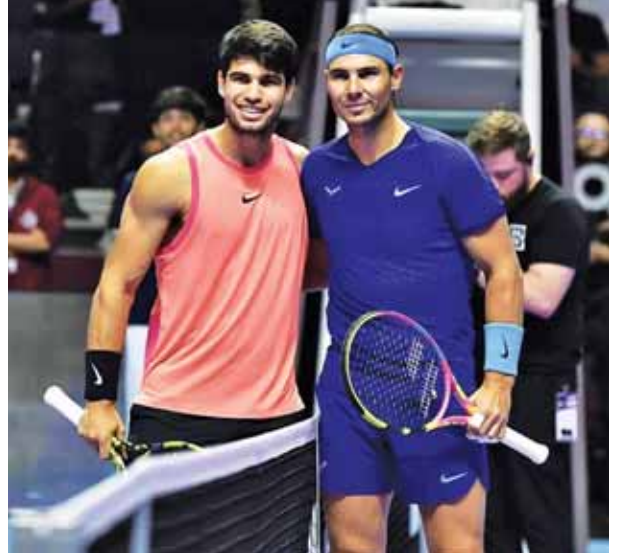
at the Paris Olympics in July. "Carlos was too good. I haven't been on the competitive stage since a couple months ago," Nadal said. "So yeah I think it was a good performance, even if it was not enough to play against an animal like him. But it was a positive match for me and I'm happy." Nadal will play Djokovic on Saturday in a third-place

AP ■ RIYADH With an eye on the Davis Cup, Rafael Nadal said he was pleased with his performance despite losing 6-3, 6-3 to Carlos Alcaraz at the Six Kings Slam. Jannik Sinner beat Novak Djokovic 6-2, 6-7 (0), 6-4 in the other semifinal at the exhibition event that awards money but no ATP ranking points and is Saudi Arabia's latest foray into tennis. The match against Alcaraz was Nadal's first since he announced last week that he would be retiring after playing for Spain in the Davis Cup next month. Nadal and Alcaraz played doubles together at the Paris Games and could team up again for the Davis Cup. "I have the Davis Cup in front of (me) in a month so every day is an opportunity to be better and better and be ready for this final tournament of my tennis career," Nadal said. "I want to try my best to be ready for that and help the team in some way." Thursday's match was the first contest for Nadal since his exit