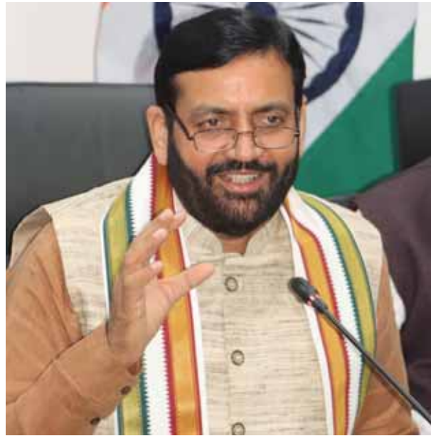
Haryana Chief Minister Nayab Singh Saini addresses media persons after his maiden cabinet meeting on the first day at Haryana Civil Secretariat in Chandigarh on Friday.

Haryana Chief Minister Nayab Singh Saini on Friday announced all government hospitals in Haryana will offer free dialysis services to chronic kidney patients, fulfilling the ruling BJP's first poll promise. Addressing a press conference after presiding over the first meeting of his cabinet, the chief minister said the state will also implement the Supreme Court's decision empowering states to make sub-classifications within the Scheduled Castes for granting reservation "today itself". Saini said his cabinet has decided to implement the decision of the Supreme Court which held that states are constitutionally empowered to make sub-classifications within the Scheduled Castes for granting reservation. "In the first meeting, our cabinet has decided to implement the decision from today itself," he said. The decision will ensure a fair distribution of benefits within the existing reservation system, it said. Currently, there is a 15 per cent reservation for SC and a 7.5 per cent reservation for Scheduled Tribe communities. With this decision, Haryana will be able to allocate specific quotas within this 22.5 per cent reservation to those sub-groups within SCs and STs that have