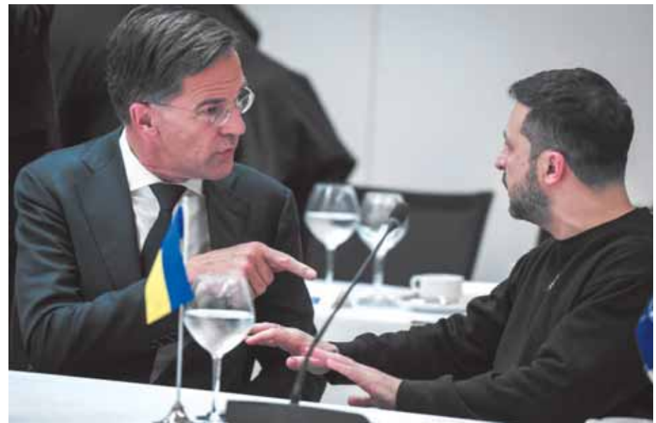
NATO Secretary General Mark Rutte (left) speaks with Ukraine's President Volodymyr Zelenskyy during the NATO-Ukraine Council working dinner at NATO Headquarters in Brussels on Thursday.