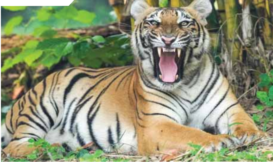
A Royal Bengal tiger yawns at the National Zoological Park, in New Delhi