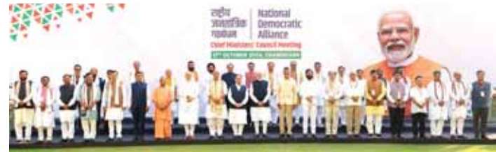
Prime Minister Narendra Modi, Defence Minister Rajnath Singh, Health Minister JP Nadda with NDA Chief Ministers during National Democratic Alliance Chief Ministers' Council Meeting, in Chandigarh, Thursday

All the 13 Chief Ministers and 16 Deputy CMs of the Bharatiya Janata Party (BJP) and its allies such as Telugu Desam Party (TDP), Janata Dal (United), Shiv Sena viz chief ministers of Maharashtra, Andhra Pradesh, Bihar, Sikkim, Nagaland, and Meghalaya vowed to work together for national development during the meeting of the National Democratic Alliance Chief Ministers' Council in Chandigarh, chaired by Prime Minister Narendra Modi. The meeting was called to discuss national development issues. The meeting schedule holds significance as it has come ahead of the Maharashtra and Jharkhand Assembly polls, and soon after the historic victory in Haryana and formation of a new government in Jammu and Kashmir. Twenty CMs of the NDA, and their deputies engaged in the half-day conclave, the first of its kind after many years. "Chaired a meeting of NDA Chief Ministers and Deputy Chief Ministers. We had extensive discussions on aspects of good governance and ways to improve people's lives. Our