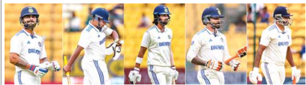
(L-R) Virat Kohli, Sarfaraz Khan, KL Rahul, Ravindra Jadeja and R Ashwin walking off the ground after being dismissed for a duck during the second day of the first Test cricket match between India and New Zealand, at M Chinnaswamy Stadium, in Bengaluru, Thursday