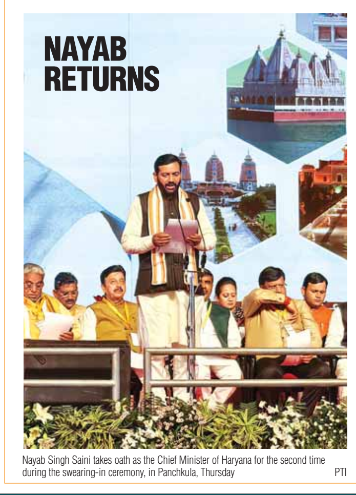
Nayab Singh Saini takes oath as the Chief Minister of Haryana for the second time during the swearing-in ceremony, in Panchkula, Thursday

With the peaceful culmination of the Assembly polls in Jammu and Kashmir, Pakistan-based terrorist groups, operating in the Pir Panjal region, are once again planning to target security forces in the area. Late Wednesday night, alert troops after observing suspicious movement of a group of heavily armed terrorists challenged them in the thickly forested area of Gursai top in Poonch. Taking advantage of the pitch-dark conditions and undulating hostile terrain the group of terrorists may have managed to flee the area. To track down their footprints, the security forces swiftly launched a massive search operation at Mohri Shashar in the Gursai top area of Poonch district.