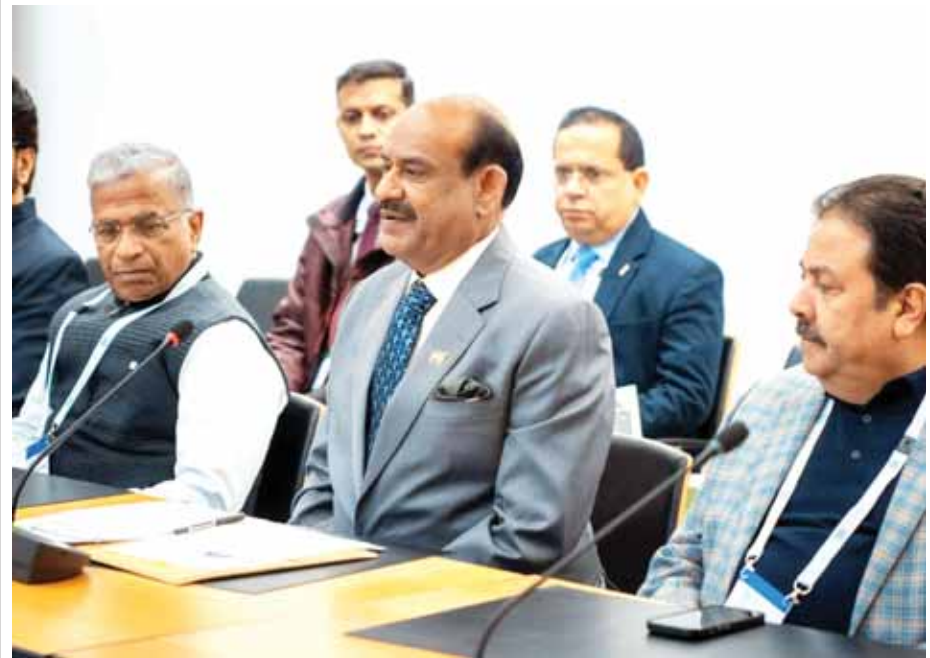
Lok Sabha Speaker Om Birla, Rajya Sabha Dy. Chairperson Harivansh and Indian Parliamentary delegates on the sidelines of 149th Assembly of IPU in Geneva on Thursday.

support. Stiell pointed out that at COP29, nations will have the opportunity to decide on contributions, but he cautioned against renegotiating the Paris Agreement. Some developed nations propose broadening the list of contributors to include emerging economies like China and certain Gulf states, a move that developing countries argue undermines equity principles and shifts responsibility away from those historically responsible for emissions. "More work also has to be done to rapidly ramp up funding for adaptation and get international carbon markets working for everyone. We must fund a new generation of national climate plans," he added.