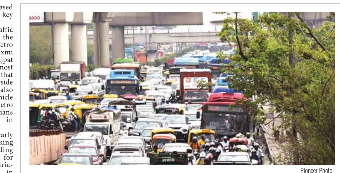
This is expected to result in total daily savings of 593 litres of petrol, 103 litres diesel and 643 kg CNG, and total CO2e (equivalent) reduction of 3.5 tonne/day in all the five metro stations. It is evident that the sustainable scenarios (viz. segregation/shifting of on-street parking, signal design, etc.) or similar to those that have been suggested, would result in

congestion. The report was based on a study conducted at five key Metro stations in Delhi. To understand the traffic situation on the ground, the CRR selected five key Metro stations - Karol Bagh, Laxmi Nagar, Kailash Colony, Lajpat Nagar and Inderlok - in the most crowded locations in the city that always see heavy traffic outside the premises. These are also stations where not only vehicle users face problems, but Metro users as well as pedestrians complain of discomfort in movement and safety issues. The study has clearly demonstrated that parking related policies (including segregated parking lanes for cycle rickshaws and electric-rickshaws) can result in improvement in vehicular speed by two to six km/h in the influence zone of the selected metro stations for all categories of motorised vehicles.