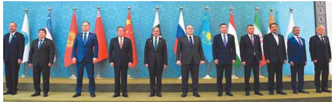
Pakistan's Prime Minister Shehbaz Sharif (centre), China's Premier Li Qiang, Belarus Prime Minister Roman Golovchenko, Russian Prime Minister Mikhail Mishustin, Kazakhstan's Prime Minister Olzhas Bektenov, Tajikistan's Prime Minister Kokhir Rasulzoda, and other leaders pose for group photo at the opening session of Shanghai Cooperation Organization (SCO) meeting in Islamabad, on Wednesday.

Pakistan Prime Minister Shehbaz Sharif on Wednesday rooted for Beijing's Belt and Road Initiative at the SCO summit here, saying such connectivity projects should not be viewed through a "narrow political prism" — an apparent reference to India's reluctance to endorse it. In his opening remarks at the Shanghai Cooperation Organisation summit, he said efforts like China's Belt and Road Initiative and the China-Pakistan Economic Corridor, which is a part of the larger project, should be expanded. India has shown little enthusiasm for the China's "unilateral" initiative. And it has repeatedly criticised the China-Pakistan corridor for violating its territorial integrity as it involves building infrastructure in Pakistan-occupied Kashmir. Indirectly challenging India's position, Sharif said, "Let us not look at such projects through the narrow political prism, and invest in our collective connectivity capacities which are crucial to advancing the shared vision of an economically integrated region." In his speech later, External Affairs Minister S Jaishankar said trade and connectivity initiatives must recognise territorial integrity and sovereignty and it is essential to have an "honest conversation" on lack of trust, a remark seen as an indirect reference to China. The SCO comprises China, India, Russia, Pakistan, Iran, Kazakhstan, Kyrgyzstan, Tajikistan, Uzbekistan and Belarus. Sixteen more countries are affiliated as observers or "dialogue partners".