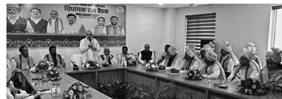
Union Home Minister and party observer Amit Shah, Dharmendra Pradhan, Manohar Lal Khattar and newly elected Haryana BJP legislative party leader Nayab Singh Saini in the BJP Legislature Party meeting at Panchkula on Wednesday.

For the second time, Panchkula will be hosting the swearing-in ceremony of the BJP government. The ceremony will be held at the Dussehra ground at 11 am in Sector 5. Earlier, the swearing-in ceremony was planned for October 15, but owing to PM Modi's availability on October 17, it