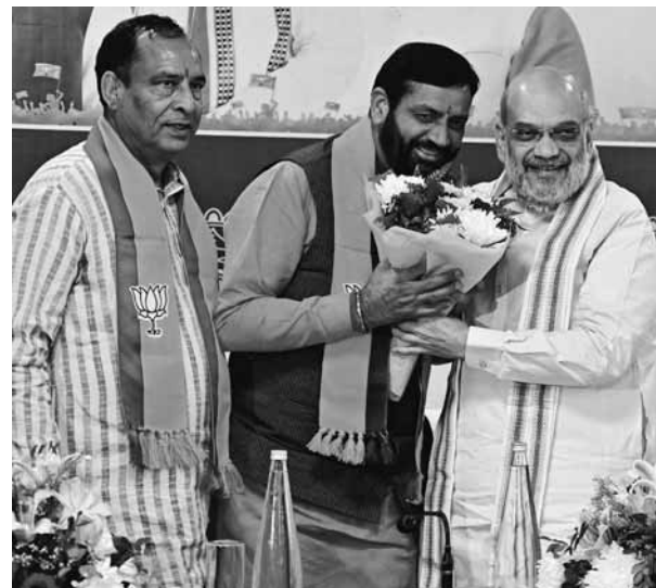
Union Home Minister Amit Shah greets newly elected BJP legislative party leader Nayab Singh Saini after his unanimous election to become state's Chief Minister on Wednesday.

Saini, the OBC face of the saffron party, who was declared as the party's Chief Ministerial candidate in the run-up to the October 5 Assembly elections, was elected as the leader in view