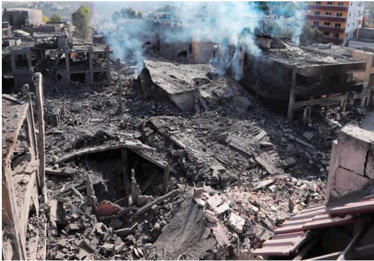
Smoke rise from destroyed buildings that were hit by Israeli airstrikes in Qana village, south Lebanon on Wednesday.

Israeli jets struck the southern suburbs of Beirut early Wednesday for the first time in six days, Lebanese state media reported. The casualty count was not yet clear. The attack comes just one day after caretaker Prime Minister Najib Mikati said the United States government gave him some assurances of Israel easing its strikes in the Lebanese capital. Israel says it is striking Hezbollah assets in the suburbs, where the militant group has a strong presence, but it is also a busy residential and commercial area. The Israeli military said the Wednesday strike hit a weapons warehouse under a residential building. The Israeli military posted an evacuation warning on the X platform saying it is targeting a building in the Haret Hreik neighborhood. An Associated Press photographer who witnessed the strikes said there were three in the area. The first strike was documented less than an hour after the notice.