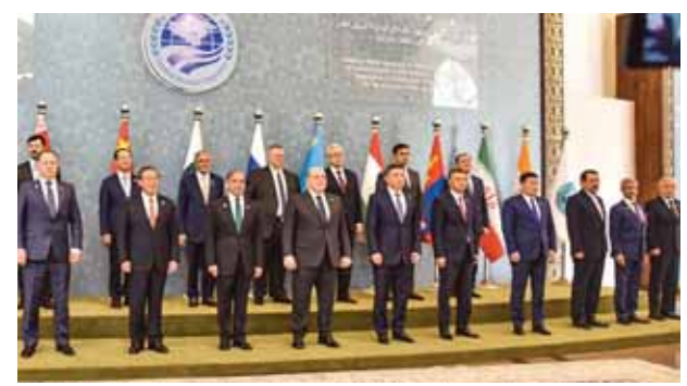
External Affairs Minister S Jaishankar with Pakistan Prime Minister Shehbaz Sharif and other leaders during the 23rd meeting of the SCO Council of Heads of Government, in Islamabad, Pakistan, Wednesday