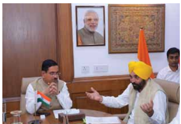
that procurement will continue uninterrupted, assured that this demand would be sympathetically con-

Mann urged the Centre to liquidate 20 LMT of foodgrains per month, utilizing schemes like the Open Market Sale Scheme (OMSS) and ethanol allocations to ensure smooth operations in the state's mandis. The Centre's agreement to this demand ensures