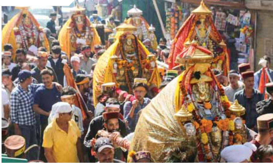
Devotees carry the palanquin of the deities to participate in the Dussehra festival, in Kullu