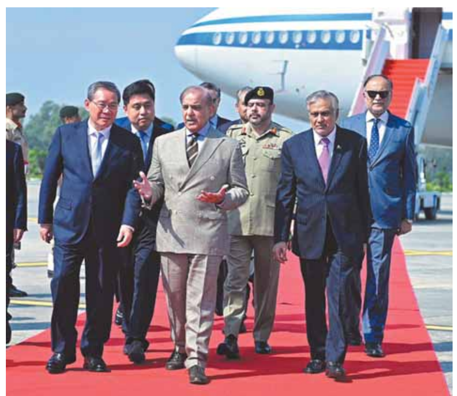
China's Premier Li Qiang (left) walks Pakistan's Prime Minister Shehbaz Sharif (second left) upon his arrival at an airbase in Rawalpindi, Pakistan on Monday.

Government (CHG) meeting of the Shanghai Cooperation Organisation (SCO) here to discuss the ongoing cooperation in economy, trade and environment. The CHG meeting will discuss ongoing cooperation in the fields of economy, trade, environment, socio-cultural linkages and review the performance of the Organisation. The leaders will adopt important organisational decisions to further enhance cooperation among SCO member States and approve the budget of the Organisation. Prime Minister Shehbaz Sharif, in his capacity as the current Chair of the CHG, will preside over the upcoming CHG meeting. According to the Foreign Office, the SCO member States will be represented by the Prime Ministers of China, Russia, Belarus, Kazakhstan, Kyrgyzstan, Tajikistan and Uzbekistan as well as the First Vice President of Iran apart from Jaishankar.