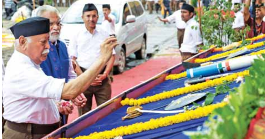
Rashtriya Swayamsevak Sangh (RSS) chief Mohan Bhagwat performs 'Shastra Puja' during a function organised on the occasion of 'Vijayadashami', in Nagpur, Saturday, October 12, 2024

Rashtriya Swayamsevak Sangh (RSS) chief Mohan Bhagwat on Saturday gave a clarion call for unity among the Hindus to strengthen the community and simultaneously stated that 'Deep State', 'wokeism' and 'cultural Marxist' are declared enemies of all cultural traditions. Condemning the violence against Hindus in Bangladesh, Bhagwat said that as long as the radical nature of committing atrocities out of anger persists — not only Hindus, but all minorities will be in danger. He said what is happening in Bangladesh is also a learning for Hindus in India. "If we are weak, we are inviting atrocity. Wherever we are, we need to be united and empowered and weakness is not an option," he said. "What happened in our neighbouring Bangladesh? It might have some immediate reasons and those who are concerned will discuss it. But the underlying issue is the repeated atrocities against Hindus. But for the first time, Hindus united to protect themselves, but as long as this radical violence persists, not just Hindus, but all