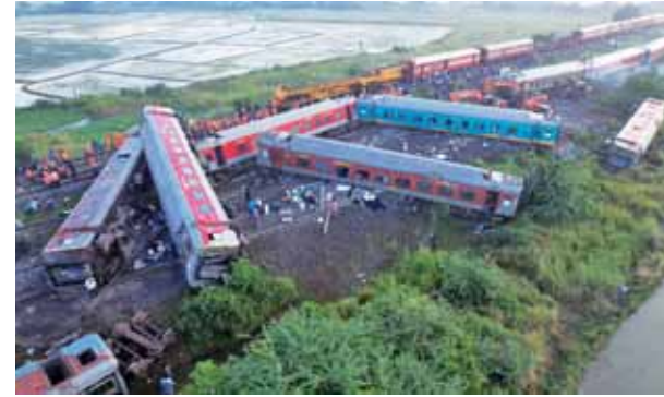
Restoration work underway after an express train rammed into a stationary train on Friday, at Kavaraipettai in Tiruvallur district, Saturday, October 12, 2024

A day after a passenger train Arammed into a stationary freight train near Chennai, experts and union leaders said according to the data-logger video, the Mysuru-Darbhanga Express train was given a green signal to pass through the main line, however, it entered a loop line already occupied by the freight train. Train number 12578, Mysuru-Darbhanga Bagmati Express, collided with the stationary goods train at the Kavaraipettai railway station in the Chennai rail division in Tamil Nadu at around 8:30 pm on Friday, leading to injuries to nine passengers. The data logger is a device placed in the station area to capture train movements and signal aspects, among other things. This data logger's yard-simulation video has been circulated among senior railway officials' WhatsApp groups since Saturday morning, prompting them to draw a parallel between the accident and the Balasore train collision of June 2, 2023. Chief Public Relations Officer (CPRO) of the Southern Railway said he is not aware of any such video and that multiple investigations have already been initiated into the collision. In a Press statement, the Railway Board also admitted that the passenger train was given a green signal for the