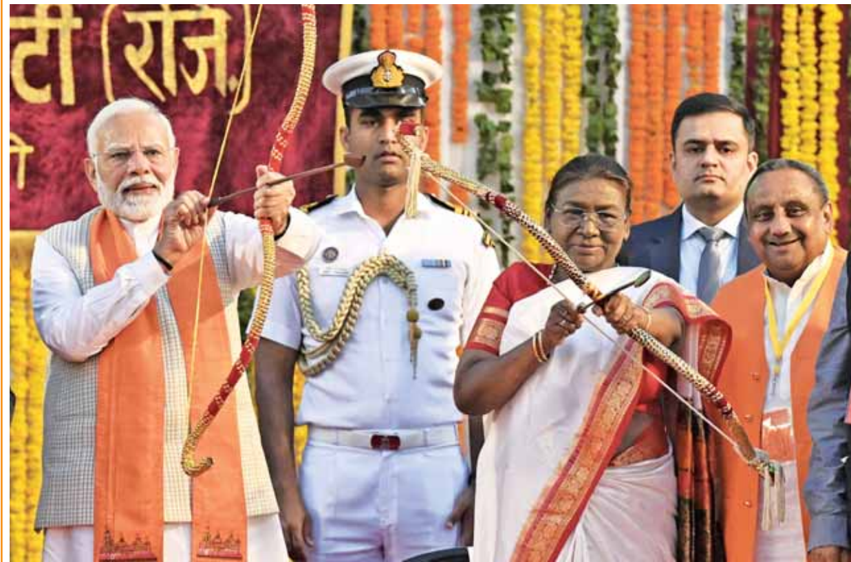
President Droupadi Murmu and Prime Minister Narendra Modi hold bow and arrow during 'Dussehra' (Vijayadashami) celebration organised by Shri Dharmik Leela Committee, Red Fort, in New Delhi