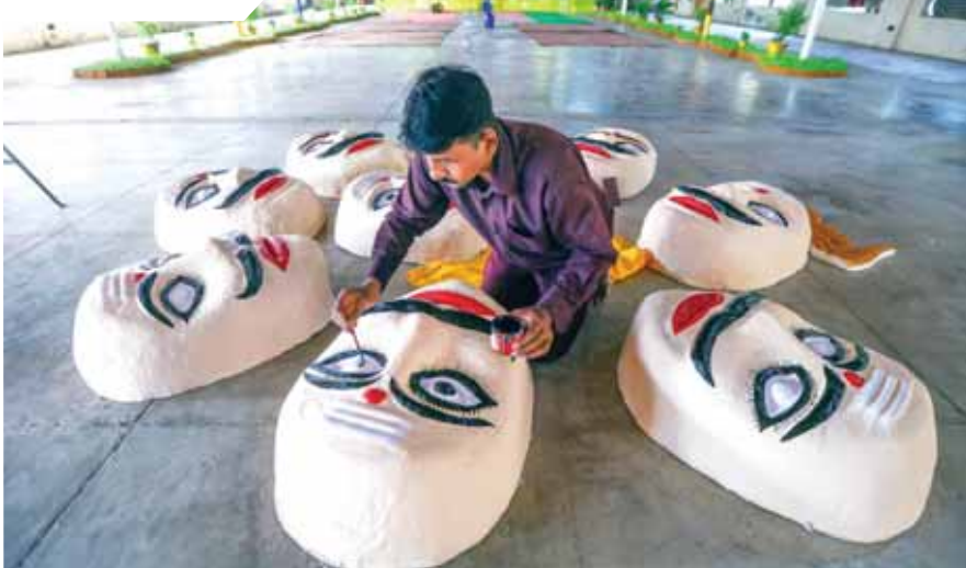
An artist paints effigies of the demon king Ravana on the Dussehra, in Prayagraj