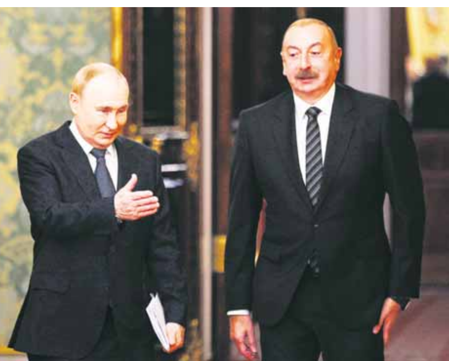
Russian President Vladimir Putin (left) and Azerbaijani President Ilham Aliyev enter the hall during a meeting of the heads of state of the Commonwealth of Independent States (CIS) at the Kremlin in Moscow, Russia, on Tuesday.