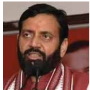
promises in states like Himachal Pradesh, Karnataka and Telangana.

The ruling party's poll campaign focused on alleged corruption, favouritism and scams during the Congress rule with Saini crisscrossing the state to tell people about the BJP government's achievements. The BJP also told voters about the Congress' "failure" to fulfil poll