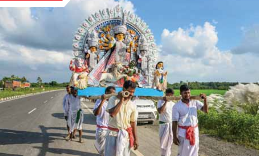
Devotees carry an idol of Goddess Durga to a puja venue, in Nadia