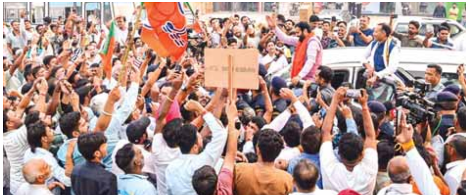
Haryana Chief Minister Nayab Singh Saini greets supporters after winning the Assembly elections from Ladwa constituency, at Ladwa, in Kurukshetra district, Tuesday

Among prominent candidates, Chief Minister Nayab Singh Saini, Congress leader Bhupinder Singh Hooda, and his new party colleague Vinesh Phogat won, as did Independent candidate Savitri Jindal. The INLD's Abhay