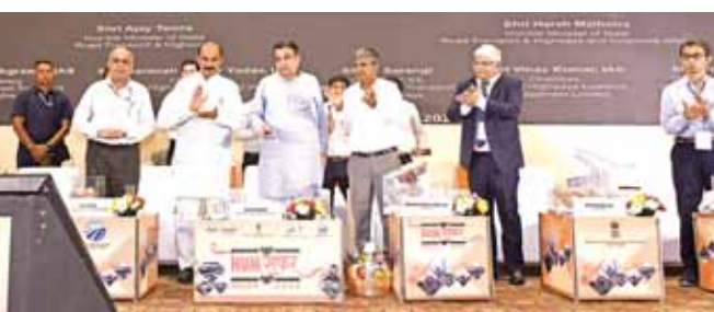
The Union Minister of Road Transport and Highways, Shri Nitin Gadkari launching the 'Humsafar Policy' 2024 at The Ashok Hotel, in New Delhi