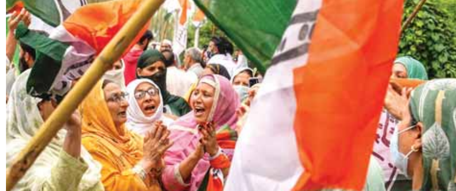
Supporters of Congress and National Conference (NC) celebrate as the Congress-NC alliance leads during the counting of votes of Jammu & Kashmir Assembly elections, in Srinagar, Tuesday