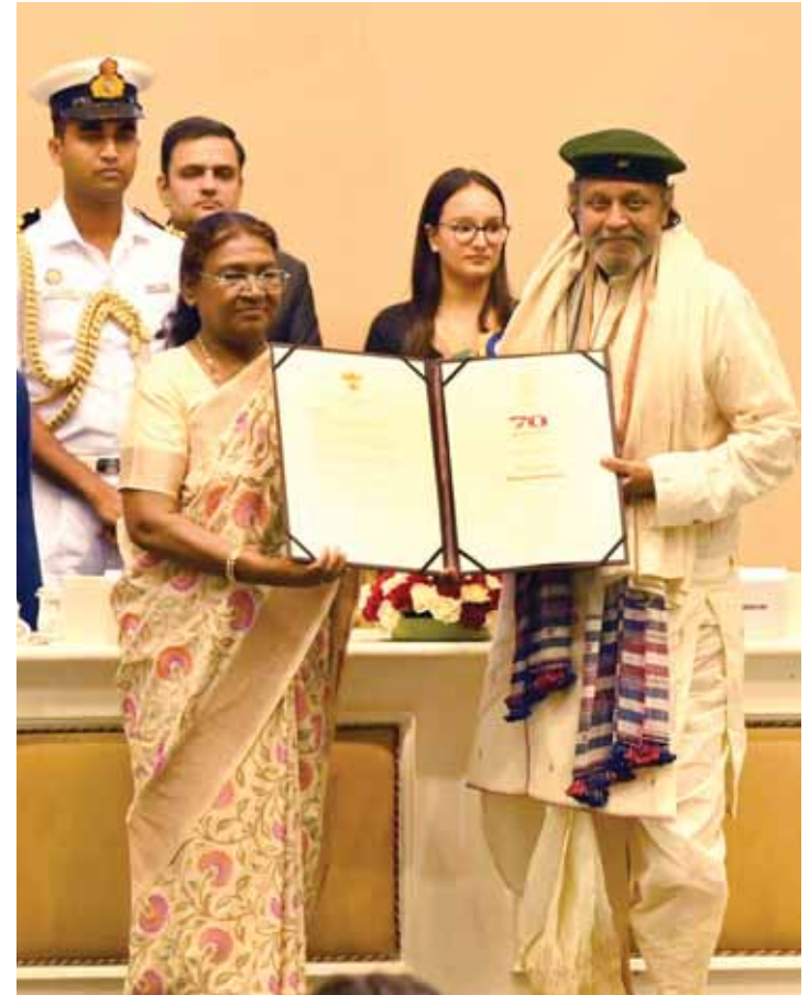
President Droupadi Murmu presents the Dadasaheb Phalke Award to veteran actor Mithun Chakraborty during the 70th National Film Award ceremony at Vigyan Bhawan, in New Delhi, Tuesday