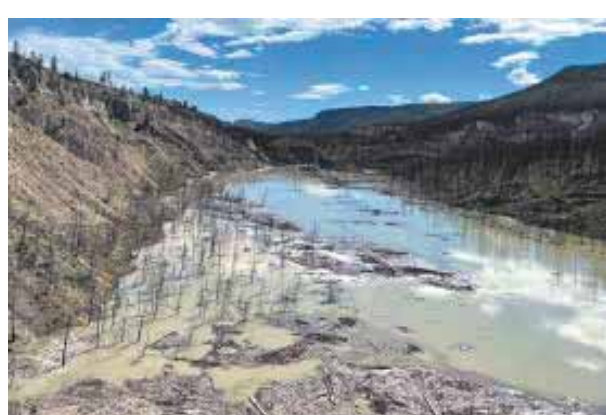
Monday. She said rising temperatures had in part led the hydrological cycle to become "more erratic and unpredictable" in ways that can produce "either too much or too little water" through both droughts and floods. The weather agency, citing figures from UN Water, says some 3.6 billion people face inadequate access to water for at least one month a year - and that figure is expected to rise to 5 billion by 2050. The world faced the hottest year on record in 2023, and the summer of this year was also the hottest summer ever -

Geneva (AP): The UN weather agency on Monday said that 2023 was the driest year in more than three decades for the world's rivers, as the record-hot year underpinned a drying up of water flows and contributed to prolonged droughts in some places. The World Meteorological Organisation in a report also said glaciers that feed rivers in many countries suffered the largest loss of mass in the last five decades, warning that ice melt can threaten long-term water security for millions of people globally. "Water is the canary in the coalmine of climate change. We receive distress signals in the form of increasingly extreme rainfall, floods and droughts which wreak a heavy toll on lives, ecosystems and economies," said WMO Secretary-General Celeste Saulo, releasing the report on