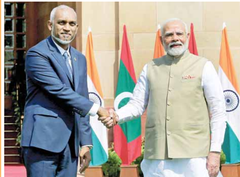
Prime Minister Narendra Modi shakes hands with Maldives President Mohamed Muizzu prior to a meeting at Hyderabad House