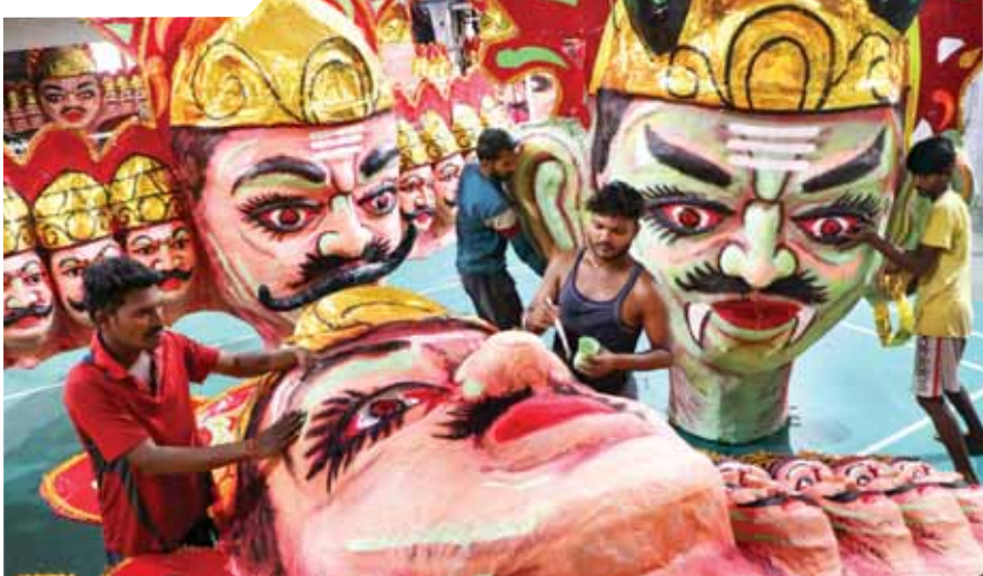
An artisan gives finishing touches to effigies of Ravana and Meghanad ahead of the Dussehra festival, in Nagpur