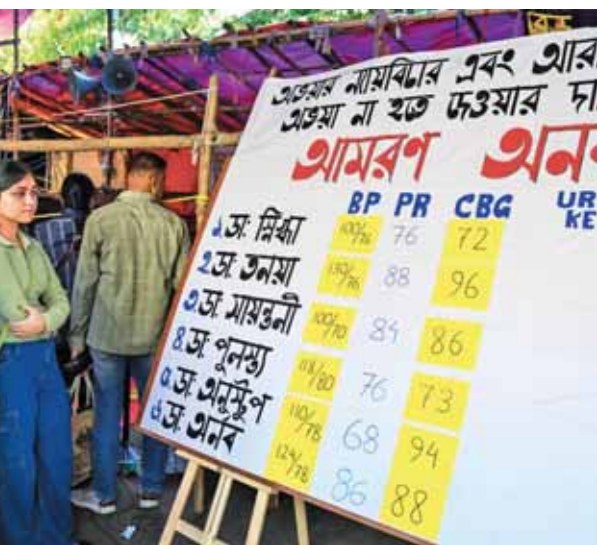
A chart shows medical parameters of some junior doctors protesting against the RG Kar Medical College and Hospital rape and murder incident, in Kolkata