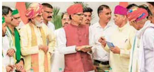
Union Minister for Agriculture and Farmers Welfare Shivraj Singh Chouhan during a meeting with farmers