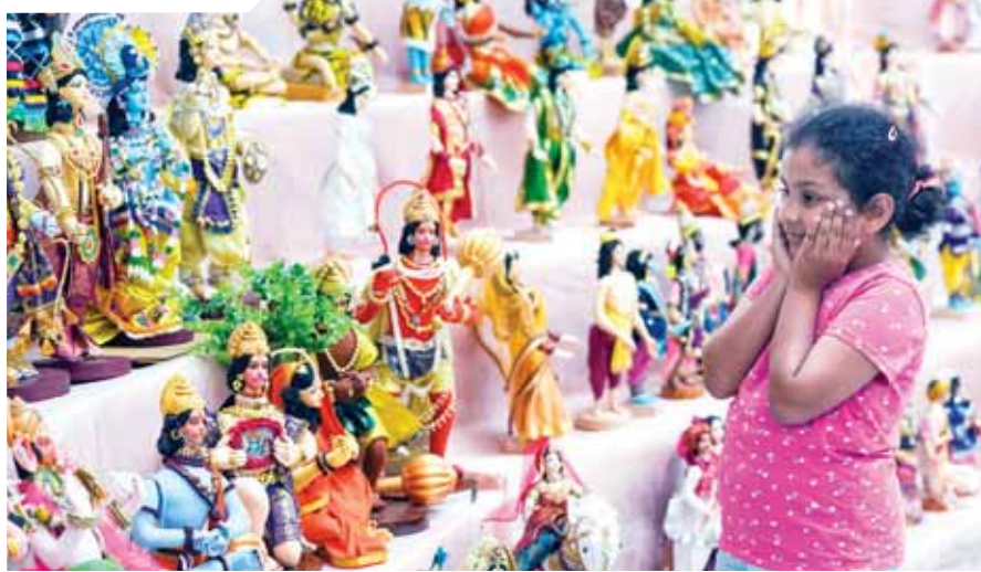
A child looks at dolls depicting scenes from Ramayana during the Dussehra Doll festival, in Bengaluru