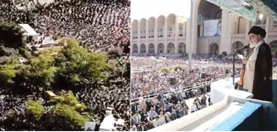
■ TEHRAN/BEIRUT

Iran's supreme leader on Friday praised the country's recent missile strike on Israel and said it was ready to do it again if necessary, state TV reported. Ayatollah Ali Khamenei, in his first appearance as leader, in about five years, at Friday prayers, called the missile strike a "shining" job by Iran's armed forces. On the other hand Israel carried out a series of massive airstrikes overnight, hitting suburbs of Beirut and cutting off the main border crossing between Lebanon and Syria for tens of thousands of people fleeing Israeli bombardment.