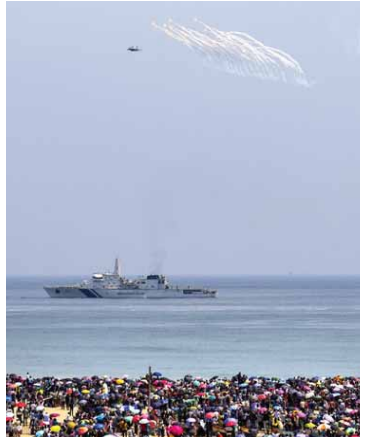
People watch the final rehearsal of Indian Air Force (IAF) aircrafts ahead of its 92nd anniversary celebrations, in Chennai