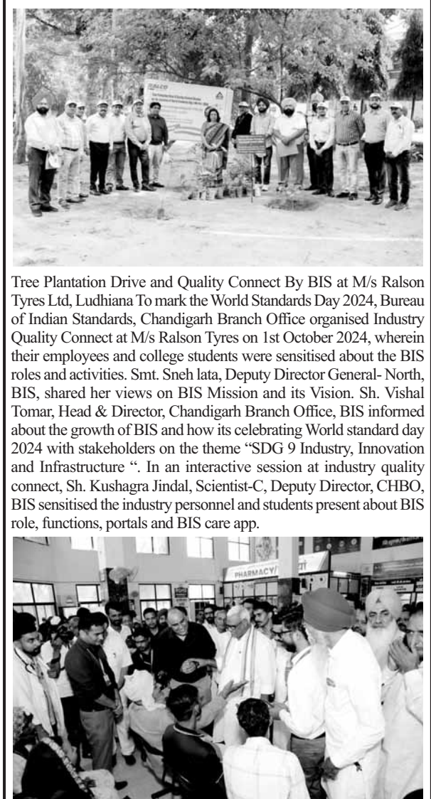
Tree Plantation Drive and Quality Connect By BIS at M/s Ralson Tyres Ltd, Ludhiana To mark the World Standards Day 2024, Bureau of Indian Standards, Chandigarh Branch Office organised Industry Quality Connect at M/s Ralson Tyres on 1st October 2024...

Sincerely, Authorised Signatory For ICICI Bank Ltd.