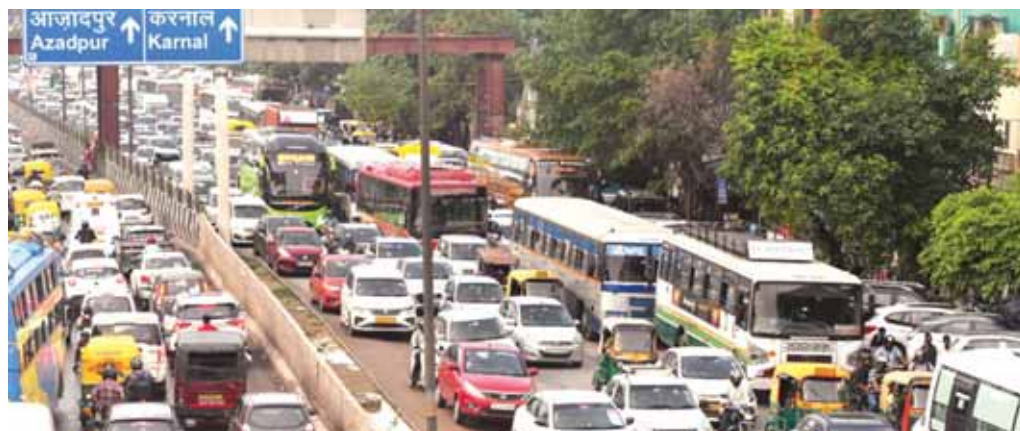
A Traffic Jam Vehicles move on road at isbt kashmiri gate