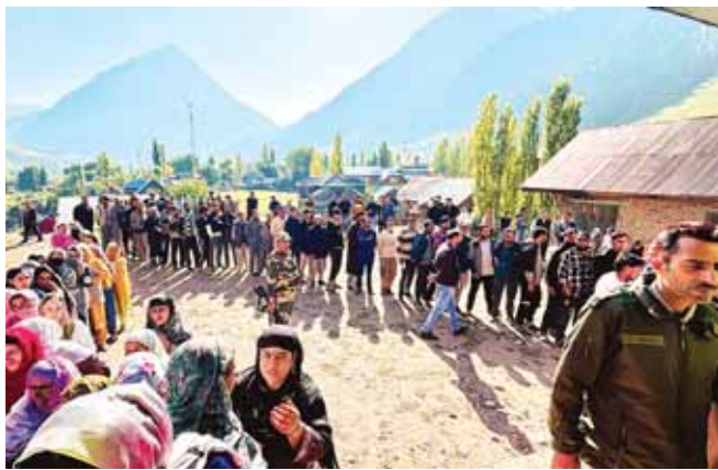
People wait in queues to cast their votes at a polling booth during the third and final phase of Jammu & Kashmir Assembly elections, at Gurez valley in Bandipora district, J and K, Tuesday

The highest voter turnout of over 66 per cent was recorded across 40 Assembly segments across seven districts on Tuesday. The first and the second phases witnessed 61.38 and 57.31 per cent voter turnout respectively. The first-time voters, belonging to the West Pakistani refugee community, Valmikis, and Gorkha community danced to the polling booths in jubilation and also distributed sweets as they exercised their right to franchise for the first time in the Assembly polls. In the Jammu region, 18 out of 24 Assembly segments (across