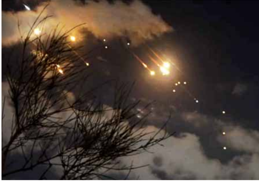
This image taken from video shows projectiles being intercepted over Jerusalem, Israel, Tuesday