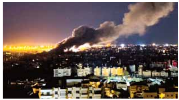
Smoke rises from an Israeli airstrike that hit the southern suburb of Beirut, Lebanon, Tuesday

The border region has largely emptied out over the past year as the two sides have traded fire. But the scope of the evacuation warning raised questions as to how deep Israel plans to send its forces into Lebanon.