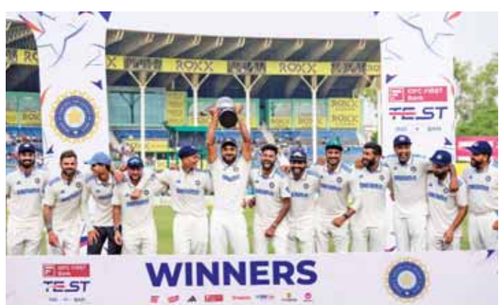
Indian cricket team players pose for photographers with the trophy after winning the second test cricket match between India and Bangladesh, at the Green Park stadium, in Kanpur, Tuesday

The Indian cricket team broke many records and secured a comprehensive Test series victory against Bangladesh on Tuesday. With this win India sealed the series. The game was disrupted due to heavy rain on day two and three. India pulled out a seven wicket win in a historic Test Match at Kanpur. Indian bowlers made their mark, and wiped out team Bangladesh with 233 in the first innings. Jasprit Bumrah took the charge with spin duo R. Ashwin-Ravinder Jadeja to swing the match in India's favour. With this win India broke many records in its cricket history. It is for the first time in 85 years that Indian batting did not play a single maiden over in the whole match, which indicated the attacking approach to pass the lead to Bangladesh in day's play. In 1939, at the England South-Africa match at Durban, England won without playing a single maiden over in the match. Now India and England have become the only test teams in history of Test cricket who won the Test match without playing a single maiden over in the team innings. After breaking multiple world records with their batting on Day