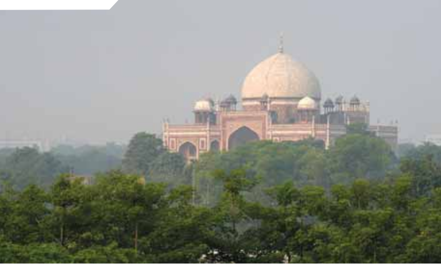
A view of Humayun's Tomb, a UNESCO world heritage site, in New Delhi