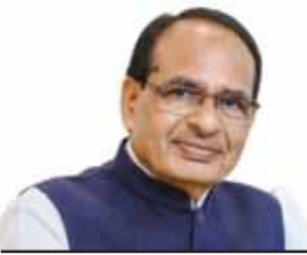
SHIVRAJ SINGH CHOUHAN

Through modern infrastructure, expanded credit support, and sustainable farming methods, PM Modi's policies are revolutionising Indian agriculture