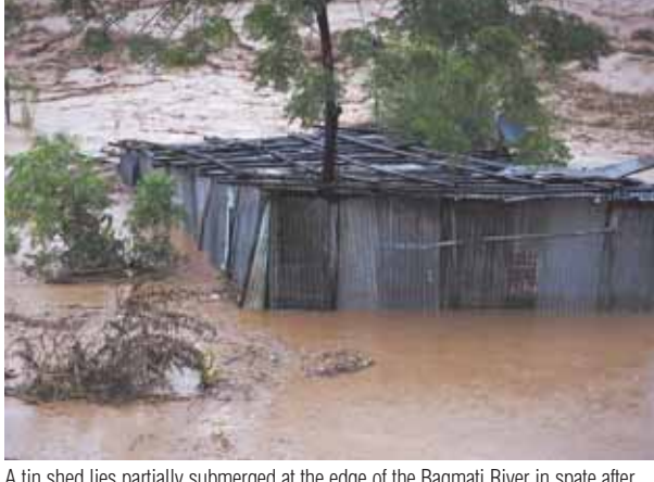
A tin shed lies partially submerged at the edge of the Bagmati River in spate after

Sunak pleads for party unity in final address as Tory leader