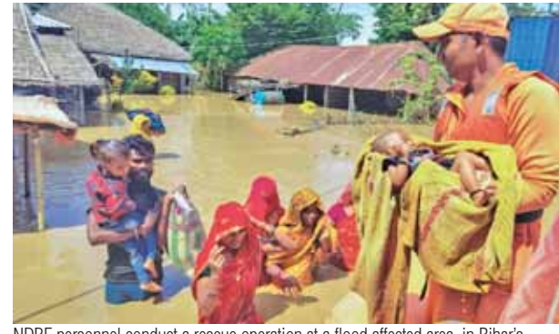
NDRF personnel conduct a rescue operation at a flood affected area, in Bihar's Supaul district

Kosi river was in spate and breached its embanl Kartarpur block, inundating Kirtarpur and Ghanshyampur villages in Darbhanga late on Sunday, while seepage was reported in the embankment of Bagmati river in Runni Saidpur block in Sitamarhi district, they said. "The flood situation has worsened with fresh embankment breaches but it is under control. There is nothing to panic," an official