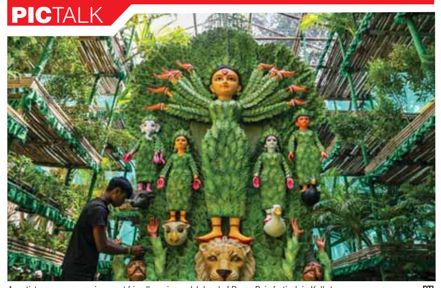
n artist prepares an environment friendly puja pandal ahead of Durga Puja festival, in Kolkata

region through a network of militias known as the 'Axis of Resistance,' which includes Hezbollah, the Houthis in Yemen, and various groups in Syria and Iraq. While Tehran will likely use these proxies to increase pressure on Israel, its response is expected to be measured to avoid triggering a full-scale war. Israel's intentions are now clearer than ever. The assassination of Nasrallah signals that Israel has no interest in halting its military campaign, despite international calls for a 21-day ceasefire, including one from its closest ally, the United States. Israel believes it has Hezbollah on the defensive and aims to continue its offensive until the group's missile threat is neutralised. A broader war would have catastrophic consequences, not only for the parties directly involved but for the entire region. Lebanon, already on the brink of economic collapse, could be devastated and any escalation could disrupt global oil supplies, sending shockwaves through the international economy. The coming weeks will be crucial in determining whether this conflict spirals into a wider regional war or if diplomatic efforts can halt the violence before it escalates further. As of now, this volatile region stands on the edge of a conflict with no clear resolution in sight. This is high time for the UN to step in and the West to make efforts for rapproachment else this region is going to burn for sure.