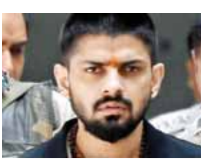
PIONEER NEWS SERVICE ■ CHANDIGARH