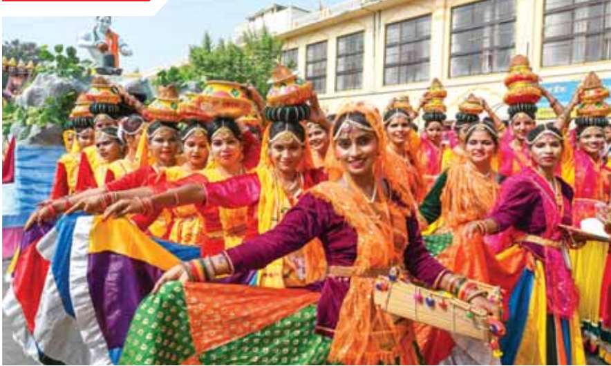
Artists dance on the Rampath ahead of Deepotsav celebrations, in Ayodhya