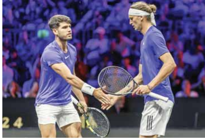
season-ending ATP Finals for the top eight players. It is being held in Turin, Italy, next month. Seventh-seeded Casper Ruud of Norway, a three-time Grand Slam runner-up, started well before losing 7-6 (3), 3-6, 6-4 to unseeded Australian Jordan Thompson. In an earlier second-round match, sixth-seeded Andrey Rublev lost two tiebreakers and his temper as his hopes of qualifying for the Finals took a hit. Rublev lost 7-6 (6), 7-6 (5) to Francisco Cerundolo and was so frustrated at one point in the second set that he smashed his racket against his left knee at least seven times in succession and made it bleed. The Russian player held the eighth and final qualifying place in the race for the Finals and could be overtaken by rivals. U.S. Open runner-up Taylor Fritz became the fifth player to qualify

Serving for the match, Alcaraz saved another break point with an ace to make it deuce and won the next two points, clinching victory when the erratic Jarry's two-handed backhand clipped the net and went out. "He's a really dangerous player on these courts," the 21-year-old Alcaraz said. "I'm super happy to win here." The four-time Grand Slam champion is looking for his fifth title of the year and next plays either 15th-seeded Ugo Humbert or American qualifier Marcos Giron. "It's been a great year so far," said Alcaraz, who won major titles at the French Open and Wimbledon. Tenth-seeded Stefanos Tsitsipas of Greece beat Alejandro Tabilo 6-3, 6-4 to stay in contention to reach the