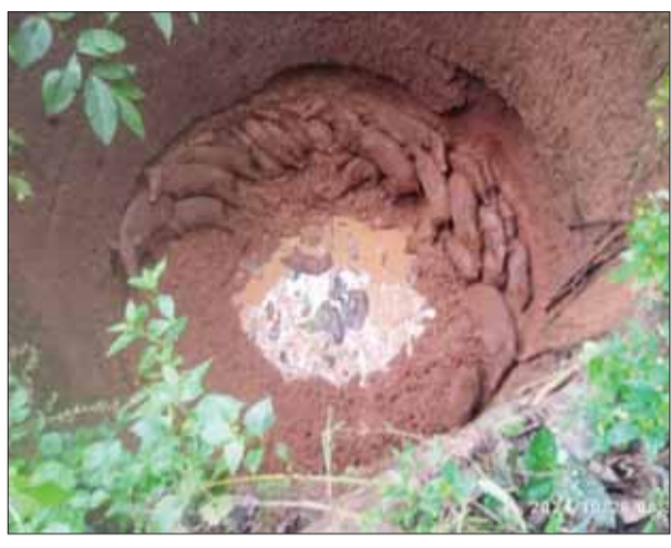
spot. The soil was dug by a machine and a passage was created to rescue the boars. Locals said that there are a

Officials of Keonjhar forest division rescued a herd of wild boars from an abandoned well in Handibhanga village under Sadar forest range area on Monday. Later, the wild boars were released into the forest safely.