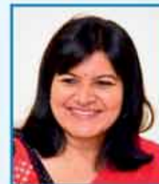
Smt. Aparajita Sarangi Hon'ble MP, Lok Sabha Bhubaneswar