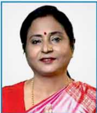
Smt. Surama Padhy Hon'ble Speaker of Odisha Legislative Assembly