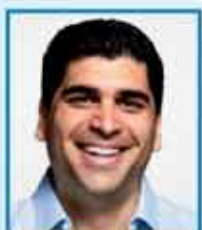
Mr. Otto Ramón Sonnenholzner Sper Former Vice President of Ecuador