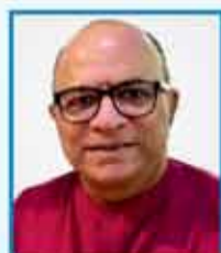
Padma Shri Dr. Chandraprakash Dwivedi Indian Actor & Film Director