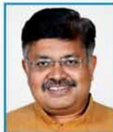
Shri Prithviraj Harichandan Hon'ble Minister of Law, Works, and Excise, Govt. of Odisha