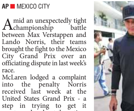
that Verstappen should have been penalized for his defensive driving. "He did what he thought was right, and I did what I thought was right. I still disagree, and as a team, we disagree," Norris said. "It is something I am sure we will discuss as it has been a big talking point since last weekend. A lot of other drivers didn't agree with it, teams didn't agree with it." The same stewards who levied the penalty at the USGP heard the appeal via video conference late Friday afternoon. Verstappen argued in Mexico that F1 has become over-

policed - he was ordered to serve community service for swearing in a news conference in Singapore last month - and joked he needs to keep a copy of the rulebook inside his car to keep up with all the regulations. "I think we are getting to a stage where I always need the book in the car. If you look of course over the years, the book has grown quite a lot," Verstappen said. "It is definitely over-regulated." But seven-time champion Lewis Hamilton seemed to side with Norris, claiming Verstappen has routinely received favorable treatment from the stewards. "I mean, it's always been a gray area. That's why he's got away with it for so long," Hamilton said. "They probably need to make some adjustments for sure. We do have inconsistencies weekend in, weekend out, obviously, depending on which stewards are there. "And as a sport, we do need to level up on all areas," he continued. "We look at, like, other global sports, they have full-time refs for example, and I'm sure that wouldn't be a bad thing for our sport."