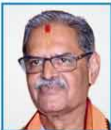
Shri Kanak Vardhan Singh Deo Hon'ble Deputy Chief Minister of Odisha