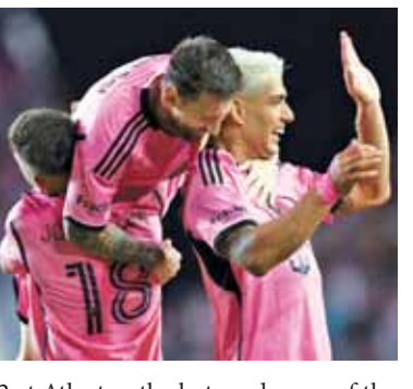
2 at Atlanta - the last road game of the season, no matter what, for Inter Miami. Game 3, if necessary, will be November 9 in Fort Lauderdale. "It's going to be difficult for us," Inter Miami coach Gerardo "Tata" Martino said. "It's going to be difficult as this rival has been throughout the season." Inter Miami's first-ever home playoff