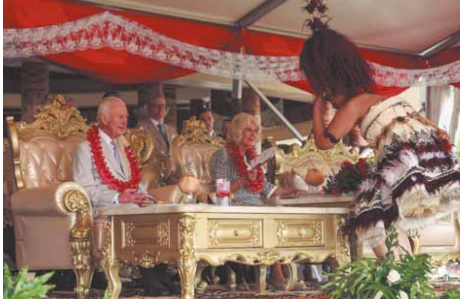
Britain's King Charles III and Queen Camilla attend the bestowing and farewell ceremony on the final day of the royal visit to Samoa at the Siumu Village in Apia, Samoa, on Saturday.

sea-level rise, protecting 30 per cent of oceans and restoring degraded marine ecosystems by 2030, and urgently finalising the Global Plastics Treaty. It also calls for ratifying the high-seas biodiversity treaty, developing coastal climate adaptation plans, and strengthening support for sustainable blue economies.