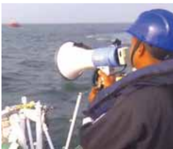
An Indian Coast Guard official during preparations ahead of the landfall of Cyclone Dana

As cyclone 'Dana' barrels toward the Odisha coast, threatening to impact nearly half the state's population, the government is racing against time to execute a massive evacuation plan aimed at relocating around 10 lakh people in 14 districts to safety. The Indian Meteorological Department (IMD) on Wednesday said the cyclone is likely to make landfall between Bhitarkanika National Park and Dhamra port, around 70 km away, early Friday. It said the landfall process will start from the night of October 24 and will continue till the morning of October 25. The maximum speed during the landfall process is likely to be around 120 kmph, IMD DG Mrutyunjay Mohapatra said. He said landfall is mostly a slow process which usually takes around 5-6 hours. "Therefore, heavy rainfall, wind and storm surge will reach the peak during the landfall time which is between October 24 night and October 25 morning," he added. According to the latest IMD bulletin, the cyclone moved northwestwards with a speed of 13 kmph and lay centred about 490 km southeast of Paradip (Odisha), 520 km south-southeast of Dhamra (Odisha) and 570 km southeast of Sagar Island (West Bengal). During the landfall, a tidal surge of up to two metres is expected, with the