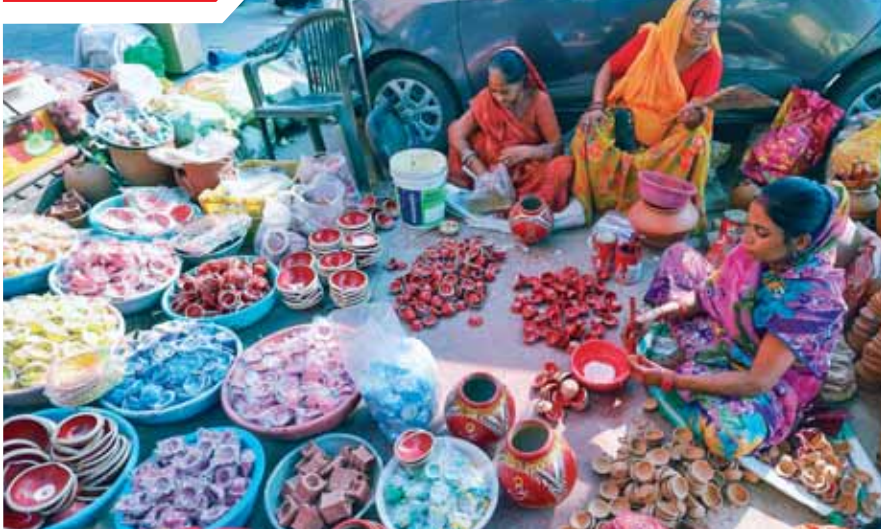
Women colour earthen lamps at a roadside shop ahead of the Diwali festival, in Jaipur