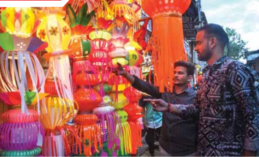
People buy lanterns ahead of the Diwali festival, in Solapur