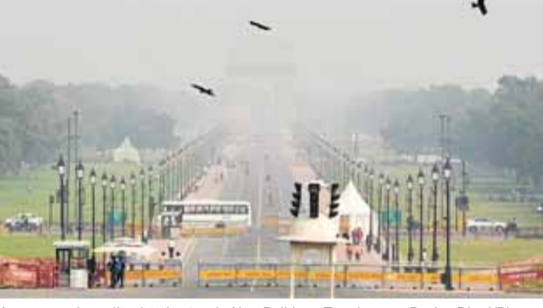
A smog as air quality deteriorates, in New Delhi, on Tuesday

Even before the arrival of winter, Delhi along with several cities of north India is gasping for clean air as air quality has degraded to alarming levels over the past few days. Based on the real time data, Delhi ranks top on the list of most polluted cities in the country. It was the second-most polluted city in the world on Tuesday, a live ranking on IQAir's a Swiss based air quality monitoring website indicated, after only Lahore in neighbouring Pakistan. AQI in Lahore recorded 394. A layer of smog engulfed Delhi and surrounding areas, including Noida, on Tuesday morning, even as the air quality plummeted to the 'very poor' category at 327, followed by Haryana's Jind where the AQI stood at 311. Meanwhile, out of 36 monitoring stations in the National Capital, 26 are in the red zone, with the AQI recorded in the "very poor" category, according to data from the Central Pollution Control Board. These stations