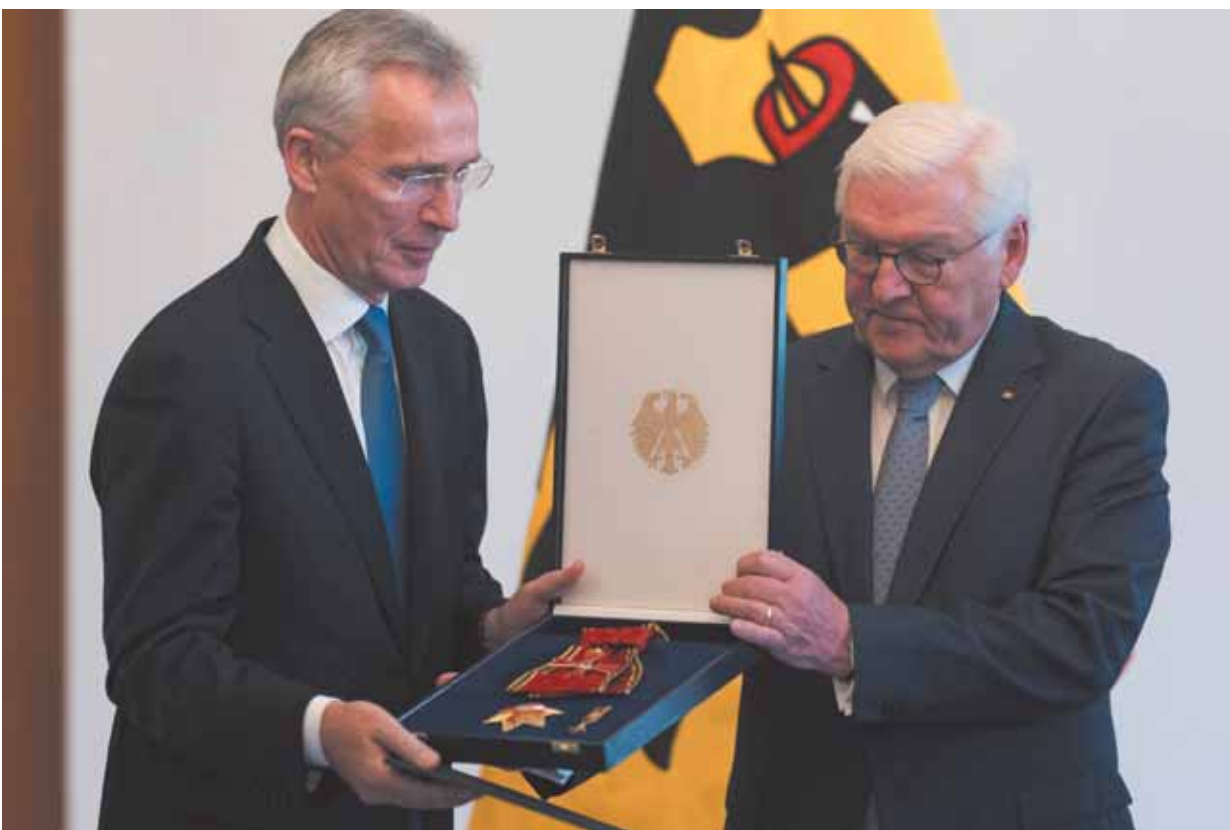
Former NATO Secretary General Jens Stoltenberg (left) receives the Grand Cross of the Order of Merit of the Federal Republic of Germany from German President Frank-Walter Steinmeier at Bellevue Palace, Berlin on Tuesday.

ism that made America and the world worse off and pursued global economic leadership that supports economies around the world and brings significant benefits to the American people and the US economy."