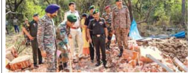
Officials at the blast site of Ordnance Factory Jabalpur (OFJ), in Jabalpur district, Madhya Pradesh, Tuesday

Jagdambika Pal of the Bharatiya Janata Party (BJP), during a heated exchange of words with BJP's Abhijit Gangopadhyay, a former Calcutta High Court judge. This is the second time Banerjee has made news for odd reasons, the last time he had mimicked a presiding officer of the Parliament. The act was condemned by the President of India, Prime Minister and his Cabinet colleagues. According to sources, the panel voted nine-eight on a resolution moved by BJP MP Nishikant Dubey to suspend Banerjee for a day for his choice of words for the panel chairman, and for smashing a glass bottle and throwing it towards Pal. After the meeting concluded, Banerjee refused to talk to reporters about the incident. After being administered first aid, Banerjee was seen being escorted back to the meeting room by AIMIM chief Asaduddin Owaisi and AAP leader Sanjay Singh.