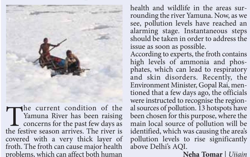
The current condition of the Yamuna River has been raising concerns for the past few days as the festive season arrives. The river is covered with a very thick layer of froth. The froth can cause major health problems, which can affect both human health and wildlife in the areas surrounding the river Yamuna. Now, as we see, pollution levels have reached an alarming stage...