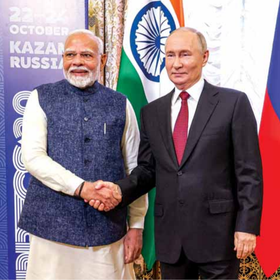
Prime Minister Narendra Modi during a bilateral meeting with Russian President Vladimir Putin, in Kazan, Tuesday

■ KAZAN The Russia-Ukraine conflict should be resolved in a peaceful manner and India is ready to provide all possible cooperation towards it, Prime Minister Narendra Modi said on Tuesday during his talks with Russian President Vladimir Putin. Modi held bilateral talks with Putin hours after arriving in this central Russian city to attend the 16th BRICS summit. In his televised opening remarks, the Prime Minister conveyed to the Russian leader that New Delhi "fully supports" the early return of peace and stability in the region. Modi also said that his second visit to Russia in the last three months reflected "close