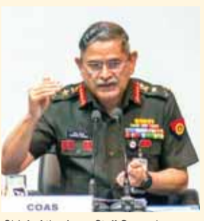
Chief of the Army Staff General Upendra Dwivedi during a press conference, in New Delhi

humanity. India is ready to provide all possible cooperation in times to come," he said. "We have the opportunity to discuss all these issues," he added. On his part, Putin noted the "good condition" of trade turnover between Russia and India. In his remarks, Modi also referred to his summit talks with the Russian leader in Moscow in July. Our annual summit resulted in strengthening cooperation in every field, he said. The Prime Minister also congratulated Putin on Russia's successful presidency of BRICS. Many countries want to join the grouping now, he added. "It is a matter of great pleasure for me to have the opportunity to visit a beautiful city like Kazan for the BRICS summit. India has deep and historical ties with this city," Modi said. "The opening of India's new consulate in Kazan will further strengthen these ties," he added. It is learnt that the Ukraine conflict figured prominently at the meeting. In the summit talks on July 9 in Moscow, Modi told Putin that a solution to the Ukraine conflict is not possible on the battlefield and peace efforts do not succeed in the midst of bombs and bullets. Weeks later he travelled to Ukraine. In his talks with Zelenskyy, Modi said both Ukraine and Russia should sit together without wasting time to end the ongoing war and that India was ready to play an "active role" to restore peace in the region. India has been maintaining that the conflict in Ukraine must be resolved through dialogue and diplomacy.