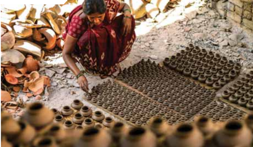
A potter arranges freshly-made 'diyas' (earthen lamps) ahead of the Diwali festival, in Hyderabad