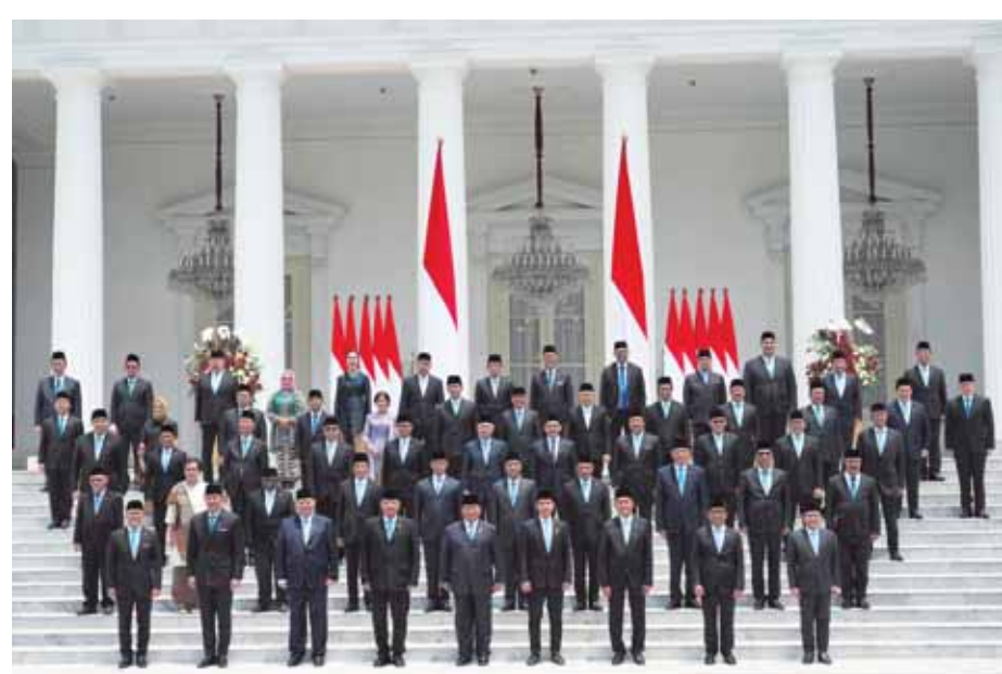
Indonesian President Prabowo Subianto, front centre, and Vice President Gibran Rakabuming Raka, front row fourth from right, pose for a group photo with newly-appointed cabinet ministers after their swearing-in ceremony at Merdeka Palace in Jakarta, Indonesia, on Monday.

Newly inaugurated President Prabowo Subianto swore in Indonesia's largest Cabinet since 1966 on Monday, with 109 members representing his pledge for a strong government. He announced the lineup late Sunday and named his Cabinet of ministers, vice ministers and head of national agencies the "Red and White Cabinet," referring to the colours of Indonesia's flag. Subianto became the eighth president of Southeast Asia's largest economy on Sunday. The Cabinet of Subianto's predecessor, Joko Widodo, had 34 ministers and head of government agencies. Subianto's Cabinet is the largest since 1966 when Indonesia's first President Sukarno formed a lineup of 132 ministers in an extremely tense political situation after a failed 1965 coup.