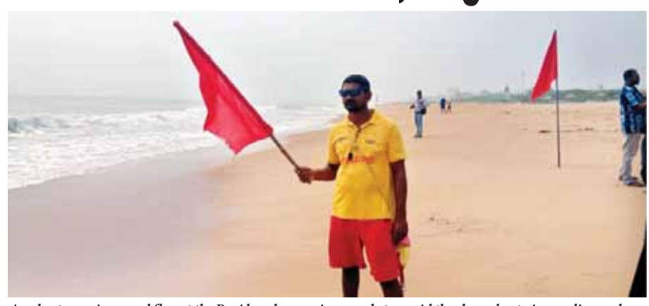
A volunteer raises a red flag at the Puri beach, warning people to avoid the shore due to impending cyclone

Cyclone Dana, a severe cyclonic storm, is on course to make landfall along the Odisha coast between Puri and the Sagar Islands late on October 24 or early following morning, according to the India Meteorological Department (IMD).