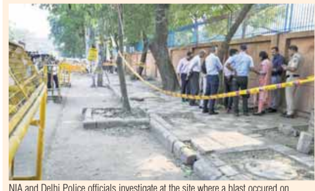
NIA and Delhi Police officials investigate at the site where a blast occurred on Sunday, near a CRPF school at Prashant Vihar, in Rohini area of New Delhi

year in Galwan. Twenty Indian army personnel including the commanding officer died in the clash while more than 40 Chinese troops were also killed. Both the sides then amassed troops and weaponry on their respective sides of the LAC. In fact, India, not willing to take any chances, also deployed its troops even during the winter months at the LAC. Earlier, the troops used to withdraw to their bases during the winters. At one point of time, more than 50,000 troops from each side were facing each other on friction points at the LAC. Given the situation, India and China, since 2020, held several rounds of talks at the military and diplomatic levels. While Corps Commanders of the two sides held military level talks, the diplomatic level talks were held under the aegis of Working Mechanism for Consultation and Coordination (WMCC) on India-China Border Affairs.