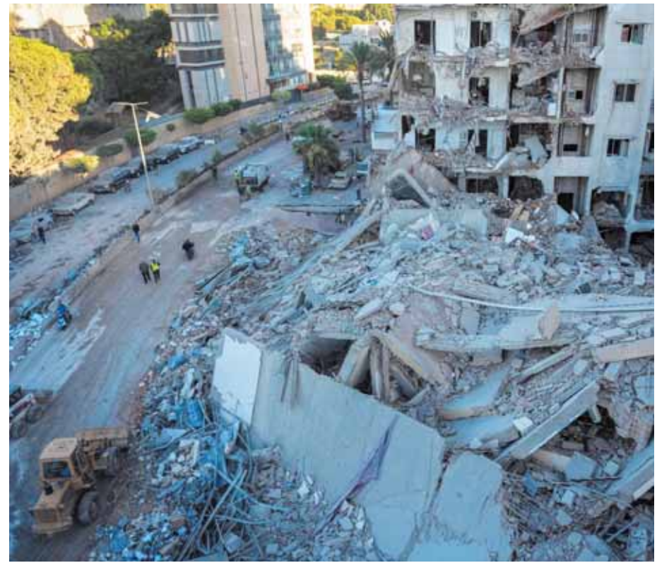
Rescue workers use a bulldozer to remove rubble of destroyed buildings at the site of an Israeli airstrike on Sunday night that hit several branches of the Hezbollah-run Qard al-Hassan Association in Beirut's southern suburb, Lebanon, on Monday.

urged Israel to scale back some strikes, especially in and around Beirut. In a separate development, the Israeli military apologised for a strike on Sunday in southern Lebanon that killed three Lebanese army soldiers. It said it targeted a vehicle in an area that Hezbollah had recently used for attacks without realising it belonged to the Lebanese military. The military said it is "not operating against the Lebanese Army and apologises for these unwanted circumstances". Lebanon's army is a respected institution within the country, but it is not powerful enough to impose its will on Hezbollah or defend Lebanon from Israel's invasion. The army has largely kept to the sidelines as Israel and Hezbollah have traded blows over the past year.