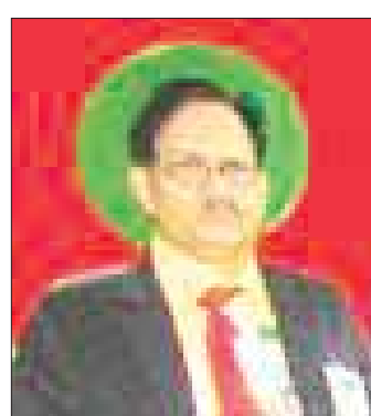
B RAMCHANDRA CST VOLTAIRE

This is not enough. We are to remove all blind beliefs such as idol worship, caste system, Brahminical pressure on death rituals, on marriage ceremonies