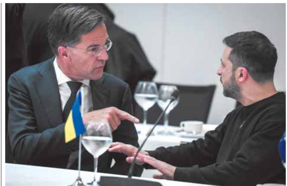
NATO Secretary General Mark Rutte (left) speaks with Ukraine's President Volodymyr Zelenskyy during the NATO-Ukraine Council working dinner at NATO Headquarters in Brussels on Thursday.