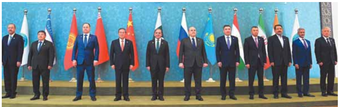
Pakistan's Prime Minister Shehbaz Sharif (centre), China's Premier Li Qiang, Belarus Prime Minister Roman Golovchenko, Russian Prime Minister Mikhail Mishustin, Kazakhstan's Prime Minister Olzhas Bektenov, Tajikistan's Prime Minister Kokhir Rasulzoda, and other leaders pose for group photo at the opening session of Shanghai Cooperation Organization (SCO) meeting in Islamabad, on Wednesday.

Pakistan Prime Minister Shehbaz Sharif on Wednesday rooted for Beijing's Belt and Road Initiative at the SCO summit here, saying such connectivity projects should not be viewed through a "narrow political prism" — an apparent reference to India's reluctance to endorse it. In his opening remarks at the Shanghai Cooperation Organisation summit, he said efforts like China's Belt and Road Initiative and the China-Pakistan Economic Corridor, which is a part of the larger project, should be expanded. India has shown little enthusiasm for the China's "unilateral" initiative. And it has repeatedly criticised the China-Pakistan corridor for violating its territorial integrity as it involves building infrastructure in Pakistan-occupied Kashmir. Indirectly challenging India's position, Sharif said, "Let us not look at such projects through the narrow political prism, and invest in our collective connectivity capacities which are crucial to advancing the shared vision of an economically integrated region." In his speech later, External Affairs Minister S Jaishankar said trade and connectivity initiatives must recognise territorial integrity and sovereignty and it is essential to have an "honest conversation" on lack of trust, a remark seen as an indirect reference to China. The SCO comprises China, India, Russia, Pakistan, Iran, Kazakhstan, Kyrgyzstan, Tajikistan, Uzbekistan and Belarus. Sixteen more countries are affiliated as observers or "dialogue partners".