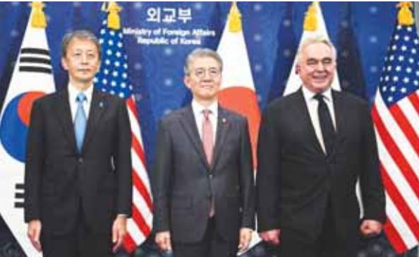
South Korea's First Vice Foreign Minister Kim Hong-kyun, center, poses for photos with United States Deputy Secretary of State Kurt Campbell (right) and Japan's Vice Foreign Minister Masataka Okano during their trilateral meeting at the Foreign Ministry in Seoul on Wednesday.