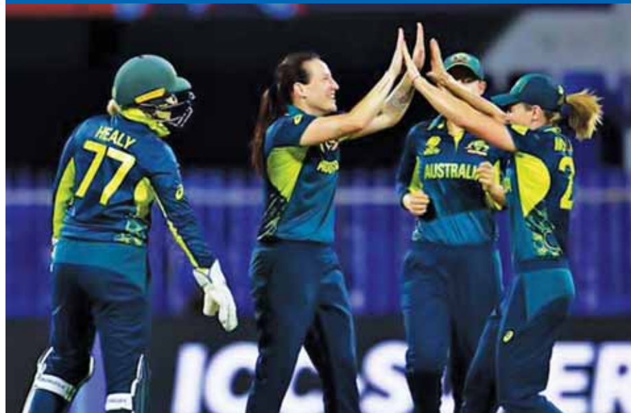
Women's T20 World Cup is even more intimidating as Australia have won all the