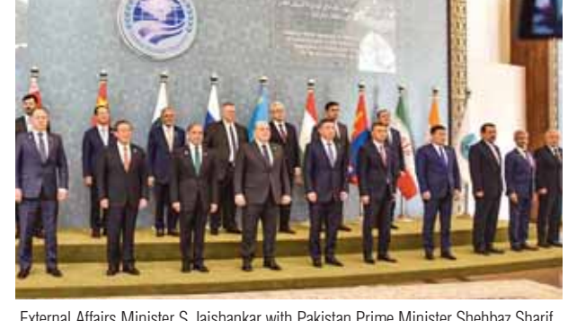
External Affairs Minister S Jaishankar with Pakistan Prime Minister Shehbaz Sharif and other leaders during the 23rd meeting of the SCO Council of Heads of Government, in Islamabad, Pakistan, Wednesday