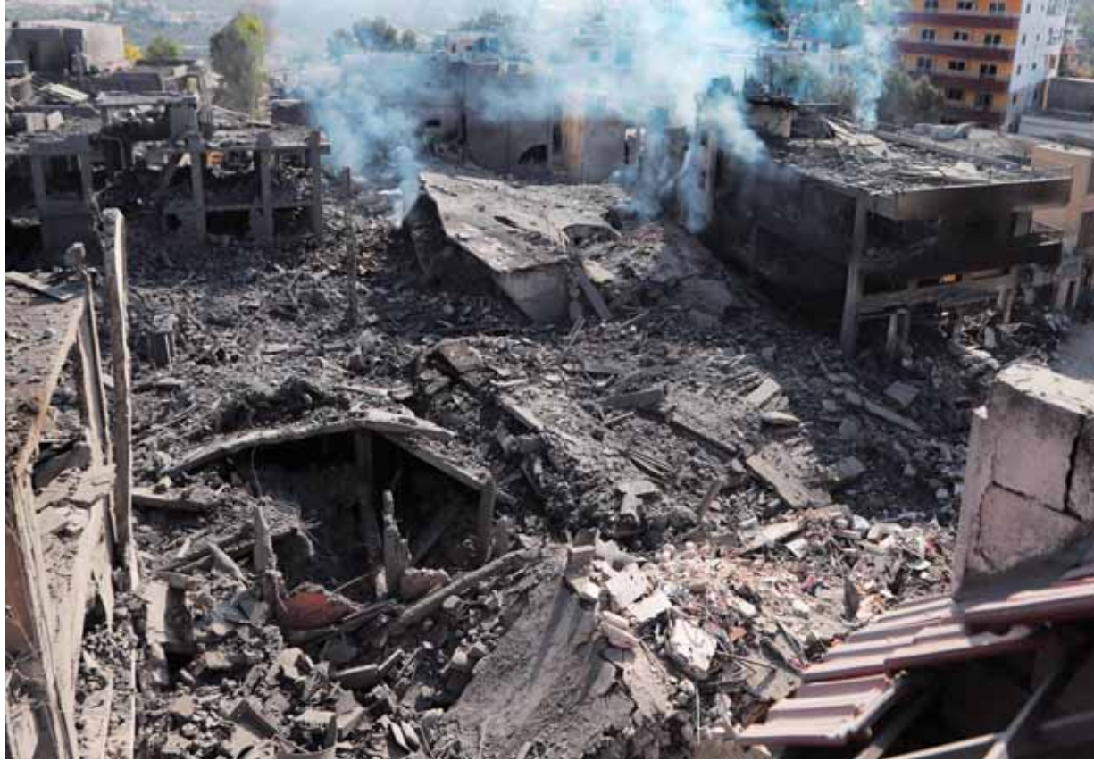
Smoke rise from destroyed buildings that were hit by Israeli airstrikes in Qana village, south Lebanon on Wednesday.

Israeli jets struck the southern suburbs of Beirut early Wednesday for the first time in six days, Lebanese state media reported. The casualty count was not yet clear. The attack comes just one day after caretaker Prime Minister Najib Mikati said the United States government gave him some assurances of Israel easing its strikes in the Lebanese capital. Israel says it is striking Hezbollah assets in the suburbs, where the militant group has a strong presence, but it is also a busy residential and commercial area. The Israeli military said the Wednesday strike hit a weapons warehouse under a residential building. The Israeli military posted an evacuation warning on the X platform saying it is targeting a building in the Haret Hreik neighborhood. An Associated Press photographer who witnessed the strikes said there were three in the area. The first strike was documented less than an hour after the notice.