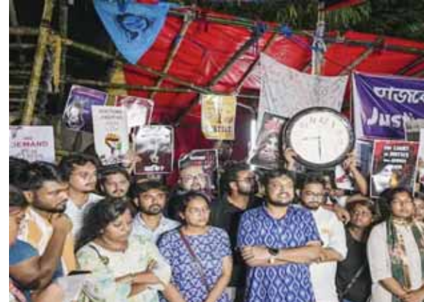
be abridged, the Court has iterated ... this order breaks and dissolves all the arrogance of this Government ... and if still they are not taking any lesson out of this and continue to act in an undemocratic manner then this means they are on their way out," said senior advocate and Rajya Sabha MP Bikash Ranjan Bhattacharya. "The police had imposed Section 163 in anticipation of some mischief in the Durga Puja Carnival which is an yearly event attended among others by foreign dig-