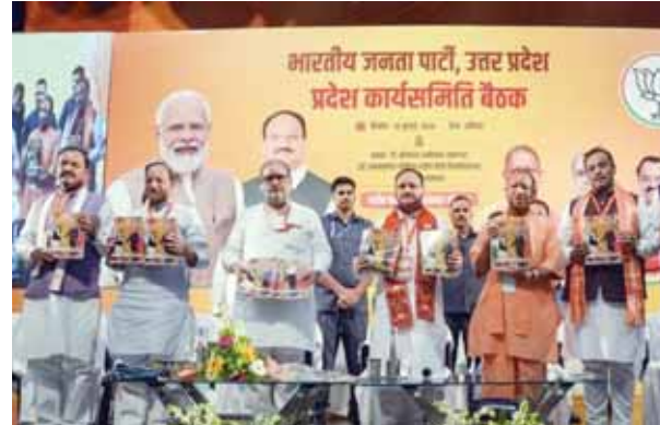
2024 Lok Sabha elections from Mirzapur. The Bahujan Samaj Party (BSP) has also announced its candidates for most of the constituencies, adding another dimension to the contest. With multiple parties vying for influence over key regions, the by-elections are emerging as a critical test of the evolving political dynamics in Uttar Pradesh. Key Constituencies in Focus Karhal (Mainpuri): The Karhal seat, situated in Mainpuri district, became