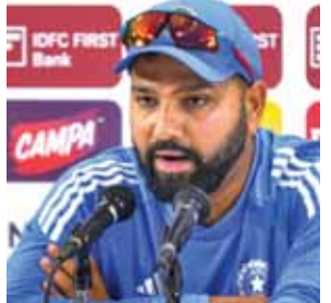
Rohit Sharma speaking at a press conference.

final last year and has been recuperating from an ankle surgery after that. "To be honest, right now, it's pretty difficult for us to make a call on him, whether he'll be fit for this series or Australia series.