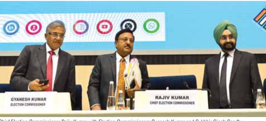
Chief Election Commissioner Rajiv Kumar with Election Commissioners Gyanesh Kumar and Sukhbir Singh Sandhu