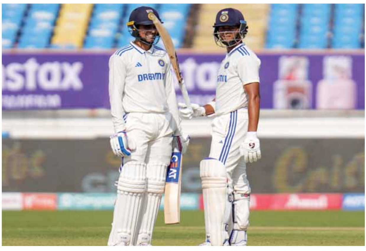
runs in eight Tests at just over 35. Kohli, 53 runs shy of 9000 Test runs, has not made even a fifty in six innings this year, and while Rohit often perishes in his attempt to grab the momentum, his colleague offers a much more curious case.

deliveries from pacers, but a trace of the old failing still remains. In Chennai, Bangladesh pacer Hasan Mahmud troubled him with nip-backers before eventually grabbing his wicket.