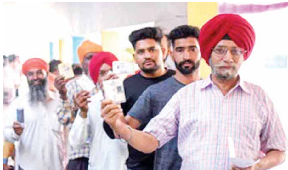
other at a polling booth. At a polling booth in Lohke Khurd village in Ferozepur's Zira, an unidentified person tried to throw ink on a ballot box. An