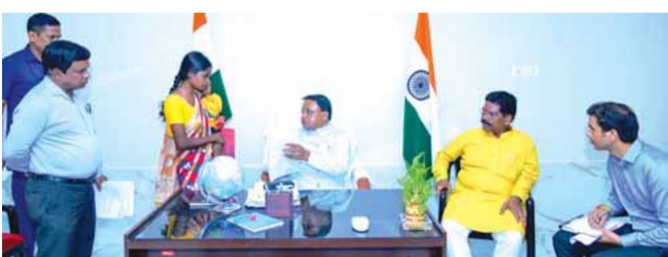
Chief Minister Mohan Charan Majhi meets people to be apprised of their grievances at the Circuit House in Keonjhar on Monday on the last day of a three-day visit to his home district.