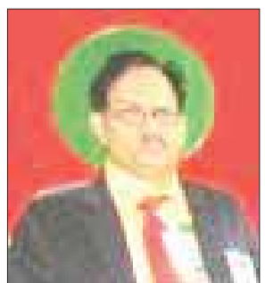
B RAMCHANDRA CST VOLTAIRE

In the 2024 Lok Sabha polls, the BJP got 45% of votes in the State of Odisha. The BJD got 37.5% of votes. Out of 21 seats of Odisha in the Lok Sabha,