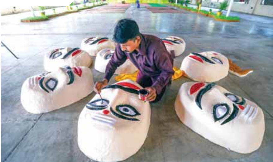
An artist paints effigies of the demon king Ravana on the Dussehra, in Prayagraj