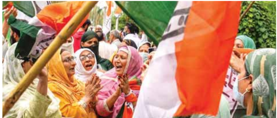
Supporters of Congress and National Conference (NC) celebrate as the Congress-NC alliance leads during the counting of votes of Jammu & Kashmir Assembly elections, in Srinagar, Tuesday