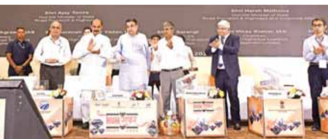
The Union Minister of Road Transport and Highways, Shri Nitin Gadkari launching the 'Humsafar Policy' 2024 at The Ashok Hotel, in New Delhi