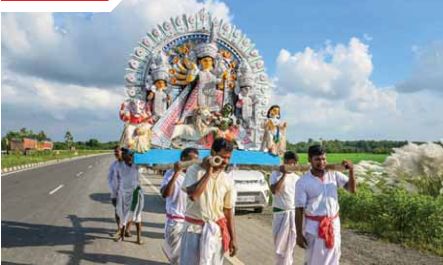
Devotees carry an idol of Goddess Durga to a puja venue, in Nadia