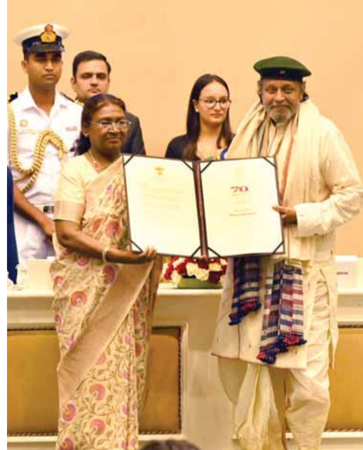
President Droupadi Murmu presents the Dadasaheb Phalke Award to veteran actor Mithun Chakraborty during the 70th National Film Award ceremony at Vigyan Bhawan, in New Delhi, Tuesday