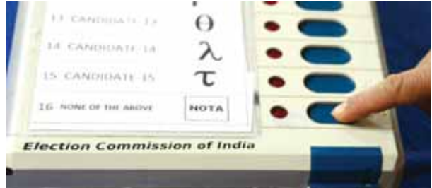
After the Supreme Court order in September 2013, the Election Commission (EC) added the NOTA button on the EVMs as the last option on the voting panel. Before the apex court order, those not inclined to vote for any candidate had the option of filling what is popularly called form 49-O. But filling out the form at the polling station under Rule 49-O of the Conduct of Elections Rules, 1961, compromised the secrecy of the voter. The Supreme Court had, however, refused to direct the EC to hold fresh polls if the majority of the electorate exercised the NOTA option while voting.

More voters in Jammu and Kashmir used the None of the above (NOTA) button against those in Haryana, latest Election Commission data shows. In elections to the 90-member Haryana assembly, out of over two crore electors, 67.90 per cent had exercised their franchise. Out of these, 0.38 per cent used the NOTA option on the voting machine. In the three-phased Jammu and Kashmir assembly polls to 90 seats, 63.88 per cent of the total electorate voted. Out of these, 1.48 per cent opted for the NOTA option. According to trends, not more than two per cent of the voters have opted for the NOTA option, indicating continued reluctance of electors in choosing the option. Introduced in 2013, the NOTA option on electronic voting machines has its own symbol — a ballot paper with a black cross across it.