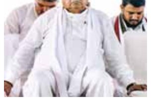
assembly elections held last month, it was a mixed bag for the Congress and the BJP - the saffron party headed for defeat in Jammu and Kashmir but bucked early morning trends to move ahead of the Congress in the nail biting Haryana contest. If the trends hold, the Congress may well have to settle for a loss in the heartland state and a 'second partner win' in the union territory. At 2PM, the ruling BJP had crossed the majority mark in the Haryana assembly and was leading or had won 47 seats, while the Congress was ahead or had won 38 seats, according to the trends available on the Election Commission website. Several exit polls had predicted a big Congress victory in Haryana. What started as buoyant result in Jammu and Kashmir also seemed headed for a disappointing turn in Jammu and Kashmir for the Congress as though its alliance with the National Conference seemed set for majority, the Mallikarjun Kharge-led party was leading or had won only six seats. The Congress also raised with the Election Commission the issue of an "unexplained slowdown" in updating of results of Haryana elections on the poll watchdog's website and urged it to direct officials to update accurate figures so that "false news and malicious narratives" can be countered immediately. In a letter to the Chief Election Commissioner and Election Commissioners, Congress general secretary Jairam Ramesh said that between 9 and 11 am there was an "unexplained slowdown" in updating of results on the EC's website.