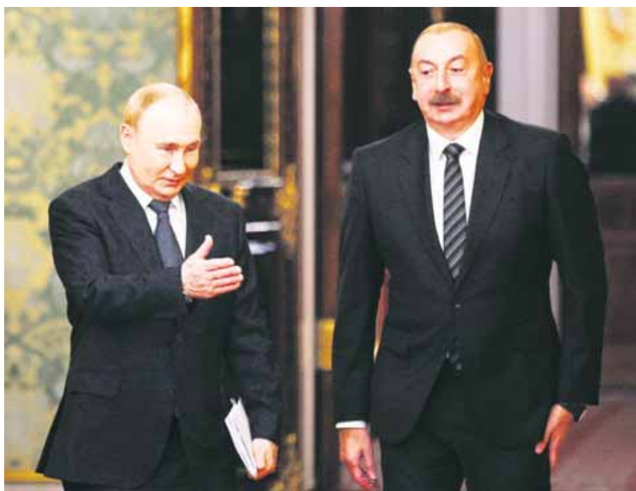
Russian President Vladimir Putin (left) and Azerbaijani President Ilham Aliyev enter the hall during a meeting of the heads of state of the Commonwealth of Independent States (CIS) at the Kremlin in Moscow, Russia, on Tuesday.

The Indian Embassy here handed over the first consignment of emergency relief materials, including sleeping bags, blankets and tarpaulin sheets, to authorities in flood-struck Nepal, according to an official statement.