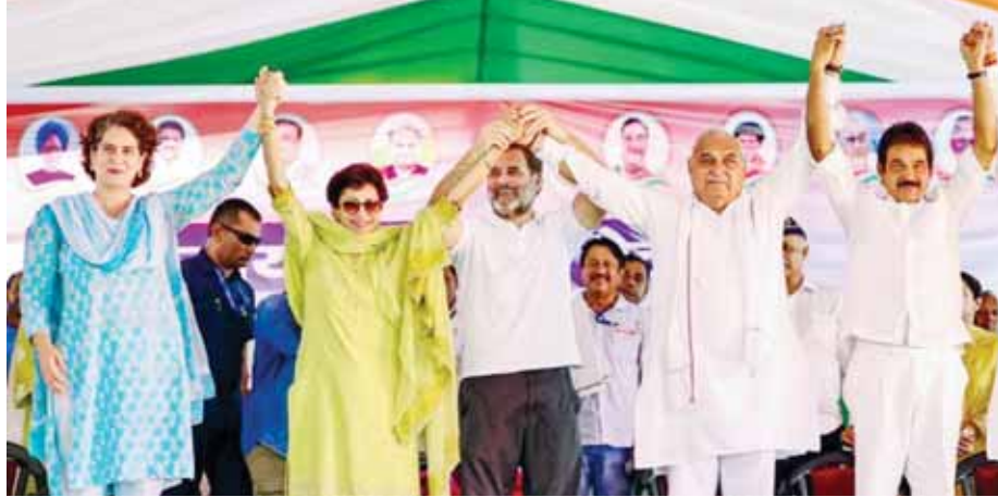
The state who have worked very hard and were looking forward to forming their government after 10 years. "It will not be business as usual in Haryana and I am sure the Congress high command would identify those who negated the efforts to

eral secretary Jairam Ramesh said the Haryana result is a victory of manipulations, and subverting the will of people. He also alleged that it is a defeat of the transparent and democratic processes. The knives were out in the Congress even before the declaration of final results, as party veteran Kumari Selja, who had been sulking during the election which was effectively led by former chief minister Bhupinder Singh Hooda, said that "it will not be business as usual" and called for introspection. "The Haryana poll results are disappointing and I am pained at the disappointment of the Congress workers in