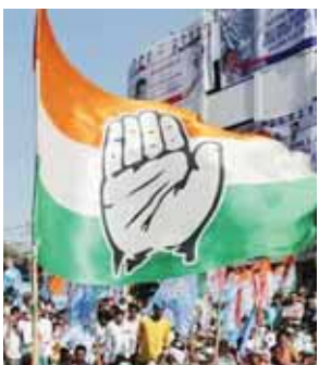
cant impact in UP. In the last state elections, Congress won just six seats, largely because it contested as an ally of SP. Without that partnership, Congress risks becoming a minor player in the state's political landscape. "The outcome in Haryana is pivotal because it reflects Congress's ability - or inability - to stand on its own. Failing to form Government, the Congress has now lost the bargaining power," feels political analyst. The upcoming by-elections in UP are not just a regional political contest; they hold national significance as a test for the opposition's INDIA alliance. Formed to counter the dominance of the Bharatiya Janata Party (BJP), the alliance includes Congress, SP, and other regional parties. But the internal dynamics of this coalition are already strained by seat-sharing disputes, and the by-elections will test whether the alliance can present a united front.

As political results unfold in Haryana, their ripple effects are likely to shape the future of political alliances in Uttar Pradesh (UP), particularly the dynamics between the Congress and the Samajwadi Party (SP). Political analysts say that the outcome could weaken Congress's bargaining position in its alliance with SP, with direct implications for the upcoming by-elections for 10 crucial seats in UP. These by-elections will serve as a litmus test for the effectiveness of the opposition's INDIA alliance, raising questions about Congress's role and influence in the state. A senior Samajwadi Party leader told this reporter that the Haryana election results clearly indicate Congress is rapidly losing its base. The leader urged Congress to reconsider its rigid stance on seat-sharing and accept the offer made by the SP. "The reality is that Congress lacks strong candidates to contest elections," the leader said, adding, "Even in Jammu and Kashmir, Congress can claim it won, but in truth, it secured only 6 out of the 49 seats won by the alliance. A similar situation unfolded in Uttar Pradesh as well." According to political analyst Rajesh N Bajpayee, the Congress has historically struggled to make a signifi-