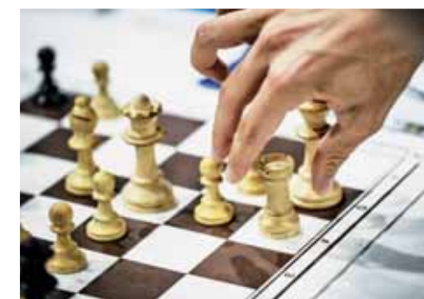
PTI ■ LONDON

Alpine SG Pipers with a 9-7 score to continue their unbeaten run at the Global Chess League here.