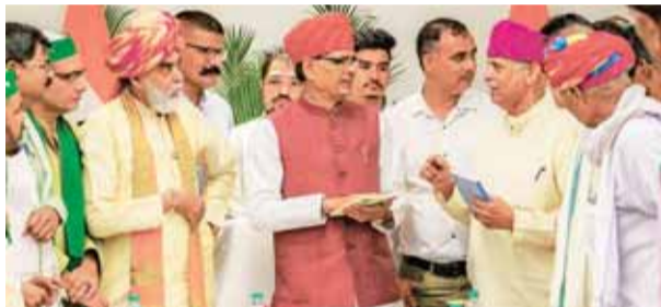
Union Minister for Agriculture and Farmers Welfare Shivraj Singh Chouhan during a meeting with farmers

Both the truck and the pilot car were seized along with the ganja. The driver of the truck and the two suspects admitted to transporting the ganja illegally to Odisha. "The ganja was seized under the provisions of the Narcotic Drugs and Psychotropic Substances (NDPS) Act, 1985. The accused were remanded to judicial custody for 12 days and further investigations are underway," the DRI said in a press release.