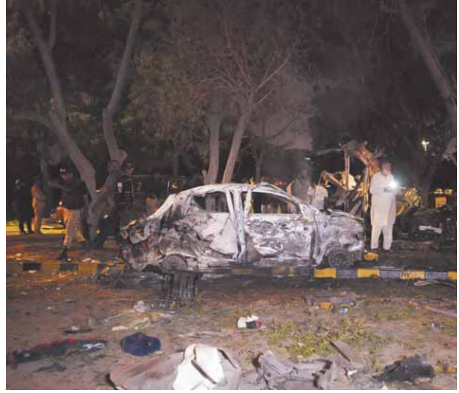
Security officials examine the site of an explosion that caused injuries and destroyed vehicles outside the Karachi airport, Pakistan, early Monday.

incident. Flight schedules at the airport are continuing as normal. Balochistan, bordering Iran and Afghanistan, is home to a long-running violent insurgency. Baloch insurgent groups have previously carried out several attacks targeting CPEC projects. The BLA accuses China and Islamabad of exploitation of the resource-rich province, a charge rejected by the authorities. It has fought a long-running insurgency for a separate homeland. The group in the last two years carried out similar suicide bomb attacks in Karachi targeting foreign nationals. The BLA in March this year claimed responsibility for an attack on a Pakistani naval air base near China-run Gwadar port. In April 2022, the group killed three Chinese tutors and a Pakistani driver in a suicide bombing near Karachi University's Confucius Institute. In November 2018, gunmen killed at least four people in an attack on the Chinese consulate in Karachi.