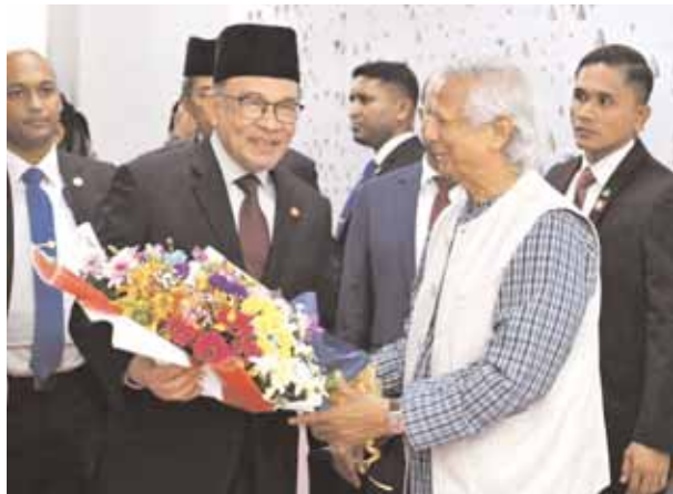
This photo provided by Bangladesh Press Information Department shows Malaysian Prime Minister Anwar Ibrahim, left, speaking with Bangladesh's interim leader Muhammad Yunus, in Dhaka, Bangladesh, Friday.