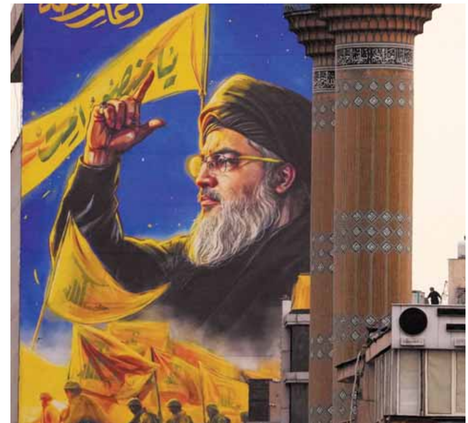
A billboard with a huge portrait of slain Hezbollah leader Hassan Nasrallah is installed on a building as minarets of a mosque are seen, in downtown Tehran, Iran, Monday. The billboard reads in Farsi on top left: "The beginning of Nasrallah."