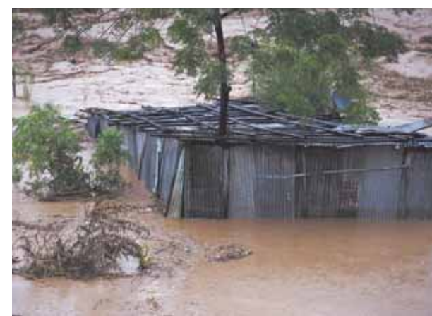
A tin shed lies partially submerged at the edge of the Bagmati River in spate after heavy rains in Kathmandu, Nepal, Saturday.

disaster, the report said. The Home Ministry said all security agencies have been deployed for relief efforts following the floods and landslides, and the Nepal Army, Nepal Police and Armed Police Force personnel have rescued around 4,500 disaster-affected individuals so far. While those injured are receiving free treatment, food and other emergency relief materials have been provided to others affected by the floods. Hundreds of people are facing a shortage of food, safe drinking water and sanitation in Kathmandu following the natural disaster, according to eyewitnesses. Market prices have also soared as vegetables coming from India and other districts of the country have been temporarily halted due to obstruction in major highways due to landslides. Numerous roads throughout the nation are severely damaged, and all routes leading to the capital city, Kathmandu, are still blocked, leaving thousands of travellers stranded, The Kathmandu Post newspaper reported. Home