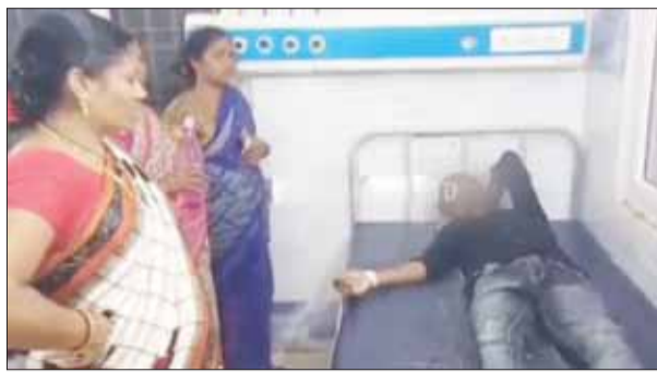
student reached the college and later lodged a complaint about the incident at the police station.

PNS ■ BHAWANIPATNA Fed up with repeated ragging and bullying, a Plus 2 second-year student allegedly jumped off from the hostel building of a private college under the Town police station here on Sunday.