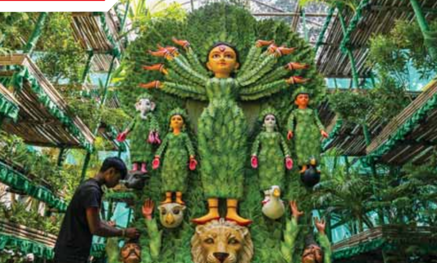
An artist prepares an environment friendly puja pandal ahead of Durga Puja festival, in Kolkata