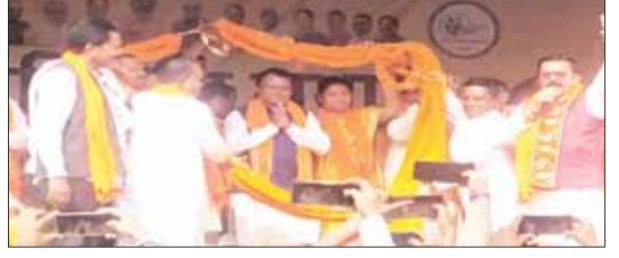
the lowest in the country at 4,400 rupees in the State. Majhi also slammed the Soren government for grossly neglecting Odia language in Jharkhand.

Odisha Chief Minister Mohan Charan Majhi is on a two-day visit to Jharkhand from Monday. Majhi attended the BJP's 'Parivartan' rally at Jagannathpur of West Singhbhum district on Monday and criticised the Hemanta Soren government of Jharkhand saying that the farmers' income has become