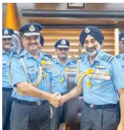
Academy, Defence Services Staff College and National Defence College, the air officer is a qualified flying instructor and an experimental test pilot with more

Air Chief Marshal A P Singh, an accomplished fighter pilot with more than 5,000 hours of flying experience, on Monday assumed charge as new chief of the Indian Air Force, succeeding incumbent Air Chief Marshal V R Chaudhari who superannuated. Air Chief Marshal Singh was serving as Vice Chief of the Air Force in his previous assignment. Born on October 27, 1964, Air Chief Marshal Singh was commissioned into the fighter pilot stream of the Indian Air Force in December 1984. In his long and distinguished service spanning nearly 40 years, he has served in a variety of command, staff, instructional and foreign appointments. An alumnus of the National Defence