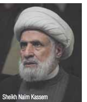
Sheikh Naim Kassem

Palestinian territories. The agency, known as UNRWA, is the largest aid provider in Gaza. Israel has long accused it of militant ties, allegations denied by the agency. A spokesperson for the UN children's agency said the decision "means that a new way has been found to kill children." Hezbollah's new leader has vowed to keep fighting Israel: Hezbollah said in a statement that its decision-making Shura Council elected Kassem, who had been Nasrallah's deputy leader for over three decades, as the new secretary-general. Kassem, 71, a founding member of the militant group established following Israel's 1982 invasion of Lebanon, had been serving as acting leader. He has given several televised speeches vowing that Hezbollah will fight on despite a string of set-