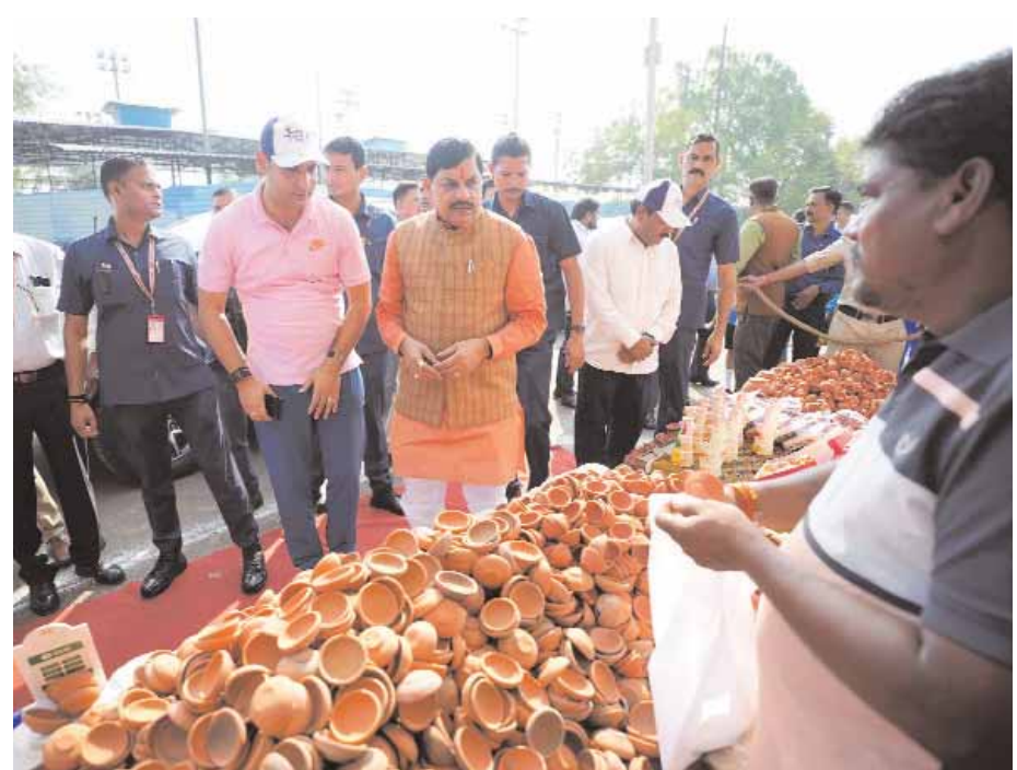
Madhya Pradesh Chief Minister Mohan Yadav buys earthen lamps on the occasion of Dhanteras and ahead of the Diwali festival in Bhopal on Tuesday.

improve medical services in the country and the state. He said that earlier there were 17 medical colleges in the state, today the state has received the gift of three new medical colleges from Prime Minister Modi. He said that pursuing medical education provides an opportunity to serve humanity. Doctors are seen as God in Sanatan culture. The CM said that doctors serve the suffering humanity and cure the poor and the sick of their diseases. That is why doctors are considered to be the most respected in Sanatan culture. Doctors are seen as God. The Chief Minister congratulated all the medical students and said that they should come out of here as good doctors and bring laurels to the country, state and the world.