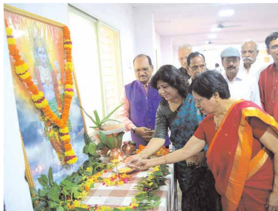
Ayurvedic doctors perform Dhanvantari puja on the occasion of Dhanteras festival at district Ayurved hospital in Bhopal on Tuesday.