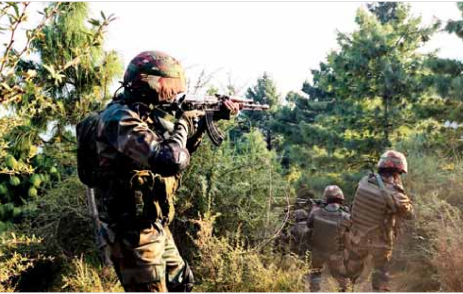
Indian Army's Ghatak team carrying out an extensive search operation in the dense forest of 'Dehra Ki Gali', in Rajouri district, Jammu and Kashmir

(SOG), bolstered by local intelligence and community assistance. Troops maintained comprehensive domination of the area, operating under challenging conditions during the night.