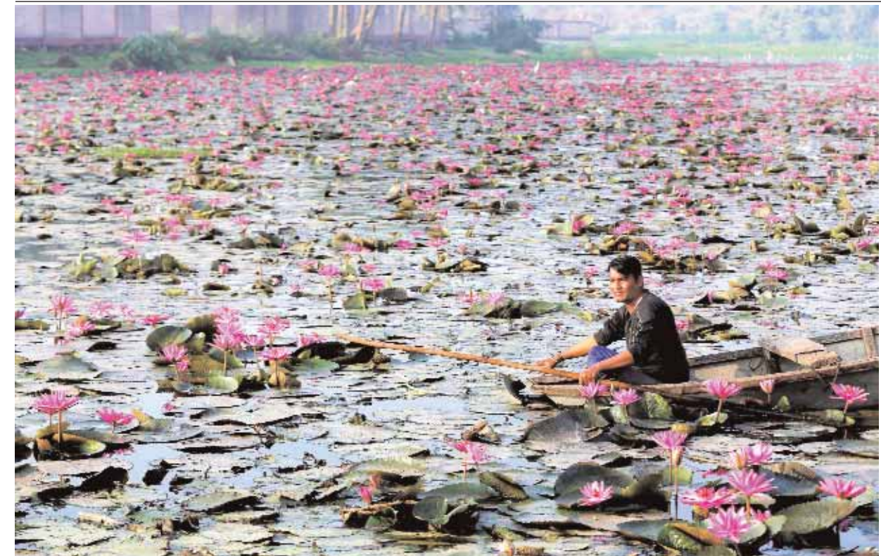
A man plucks blooming lotus flowers in a pond during the festive season in Bhopal on Tuesday.