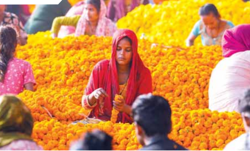
A Vendor sell flowers ahead of the Diwali festival, at the Ghazipur flower market in Delhi