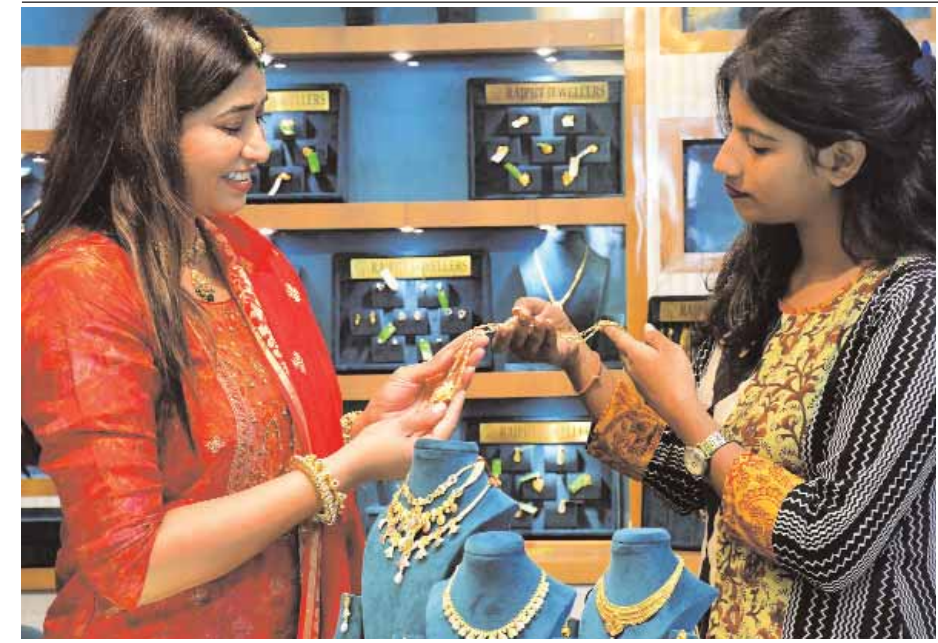
Women buy jewellery at a gold showroom on the occasion of Dhanteras festival in Bhopal on Tuesday.