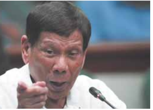
fault line in the increasingly hostile rivalry between Duterte and his children, including Vice President Sara Duterte, and President Ferdinand Marcos Jr. They had a bitter political fallout over key issues.

The cockiness, expletives and threats unleashed by former President Rodrigo Duterte in a Senate inquiry brought back the nightmare of the bloody "war on drugs" for many families of the thousands of victims who were gunned down under his rule.