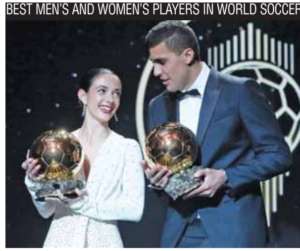
BEST MEN'S AND WOMEN'S PLAYERS IN WORLD SOCCER

four men's finalists with his Real Madrid teammates Jude Bellingham and Dani Carvajal. But no one from Madrid attended the gala in central Paris, even though Carlo Ancelotti won the coach of the year award.