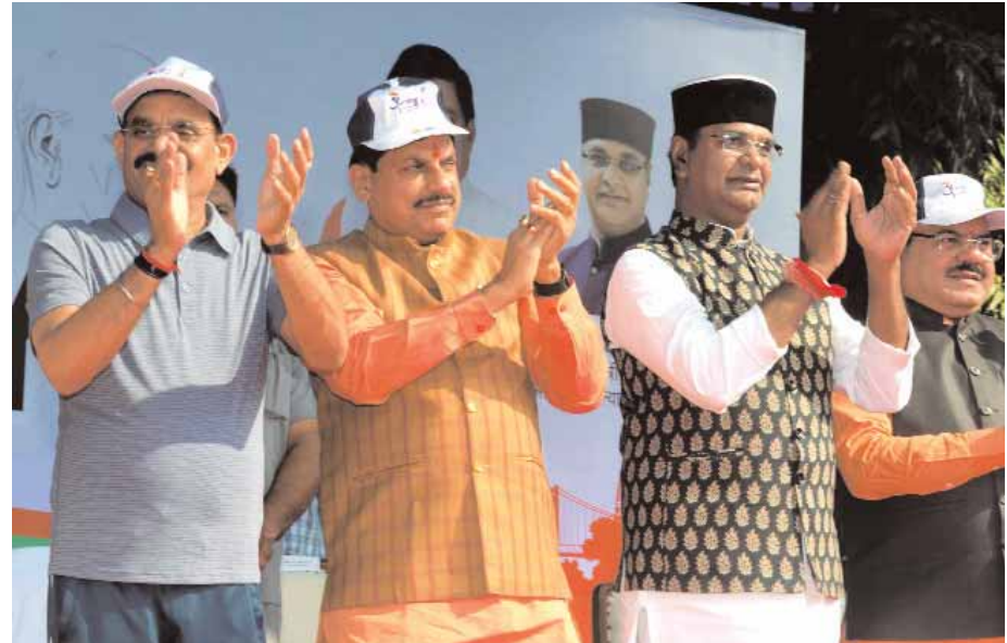
Madhya Pradesh Chief Minister Mohan Yadav after flagging off the 'Run for Unity' to celebrate the birth anniversary of Sardar Vallabh Bhai Patel in Bhopal on Tuesday.

Sports and Youth Welfare Minister Vishwas Sarang highlighted Sardar Vallabhbhai Patel's pivotal role in uniting the nation. Despite differing views among the princely states, Patel unified them, giving India its present form. The "Run for Unity" event offers a platform to reaffirm our commitment to the country's unity and integrity. MP V.D. Sharma noted that under Chief Minister Dr. Yadav's leadership, the state's cultural fabric is being enriched through events like Shastra Puja and Govardhan Puja alongside development and public welfare initiatives. Participants in the "Run for Unity" proceeded to TT Nagar Stadium, passing through Kamala Nehru School, New Market, and Roshanpura.