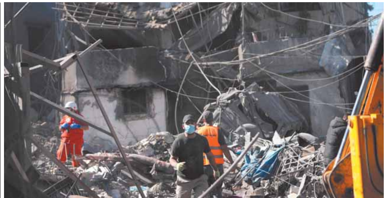
Rescue workers search for victims at the site of Israeli airstrikes that destroyed buildings facing the city's main government hospital in a densely-populated neighborhood, in southern Beirut, on Tuesday.

Last week, China held a one-day military exercise aimed at practicing the "sealing off of key ports and key areas". Taiwan counted a record one-day total of 153 aircraft, 14 navy vessels and 12 Chinese government ships. In response to Chinese moves, the US has continued what it calls "freedom of navigation" transits through the Taiwan Strait. On Sunday, the destroyer USS Higgins and the Canadian frigate HMCS Vancouver transited the narrow band of ocean that separates China and Taiwan. Germany sent two warships through the Taiwan Strait last month as it seeks to increase its defence engagement in the Asia-Pacific region. China has also exerted diplomatic pressure on Taiwan, poaching its allies. South Africa, which does not recognise Taiwan as a country, asked the island last week to move its liaison office outside the capital, Pretoria, as a concession to China. Taiwan on Monday said it would fight the request.