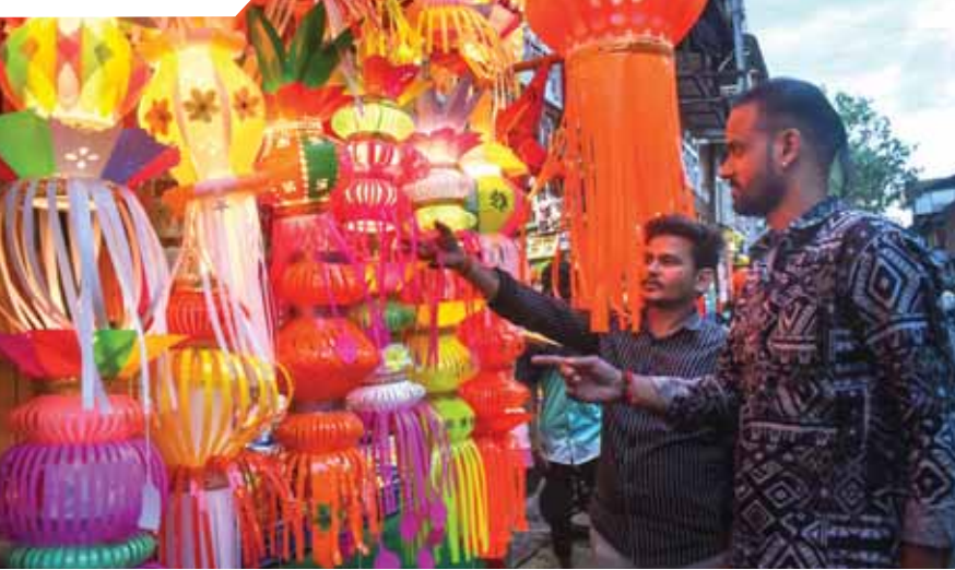
People buy lanterns ahead of the Diwali festival, in Solapur