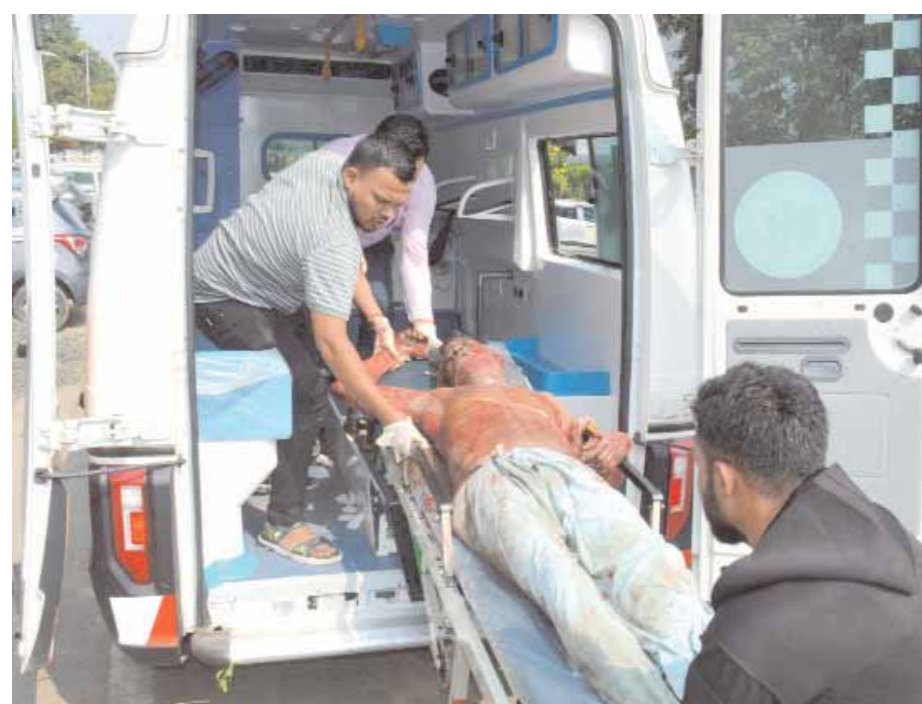
An injured person brought for treatment at a hospital following a blast at the Ordnance Factory in Khamaria, Jabalpur, Madhya Pradesh on Tuesday. Two reported dead and another 15 injured in the blast.

urement will take place at more than 1,400 centers with farmers receiving an MSP of Rs 4892 per quintal for their soybean. He instructed all ministers to oversee the arrangements at these procurement centers. In addition, Yadav stated that, in view of the upcoming Diwali festival, the salaries of all state officers and employees will be disbursed on October 28. The state will promote the establishment of Mineral-based manufacturing units. Yadav announced that the Indian Road Congress was inaugurated in Bhopal on October 19 in the presence of Union Minister Shri Nitin Gadkari. During the event, the state received approval for Rs. 9,390 crores for seven road projects, with an additional approval of Rs 20,403 crores for 27 more roads expected soon from the Central Government.