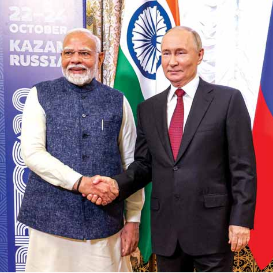
Prime Minister Narendra Modi during a bilateral meeting with Russian President Vladimir Putin, in Kazan, Tuesday

■ KAZAN The Russia-Ukraine conflict should be resolved in a peaceful manner and India is ready to provide all possible cooperation towards it, Prime Minister Narendra Modi said on Tuesday during his talks with Russian President Vladimir Putin. Modi held bilateral talks with