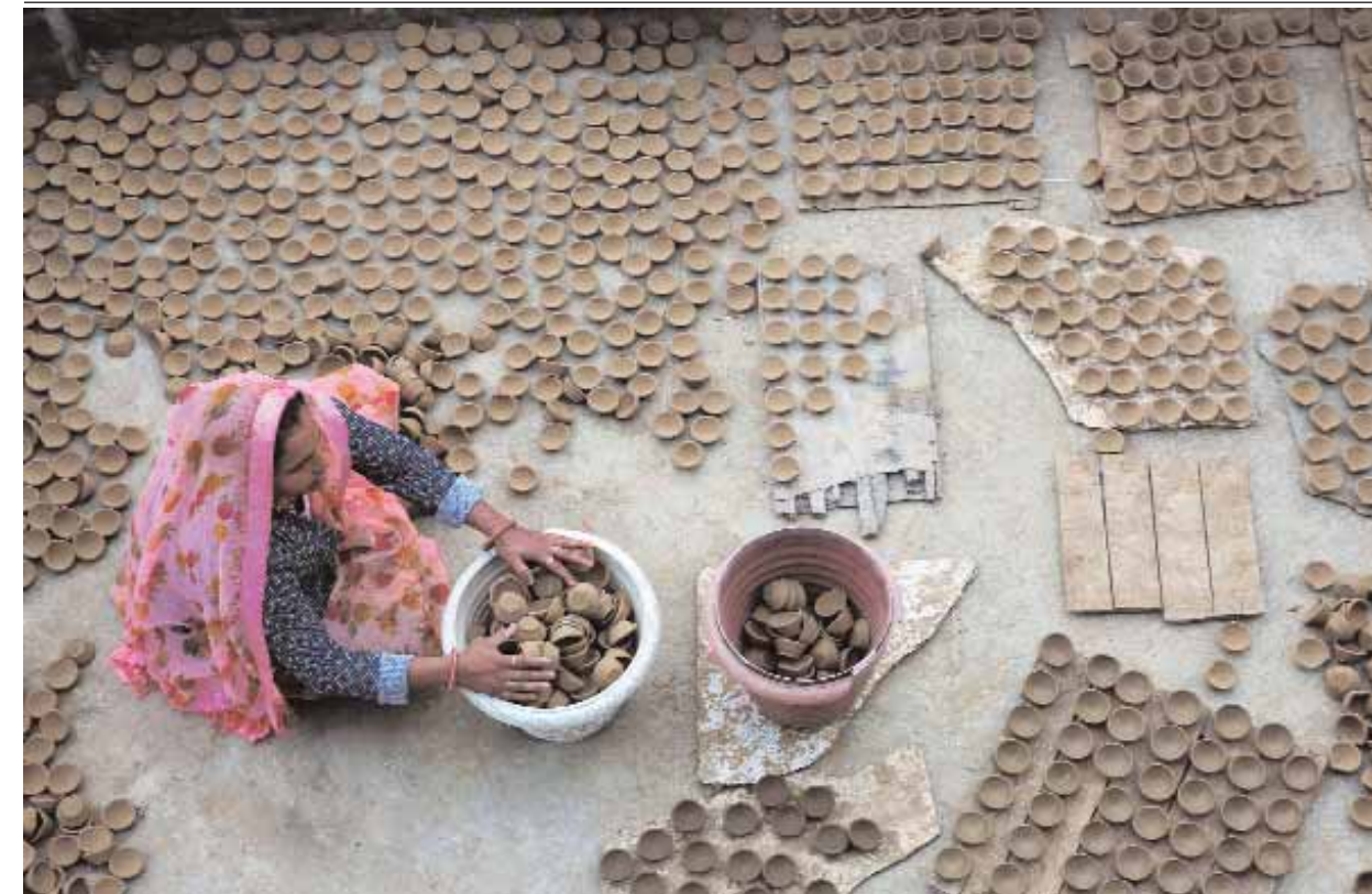
A woman collects dried earthen lamps ahead of the Diwali festival in Bhopal on Tuesday.