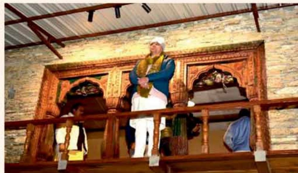
In 2024, the Ministry of Tourism, Government of India, awarded the title of Best Tourism Village to four villages in Uttarakhand: Jakhoul village and Harsil village in Uttarkashi district, Gunji village in the border area of Pithoragarh district, and Supi village in Bageshwar district.

The development of homestays in Uttarakhand has had a positive impact on the economy of the state. These accommodations provide tourists with not only unique and present with Uttarakhand Tourism Department there are around 5000 registered homestays listed. Nestled in the lap of Himalayas in these homestays provide comfortable cottages to traditional wooden houses that reflect the region's architectural style, each homestay offers tourists a welcoming and comfortable environment, allowing them to connect with the local community. The development of homestays in Uttarakhand has had a positive impact on the state's economy. These accommodations provide tourists with not only a unique and personalized experiences but also promote local businesses by creating employment opportunities. As a result, their contribution is strengthening the local economy. Homestay owners often collaborate with local artisans, farmers, and service providers. This promotes local supply chains and sustainable development. Homestays have played a crucial role in curbing migration from the state. Homestays have played a significant role in preventing migration