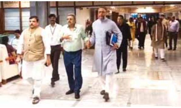
Members of Joint Parliamentary Committee on Waqf (Amendment) Bill leave after a meeting at Parliament House Annex, in New Delhi, Tuesday