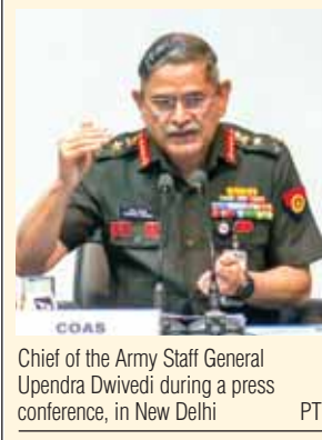
Chief of the Army Staff General Upendra Dwivedi during a press conference, in New Delhi

humanity. India is ready to provide all possible cooperation in times to come," he said. "We have the opportunity to discuss all these issues," he added. On his part, Putin noted the "good condition" of trade turnover between Russia and India. In his remarks, Modi also referred to his summit talks with the Russian leader in Moscow in July. Our annual summit resulted in strengthening cooperation in every field, he said. The Prime Minister also congratulated Putin on Russia's successful presidency of BRICS. Many countries want to join the grouping now, he added. "It is a matter of great pleasure for me to have the opportunity to visit a beautiful city like Kazan for the BRICS summit. India has deep and historical ties with this city," Modi said. "The opening of India's new consulate in Kazan will further strengthen these ties," he added. It is learnt that the Ukraine conflict figured prominently at the meeting. In the summit talks on July 9 in Moscow, Modi told Putin that a solution to the Ukraine conflict is not possible on the battlefield and peace efforts do not succeed in the midst of bombs and bullets. Weeks later he travelled to Ukraine. In his talks with Zelenskyy, Modi said both Ukraine and Russia should sit together without wasting time to end the ongoing war and that India was ready to play an "active role" to restore peace in the region. India has been maintaining that the conflict in Ukraine must be resolved through dialogue and diplomacy.