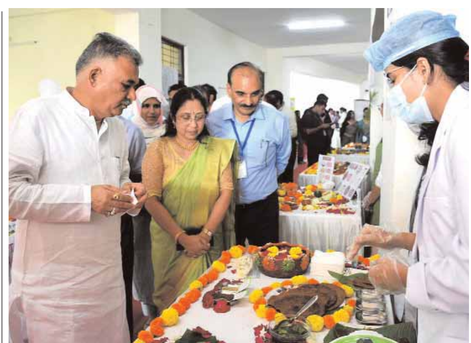
Minister for AYUSH Inder Singh Parmar goes through an exhibition after its inauguration during 9th National Ayurveda Day celebration as 'Ayurveda Innovation for Global Health' at Government Pt Khushilal Sharma Ayurvedic College and Hospital in Bhopal on Tuesday.

Approval for the creation of 6388 new posts under health institutions The Cabinet approved the creation of a total of 6388 new posts (5936 regular and 452 contractual) in the total 454 health institutions sanctioned in 2022-23 and 2023-24 under the Department of Public Health and Medical Education. Apart from this, approval was also given to hire 1589 outsourcing agencies. The annual estimated expenditure on the creation of posts amounting to Rs 351 crore 17 lakh was approved. It has been approved to fill all the posts in the year 2024-25 by creating newly created posts.