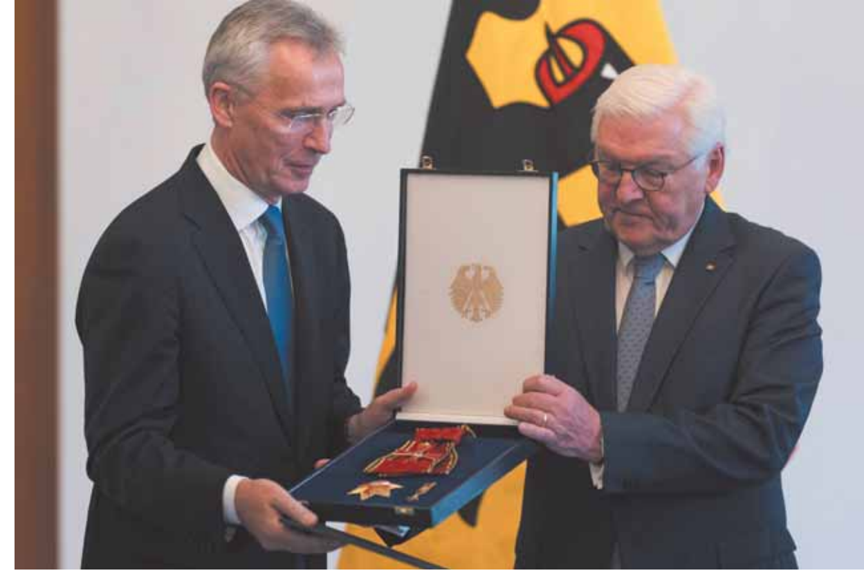
Former NATO Secretary General Jens Stoltenberg (left) receives the Grand Cross of the Order of Merit of the Federal Republic of Germany from German President Frank-Walter Steinmeier at Bellevue Palace, Berlin on Tuesday.

this year while lowering its expectations for growth in Europe and China. The IMF expects the US economy — the world's largest — to expand 2.8 per cent this year, down slightly from 2.9 per cent in 2023 but an improvement on the 2.6 per cent it had forecast for 2024 back in July. Growth in the United States has been led by strong consumer spending, fuelled by healthy gains in inflation-adjusted wages. The meetings mark the last major international finance gathering held during the Biden administration and come as economic issues are a top concern for American voters. Republicans have blamed the Biden-Harris administration for inflation that reached a 40-year high before dropping. Trump campaign press secretary Karoline Leavitt said in a statement that the Biden-Harris administration "created an inflation crisis, record-high gas prices, skyrocketing mortgage and interest rates resulting in the lowest consumer and small business confidence in decades". Voters remain largely divided over whether they prefer the Republican nominee, Trump,