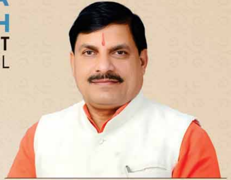
DR. MOHAN YADAV CHIEF MINISTER

GLOBAL INVESTORS SUMMIT FEBRUARY 2025, BHOPAL