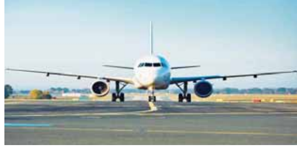
While it (SUASCA) takes care of the offences when the aircraft is in travel, in flight, if we want to address these kinds of threats that have been happening. We want to take strict action against people who are behind this when there is a fake or hoax threat that they are trying to do, we have to cover the act on the ground and the airport also. So we are trying to make an amendment. Our legal team has worked very thoroughly on this and we are coming up with an amendment," Naidu said.

After unabated bomb threat messages to multiple Indian airlines in the past one week, lead to diversions, cancellations and passenger inconvenience, the Union government is planning to make hoax threat calls to Indian airlines a cognisable offence. The government is also planning to put hoax callers on a 'no fly list'.