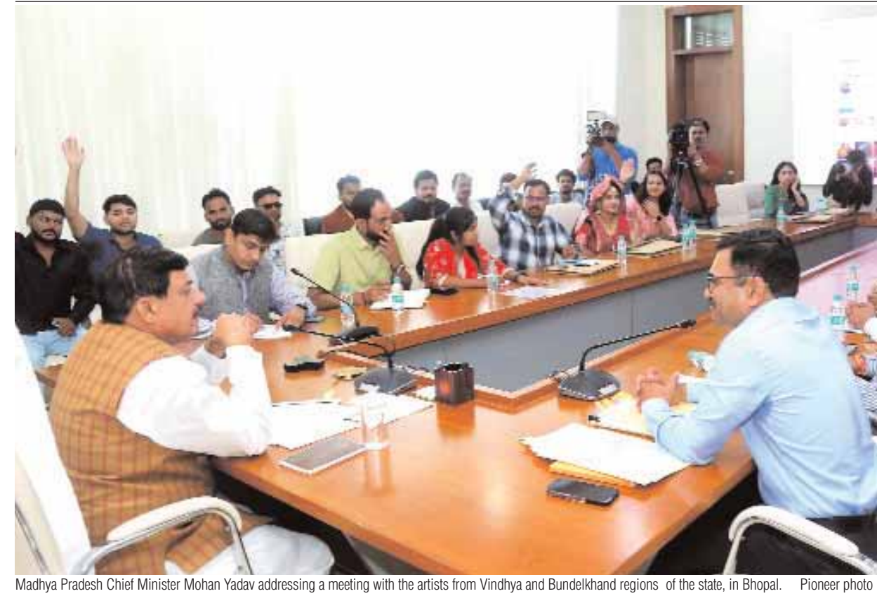
Madhya Pradesh Chief Minister Mohan Yadav addressing a meeting with the artists from Vinhya and Bundelkhand regions of the state, in Bhopal.