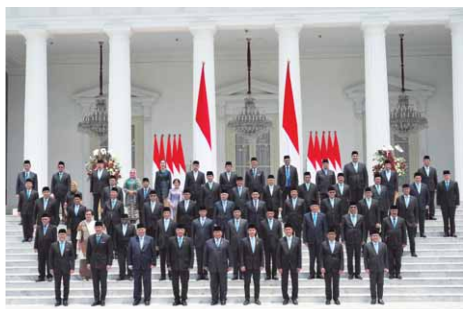
Indonesian President Prabowo Subianto, front centre, and Vice President Gibran Rakabuming Raka, front row fourth from right, pose for a group photo with newly-appointed cabinet ministers after their swearing-in ceremony at Merdeka Palace in Jakarta, Indonesia, on Monday.

Newly inaugurated President Prabowo Subianto swore in Indonesia's largest Cabinet since 1966 on Monday, with 109 members representing his pledge for a strong government. He announced the lineup late Sunday and named his Cabinet of ministers, vice ministers and head of national agencies the "Red and White Cabinet," referring to the colours of Indonesia's flag. Subianto became the eighth president of Southeast Asia's largest economy on Sunday. The Cabinet of Subianto's predecessor, Joko Widodo, had 34 ministers and head of government agencies. Subianto's Cabinet is the largest since 1966 when Indonesia's first President Sukarno formed a lineup of 132 ministers in an extremely tense political situation after a failed 1965 coup.