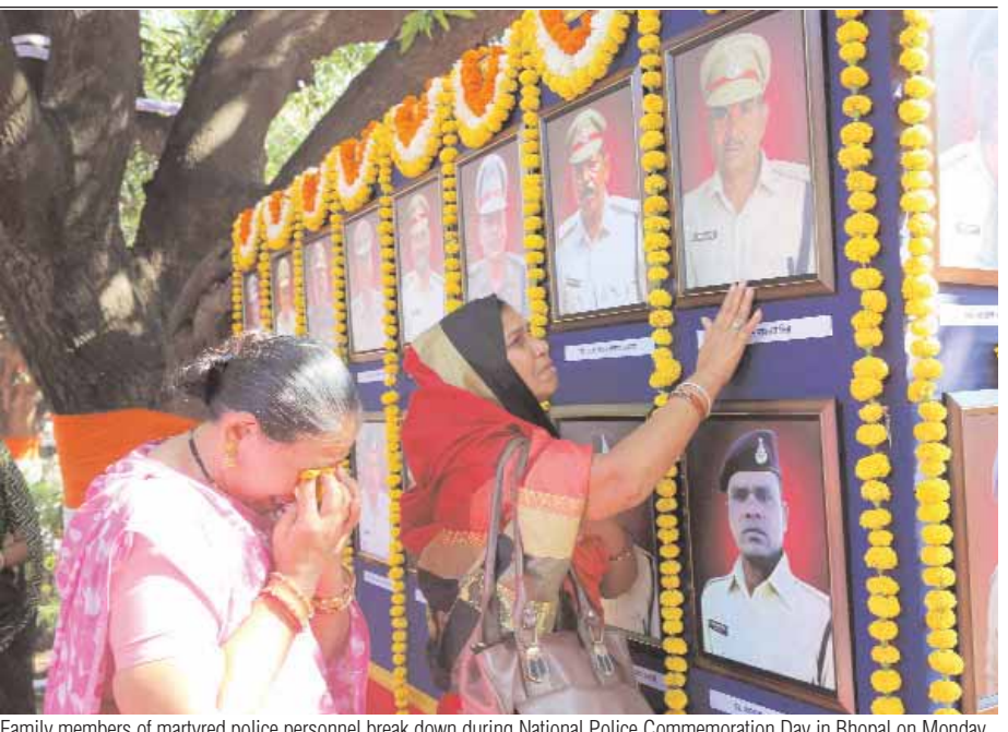
Family members of martyred police personnel break down during National Police Commemoration Day in Bhopal on Monday.