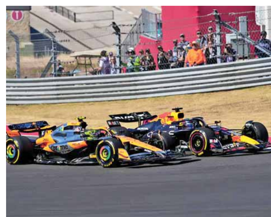
that gap. Verstappen won the Texas sprint race for his first victory of any kind since the sprint race in Austria. And even if

Sunday's finish had been reversed, Norris would have come out of the weekend of any kind closer to the championship.