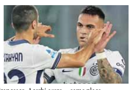
same place. Both sides hit the woodwork in the first half. A cross from Lorenzo Pellegrini bounced out of the arms of Yann Sommer and onto the post but the Inter goalkeeper managed to catch the rebound. Former Roma midfielder Henrikh Mkhitaryan sent a powerful effort off the crossbar shortly afterward. Inter broke the deadlock when Davide Frattesi raced down the right flank on the counterattack and his low cross was deflected to Lautaro to thump into the back of the net. CONTE INSPIRES NAPOLI: Whatever Antonio Conte told his players at halftime must have worked as Napoli was much improved after the break. Empoli was far the better team in the first period but it was to regret its missed opportunities as it was Napoli that took the lead in the 63rd minute after Tino Anjorin fouled Matteo Politano in the area.

AP ■ MILAN Shortly after Inter Milan president Giuseppe Marotta lamented that the fixture list needed to be cut in order to safeguard the players, the Nerazzurri lost two key members of its team to injury. Hakan Calhanoglu and Francesco Acerbi were both forced off with muscular issues in the first half of Inter's match at Roma. Inter went on to win 1-0, thanks to a 60th-minute strike by Lautaro Martinez, to move back to within two points of Serie A leader Napoli, which had earlier beaten Empoli 1-0. The match was the first of seven in 21 days in an intense period for Inter, which will also play more games than almost any other club this season. As well as the Italian league, Inter is involved in the Champions League, the Italian Cup and Italian Super Cup, and has qualified for the newly expanded Club World Cup. "We have to live with the constant stress of so many games that the players are struggling to handle ... we need to safeguard their health," Marotta said before Sunday's match. "It is not an easy situation ... but we need to sit around a table and recognize that the fixture list