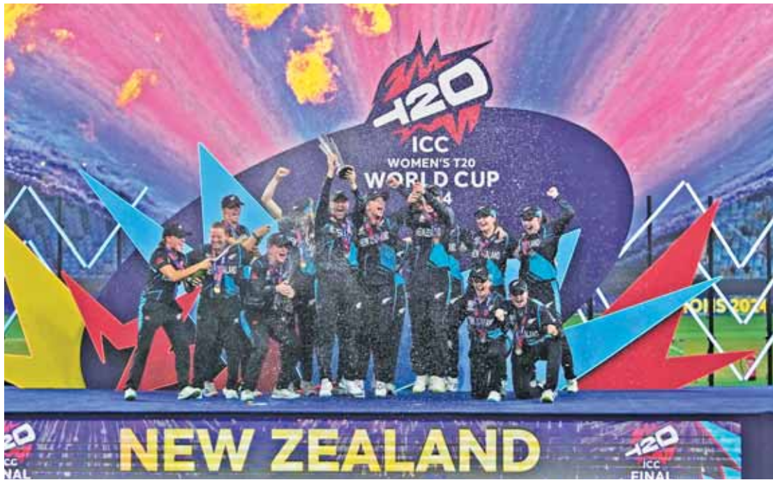
South Africa to 126-9.

New Zealand made 158-5, batting first in the final, helped by Suzy Bates who made 32, Amelia Kerr who made 43 and Brooke Halliday who made 38. Kerr then took 3-24 and Rosemary Mair 3-25 as New Zealand restricted