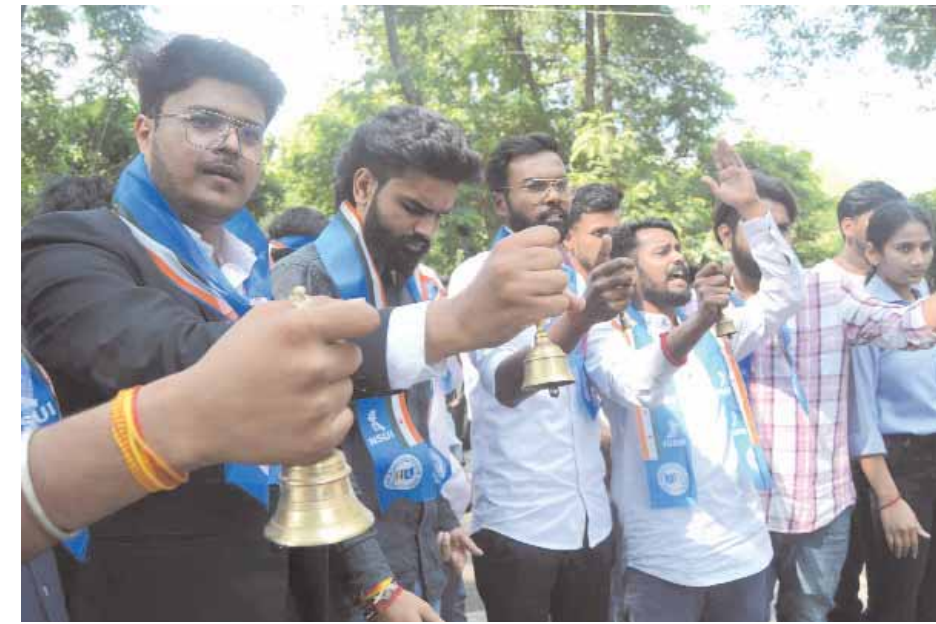
NSUI activists stage a protest ringing bells under 'Campus Chalo Abhiyan' at Barkatullah University campus in Bhopal on Monday.