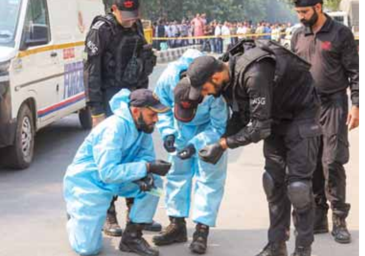
National Security Guard (NSG) personnel conduct investigations at the site of the blast at Prashant Vihar, near the CRPF school in Rohini area of New Delhi on Sunday