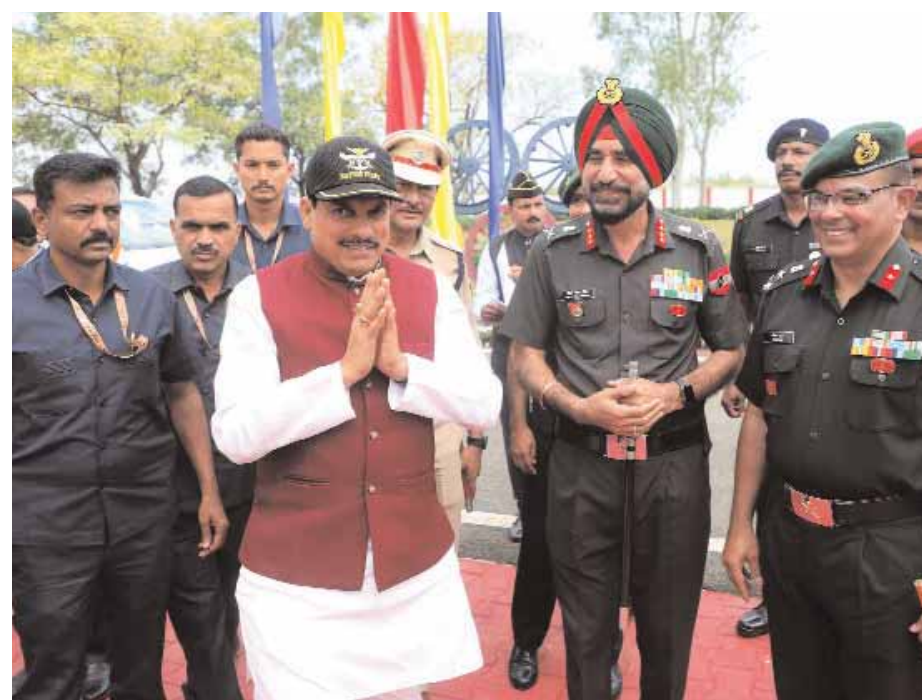
Madhya Pradesh Chief Minister Mohan Yadav with army officers during Ex-Servicemen Rally-2024, organised at 3 Electronic Mechanical Engineering (EME) center in Bhopal on Sunday.

increase the posts of employees at Assistant Grade-3 level in District Sainik Welfare Offices along with reservation for ex-servicemen with Group C and D posts of all government departments. Under government schemes, soldiers are given reservations for land. Indian Navy Chief Admiral Dinesh Tripathi said that Madhya Pradesh has a history of bravery and courage. Madhya Pradesh has so far given 3 Ashok Chakras, 5 Mahavir Chakras, and 23 Veer Chakras to the country. In the last 25 years, more than 100 soldiers have laid down their lives for the country. This felicitation ceremony is dedicated to the dedication, capable leadership and contribution of ex-servicemen. He thanked all the ex-servicemen for their contributions to the Army.