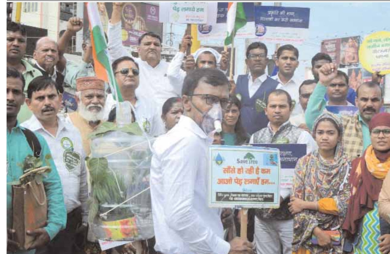
Social activists during an awareness campaign for environment conservation, at Roshanpura square in Bhopal on Sunday.