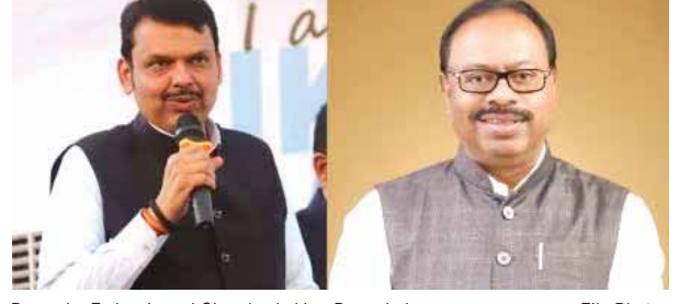
Devendra Fadnis and Chandrashekhar Bawankule

The ruling Bharatiya Janata Party (BJP) on Sunday retained 71 of its sitting MLAs, as it released its first list of 99 candidates for the Maharashtra Assembly polls that contained the names of its bigwigs like Deputy Chief Minister Devendra Fadnis, state unit President Chandrashekhar Bawankule and as many as 13 women candidates. With the Opposition Maha Vikas Aghadi (MVA) still to formalise its tie-up among its constituents and its own MahaYuti allies - the Shiv Sena (Eknath Shinde) and Nationalist Congress Party (Ajit Pawar) having not released their lists of candidates yet, the BJP became the first major political party in Maharashtra to get off the blocks for the November 20 Assembly polls. The BJP, which heads the grand ruling alliance MahaYuti, is likely to contest anywhere from 155 to 160 seats out of the total 288 seats in the 2024 Assembly polls, as against 164 seats it had contested in the 2019 Maharashtra Assembly polls. The BJP released its first list of