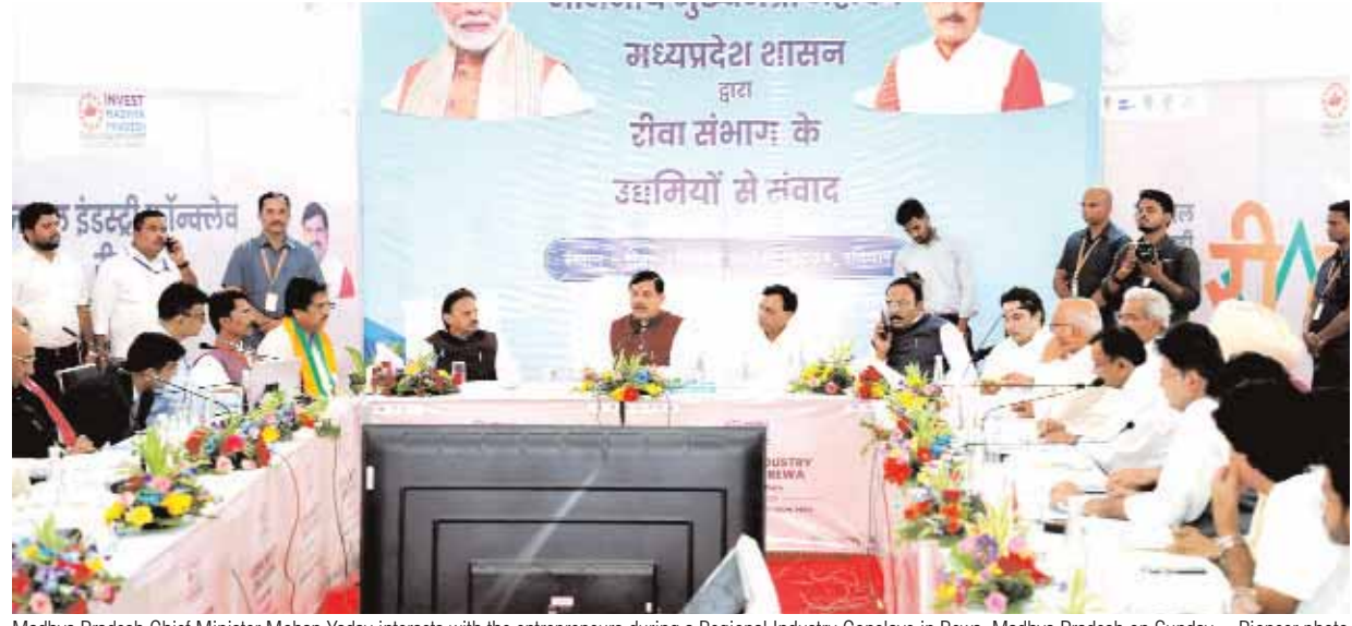
Madhya Pradesh Chief Minister Mohan Yadav interacts with the entrepreneurs during a Regional Industry Conclave in Rewa, Madhya Pradesh on Sunday.