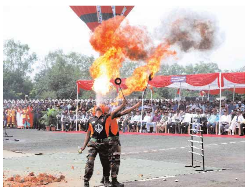
Army corps of Victorians Gatka Warriors exhibit their skills during Ex-Servicemen Rally-2024, organised at 3 Electronic Mechanical Engineering (EME) center in Bhopal on Sunday.

aircraft will soon be provided to transport goods from Vindhya. Also, Vindhya residents will be provided air travel for Rs 999. Due to the efforts of Prime Minister Modi and the UDAN scheme, even poor people have got the facility of air travel. Yadav said that air ambulance and heli service have been started for assistance to critical patients. Critical patients are being taken to State of the art hospitals by air free of cost. Today, on the day of Karva Chauth fast, Rewa has been gifted with an airport that has doubled the joy of festivity. 25 airstrips along with 6 airports have been developed in the state. Airstrips will be built in every district of the state. Airports will be built by developing the airstrips of Ujjain, Shivpuri and Datia.