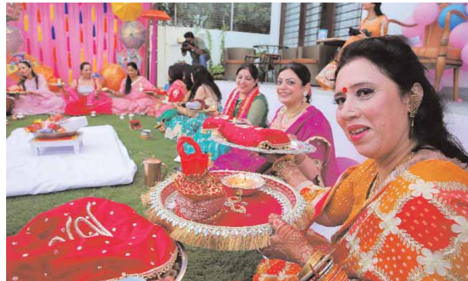
Women perform rituals as they offer prayers on the occasion of Karva Chauth festival in Bhopal on Sunday.

intention to get a ticket. I don't need a ticket to reach out to the people of Budhni. We are ideology-centric people. Nothing could be a bigger fortune for me that party workers put forward my name. I promise that the way the election has been fought in Budhni under the leadership of Shivraj Chouhan, it will be the same this time. We will fight together and win," he said. "As a worker, I have worked for the people of Budhni, the party and the ideology. The ideology strings every party worker together like a garland. I promise that I will leave no stone unturned in the Budhni elections," the BJP leader added. The by-polls in Budhni will be held on November 13 and votes will be counted on November 23.