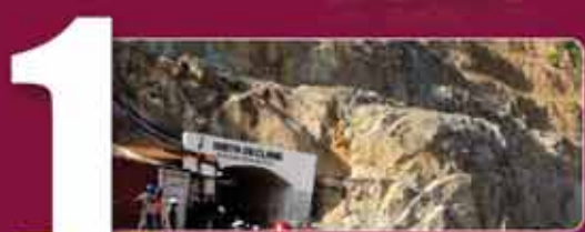
1 स्थान मैंगनीज और कॉपर अयस्क उत्पादन