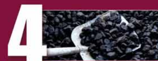
4 स्थान कोयला उत्पादन