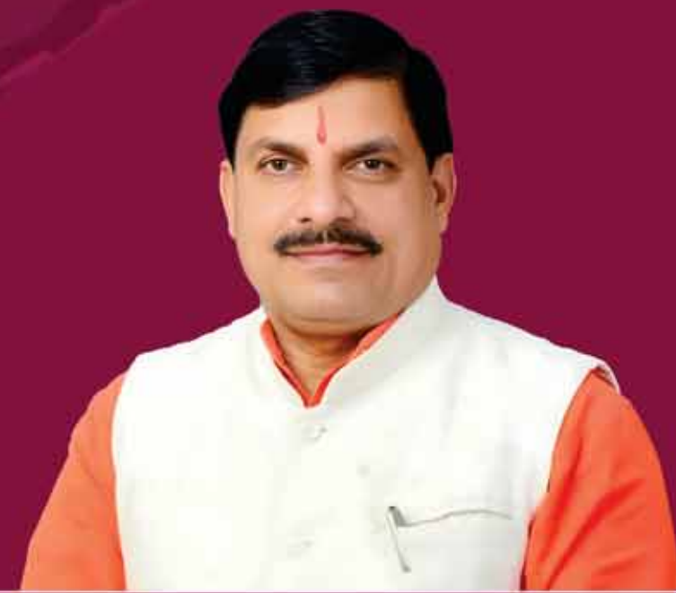
डॉ. मोहन यादव, मुख्यमंत्री