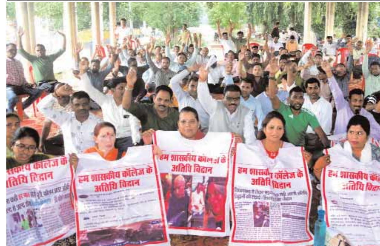
Madhya Pradesh Guest Teachers stage a protest demanding regularisation of their jobs, at Neelam Park in Bhopal on Wednesday.