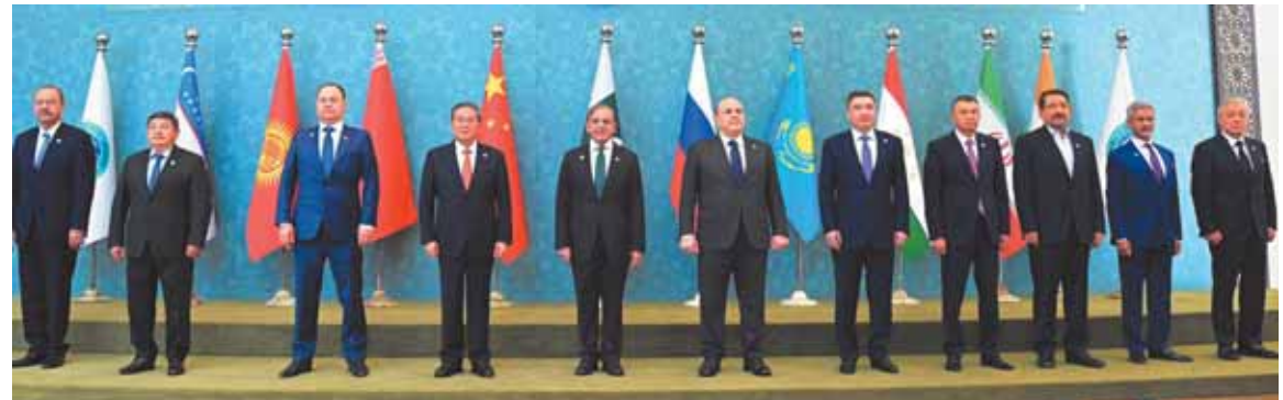
Pakistan's Prime Minister Shehbaz Sharif (centre), China's Premier Li Qiang, Belarus Prime Minister Roman Golovchenko, Russian Prime Minister Mikhail Mishustin, Kazakhstan's Prime Minister Olzhas Bektenov, Tajikistan's Prime Minister Kokhir Rasulzoda, and other leaders pose for group photo at the opening session of Shanghai Cooperation Organization (SCO) meeting in Islamabad, on Wednesday.

Pakistan Prime Minister Shehbaz Sharif on Wednesday rooted for Beijing's Belt and Road Initiative at the SCO summit here, saying such connectivity projects should not be viewed through a "narrow political prism" — an apparent reference to India's reluctance to endorse it. In his opening remarks at the Shanghai Cooperation Organisation summit, he said efforts like China's Belt and Road Initiative and the China-Pakistan Economic Corridor, which is a part of the larger project, should be expanded. India has shown little enthusiasm for the China's "unilateral" initiative. And it has repeatedly criticised the China-Pakistan corridor for violating its territorial integrity as it involves building infrastructure in Pakistan-occupied Kashmir. Indirectly challenging India's position, Sharif said, "Let us not look at such projects through the narrow political prism, and invest in our collective connectivity capacities which are crucial to advancing the shared vision of an economically integrated region." In his speech later, External Affairs Minister S Jaishankar said trade and connectivity initiatives must recognise territorial integrity and sovereignty and it is essential to have an "honest conversation" on lack of trust, a remark seen as an indirect reference to China. The SCO comprises China, India, Russia, Pakistan, Iran, Kazakhstan, Kyrgyzstan, Tajikistan, Uzbekistan and Belarus. Sixteen more countries are affiliated as observers or "dialogue partners".