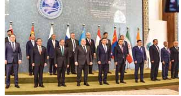
External Affairs Minister S Jaishankar with Pakistan Prime Minister Shehbaz Sharif and other leaders during the 23rd meeting of the SCO Council of Heads of Government, in Islamabad, Pakistan, Wednesday