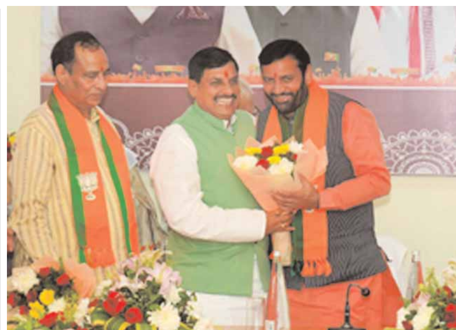
Madhya Pradesh Chief Minister and observer Mohan Yadav greets newly elected leader of the Haryana BJP Legislature Party Nayab Singh Saini during a meeting in Panchkula, Haryana on Wednesday. Nayab Singh Saini was elected as leader of the BJP legislature party and will take oath on October 17.

ulation of 400 to 800 and there- after 01 Anganwadi center for every multiple of 800. Similarly, under PM Janman, a total of 549 new Anganwadi centers and 572 buildings have been approved by the Government of India. Under PM-Janman, 100 percent financial assistance is provided for building construction. A provision of Rs 68.64 crore at the rate of Rs 12 lakh per building has been made for Madhya Pradesh. Saksham Anganwadi Center The work of strengthening Anganwadi centers is going on continuously. Along with electricity, other facilities are also being provided in the centers with public cooperation. In the last two financial years in the state, a total of 11 thousand 706 Anganwadi centers have got the benefit of upgradation as capable Anganwadi centres.