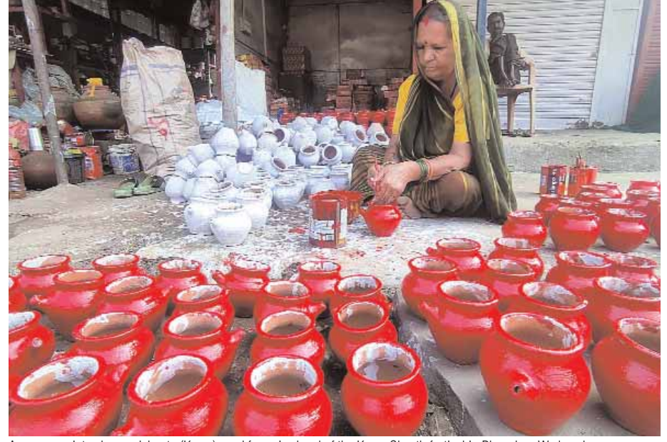
A woman paints clay model pots (Karva) used for puja ahead of the Karva Chauth festival in Bhopal on Wednesday.