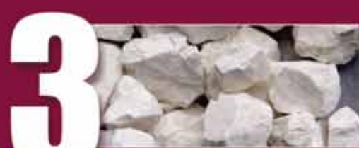
3 स्थान चूना उत्पादन