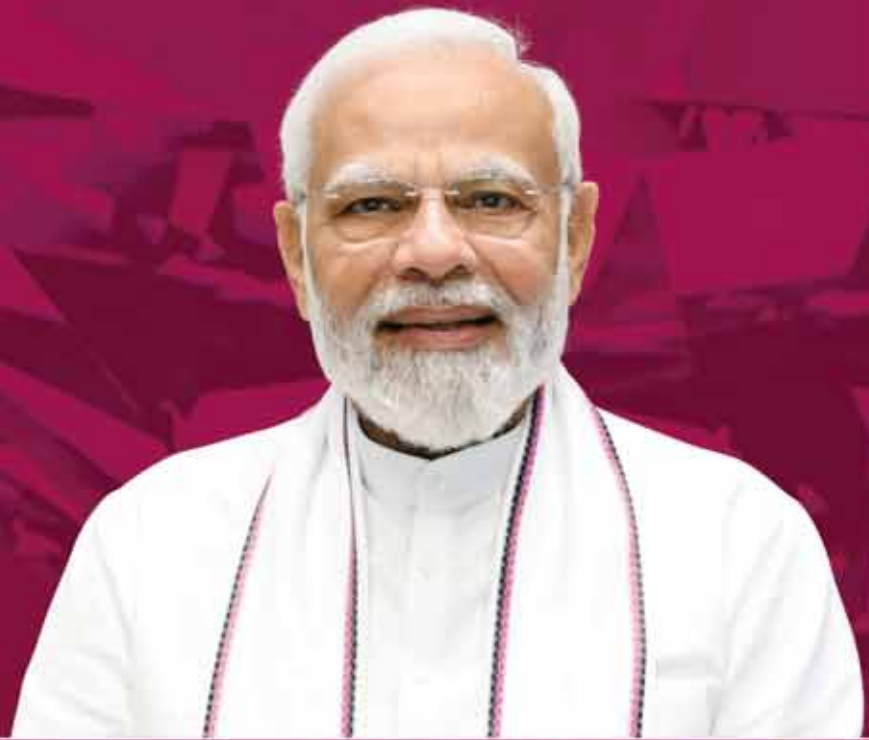
नरेन्द्र मोदी, प्रधानमंत्री