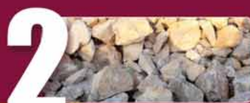
2 स्थान रॉक फॉस्फेट उत्पादन