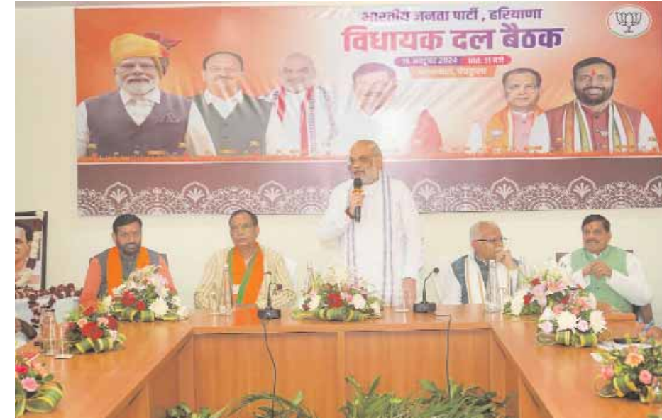
Union Home Minister and observer Amit Shah addresses Haryana BJP Legislature Party meeting as another observer and Madhya Pradesh Chief Minister Mohan Yadav also seen, in Panchkula, Haryana on Wednesday. Nayab Singh Saini was elected as leader of the BJP legislature party and will take oath on October 17.