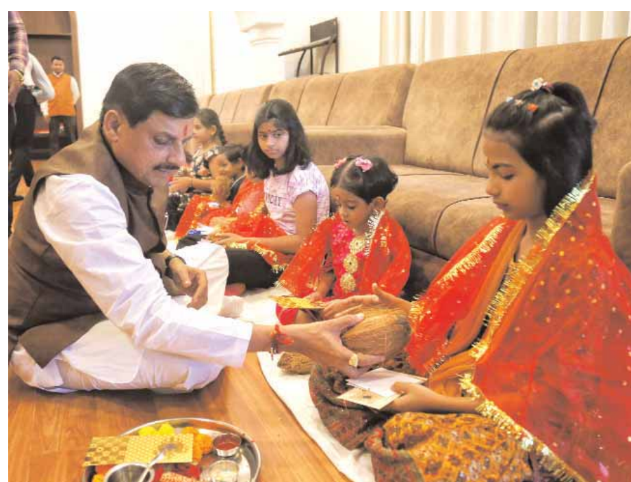
Madhya Pradesh Chief Minister Mohan Yadav performs Kanya Pujan on the occasion of Durga Maha Navami at his residence in Bhopal on Friday.

state including Bhopal till Diwali. The Meteorological Department has issued an alert of thunderstorms and light rain in the state for the next 72 hours which means monsoon will depart only after Dussehra. Due to the current system, there is a possibility of rain in some districts. This year, the state has received 44.1 inches of rain. Jabalpur division has been at the forefront in terms of rainfall. Mandla district received the highest rainfall. More than 60.6 inches of rainfall, 56.8 inches of rainfall in Seoni Sheopur, Niwari and Rajgarh have received more than 52 inches of rain. The top-10 districts with the highest rainfall include Bhopal, Sagar, Alirajpur, Dindori and Chhindwara districts.