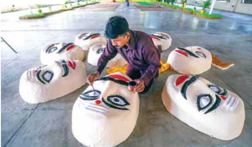
An artist paints effigies of the demon king Ravana on the Dussehra, in Prayagraj