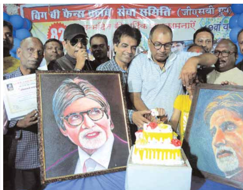
Fans of Bollywood superstar Amitabh Bachchan cut a cake to celebrate his 82nd birthday in Bhopal on Friday.

However, no action has been initiated against the police officials responsible for neglecting the demands of the BJP legislator. In the recent drug haul in the state capital, no action has been taken against officials under whose watch such a massive operation of producing and transporting the illicit substance was taking place. Political observers feel that during the Guna bus accident incident, the Chief Minister wanted to signal to the officials that no laxity would be tolerated by the new government; the steps taken back then had been easier, as all the officials transferred at the time had been posted by the previous government led by Shivraj Singh Chouhan.