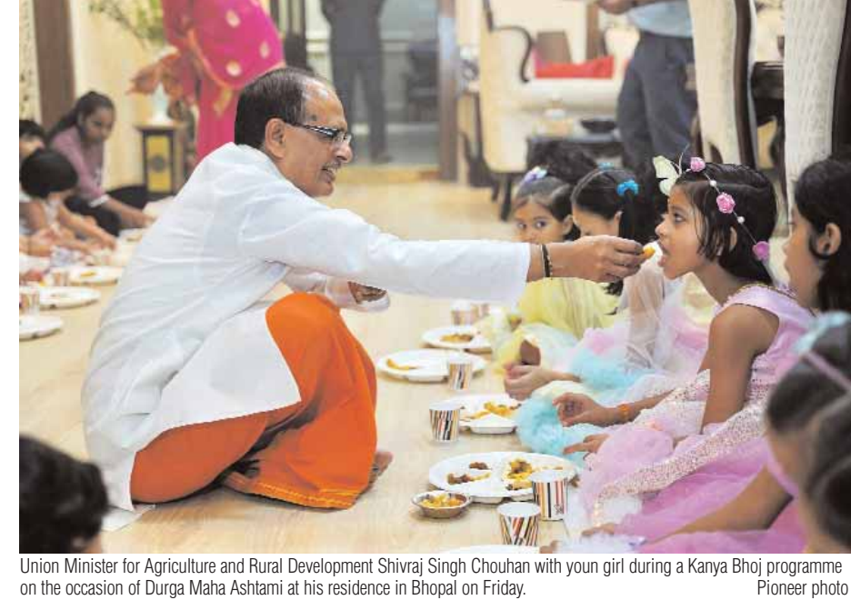
Union Minister for Agriculture and Rural Development Shivraj Singh Chouhan with young girl during a Kanya Bhoj programme on the occasion of Durga Maha Ashtami at his residence in Bhopal on Friday.