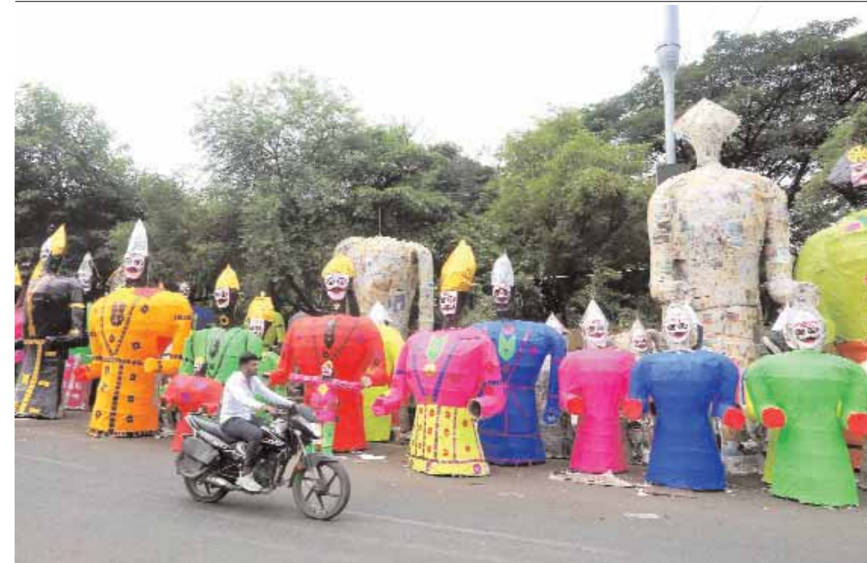
Street artists display effigies of demon king Ravana kept for sale at a roadside ahead of the Dussehra festival in Bhopal on Friday.