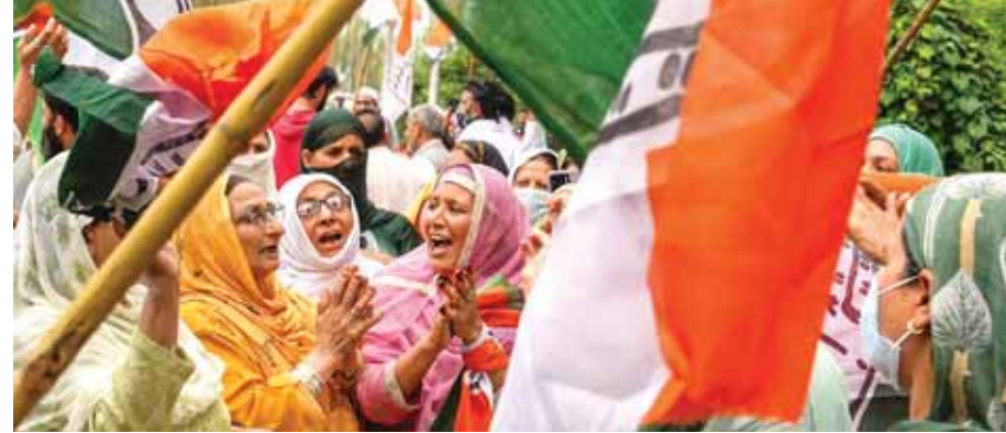
Supporters of Congress and National Conference (NC) celebrate as the Congress-NC alliance leads during the counting of votes of Jammu & Kashmir Assembly elections, in Srinagar, Tuesday