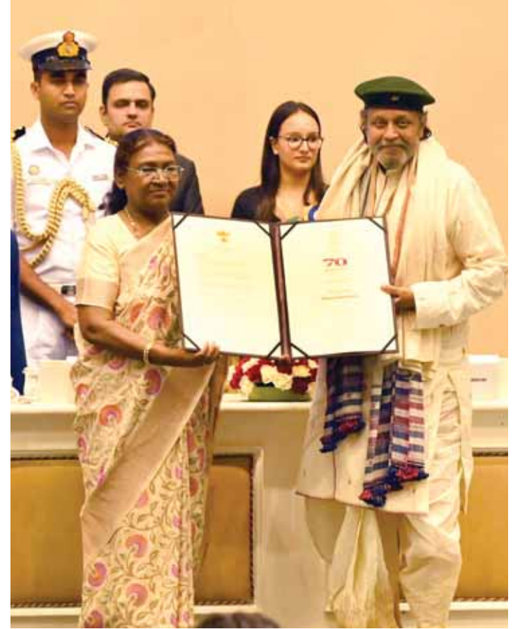
President Droupadi Murmu presents the Dadasaheb Phalke Award to veteran actor Mithun Chakraborty during the 70th National Film Award ceremony at Vigyan Bhawan, in New Delhi, Tuesday