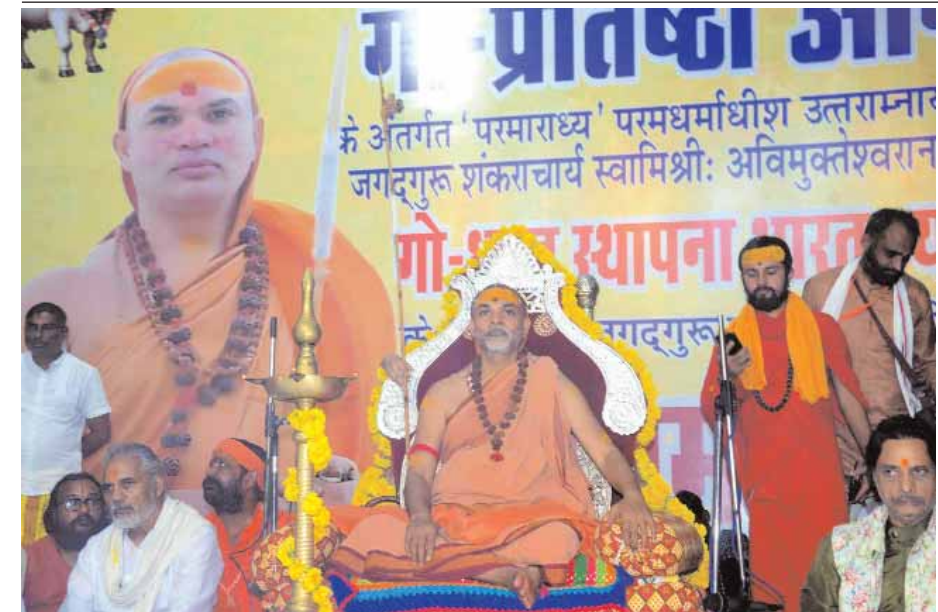
Jagatguru Shankaracharya Jyotish Peeth, Uttarakhand Swami Avimukteshwarananda Saraswati in a Dharmya Sabha during Gau Pratishtha Andolan, at Manas Bhawan in Bhopal on Tuesday.