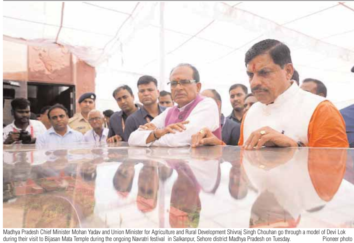
Madhya Pradesh Chief Minister Mohan Yadav and Union Minister for Agriculture and Rural Development Shivraj Singh Chouhan go through a model of Devi Lok during their visit to Bijasan Mata Temple during the ongoing Navratri festival in Salkanpur, Sehore district Madhya Pradesh on Tuesday.

Bhopal: Mayor Malti Rai reviewed the performance of the mayoral helpline on Tuesday and instructed officials to strive for speedy resolution of citizen complaints.