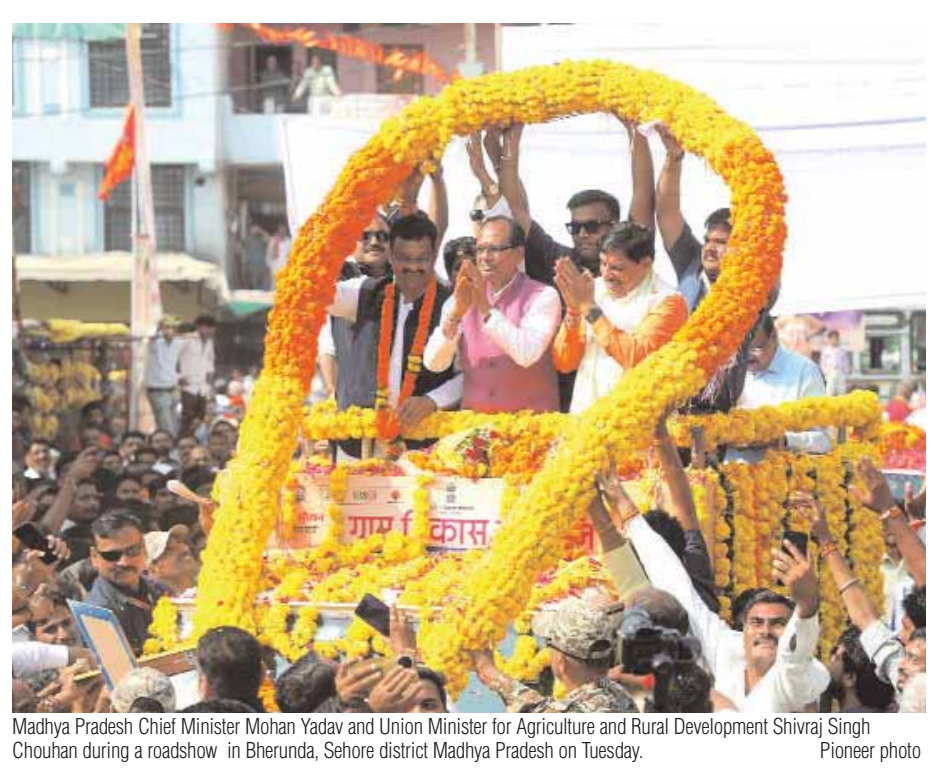
Madhya Pradesh Chief Minister Mohan Yadav and Union Minister for Agriculture and Rural Development Shivraj Singh Chouhan during a roadshow in Bherunda, Sehore district Madhya Pradesh on Tuesday.

Chief Minister for his relentless work toward the state's development, highlighting the remarkable achievements he has brought to the people of Bhairunda.