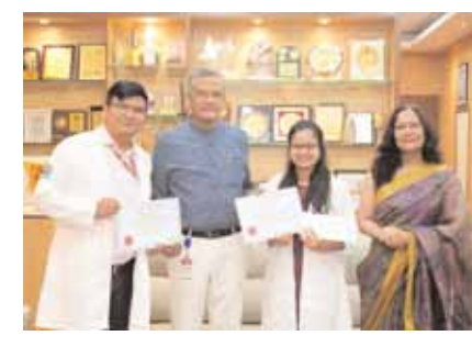
Damage: Impact of Ambulatory Blood Pressure Abnormalities and Sleep Apnea in Children with Sickle Cell Disease, was recognized among top submissions from various medical institutes across India.

AIIMS Bhopal has achieved remarkable milestones in various academic forums. The active participation of faculty members in conferences and workshops not only enhances their skills but also keeps them updated with the latest advancements in medical science.