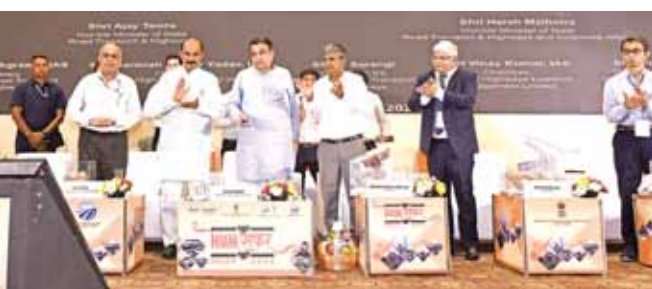
The Union Minister of Road Transport and Highways, Shri Nitin Gadkari launching the 'Humsafar Policy' 2024 at The Ashok Hotel, in New Delhi