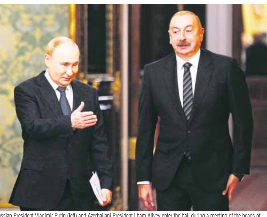
Russian President Vladimir Putin (left) and Azerbaijani President Ilham Aliyev enter the hall during a meeting of the heads of state of the Commonwealth of Independent States (CIS) at the Kremlin in Moscow, Russia, on Tuesday.