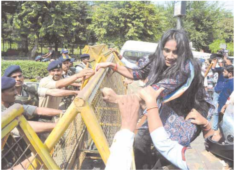
National Student Union of India (NSUI) activists during a demonstration against the local police failure after Gujarat, Delhi Anti Terrorist Squad and Narcotics Control Bureau conduct a joint raid and seized drugs worth in crores from a factory, in Bhopal on Monday