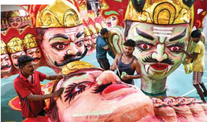
An artisan gives finishing touches to effigies of Ravana and Meghanad ahead of the Dussehra festival, in Nagpur