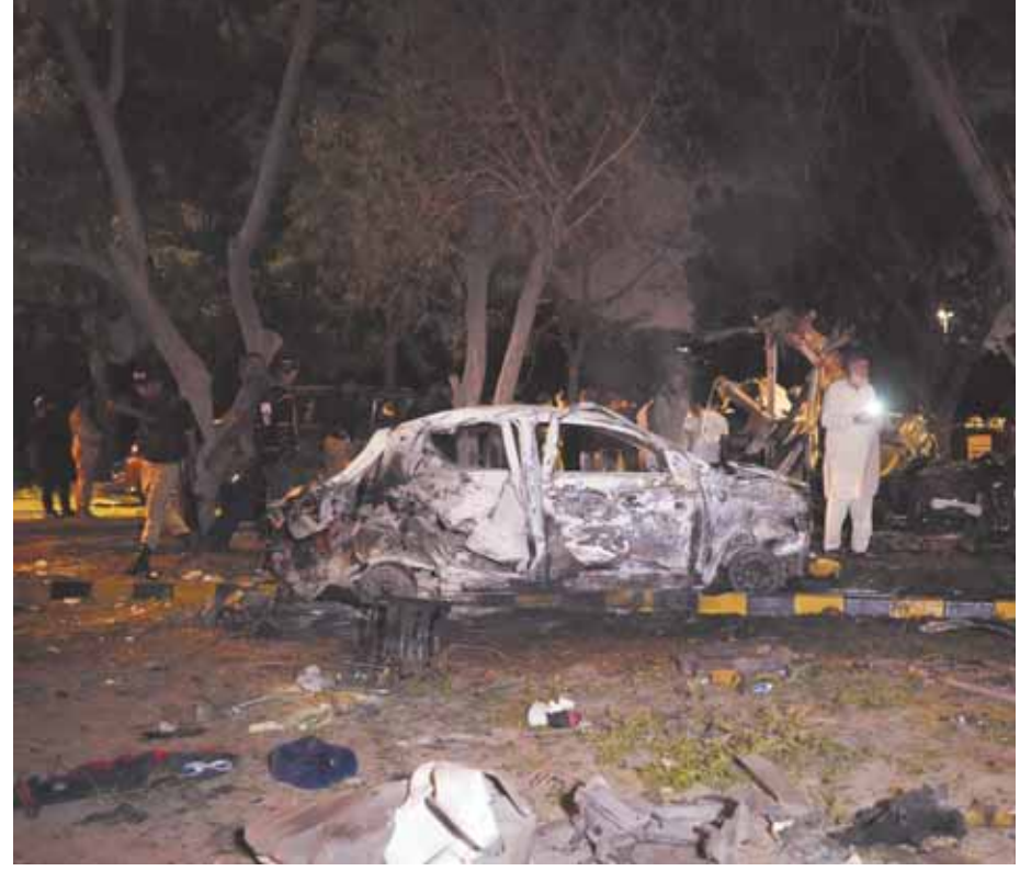
Security officials examine the site of an explosion that caused injuries and destroyed vehicles outside the Karachi airport, Pakistan, early Monday.

incident. Flight schedules at the airport are continuing as normal. Balochistan, bordering Iran and Afghanistan, is home to a long-running violent insurgency. Baloch insurgent groups have previously carried out several attacks targeting CPEC projects. The BLA accuses China and Islamabad of exploitation of the resource-rich province, a charge rejected by the authorities. It has fought a long-running insurgency for a separate homeland. The group in the last two years carried out similar suicide bomb attacks in Karachi targeting foreign nationals. The BLA in March this year claimed responsibility for an attack on a Pakistani naval air base near China-run Gwadar port. In April 2022, the group killed three Chinese tutors and a Pakistani driver in a suicide bombing near Karachi University's Confucius Institute. In November 2018, gunmen killed at least four people in an attack on the Chinese consulate in Karachi.