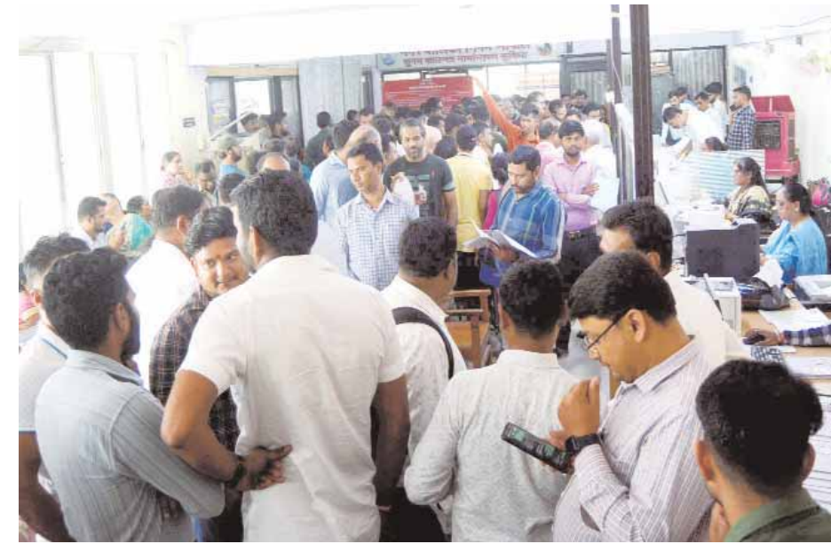
A crowd of consumers to get their property registered during the ongoing Navratri festival at the district Registrar office in Bhopal on Monday.