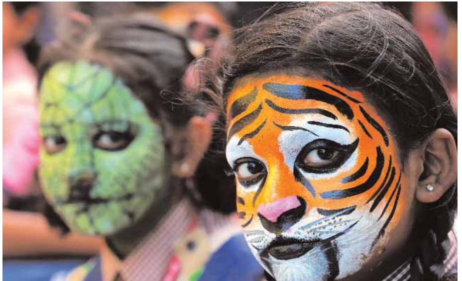
Students take part in a face painting competition under wildlife week celebrations, at Van Vihar National Park in Bhopal on Monday.