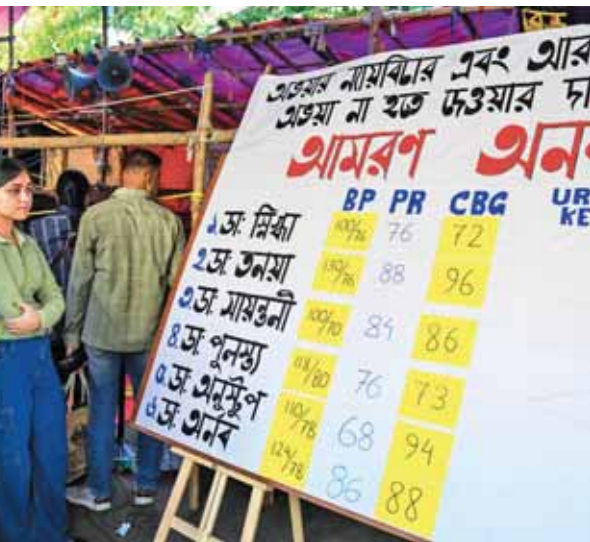
A chart shows medical parameters of some junior doctors protesting against the RG Kar Medical College and Hospital rape and murder incident, in Kolkata.