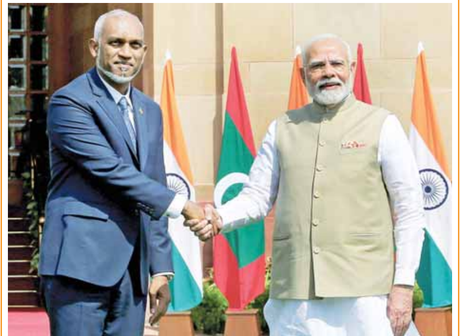
Prime Minister Narendra Modi shakes hands with Maldives President Mohamed Muizzu prior to a meeting at Hyderabad House.