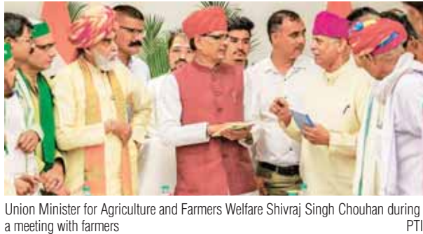
Union Minister for Agriculture and Farmers Welfare Shivraj Singh Chouhan during a meeting with farmers.