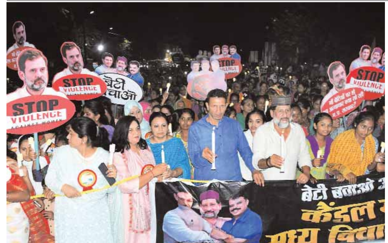
Congress State President Jitu Patwari and party MLA Arif Masood lead a candle march to protest against the increasing incidents of rape and other crime with minors, under the 'Beti Bachao' campaign in Bhopal on Monday.