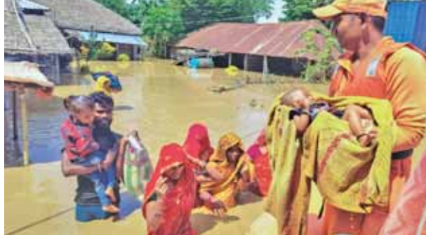
NDRF personnel conduct a rescue operation at a flood affected area, in Bihar's Supaul district

Flood situation in several parts of Bihar worsened on Monday as embankments of Kosi river in Darbhanga district and Bagmati river in Sitamarhi were breached, officials said.