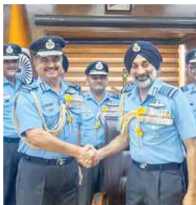
Academy, Defence Services Staff College and National Defence College, the air officer is a qualified flying instructor and an experimental test pilot with more

Air Chief Marshal A P Singh, an accomplished fighter pilot with more than 5,000 hours of flying experience, on Monday assumed charge as new chief of the Indian Air Force, succeeding incumbent Air Chief Marshal V R Chaudhari who superannuated. Air Chief Marshal Singh was serving as Vice Chief of the Air Force in his previous assignment. Born on October 27, 1964, Air Chief Marshal Singh was commissioned into the fighter pilot stream of the Indian Air Force in December 1984. In his long and distinguished service spanning nearly 40 years, he has served in a variety of command, staff, instructional and foreign appointments. An alumnus of the National Defence