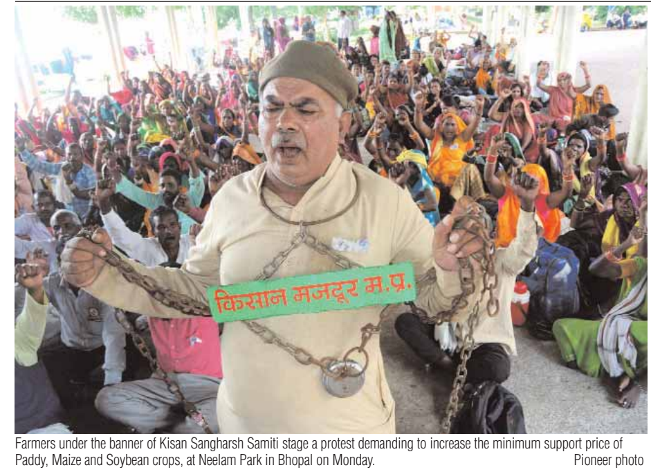
Farmers under the banner of Kisan Sangharsh Samiti stage a protest demanding to increase the minimum support price of Paddy, Maize and Soybean crops, at Neelam Park in Bhopal on Monday.