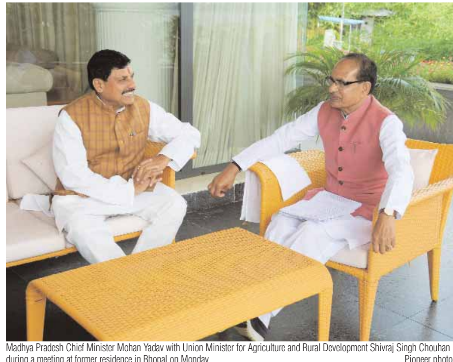
Madhya Pradesh Chief Minister Mohan Yadav with Union Minister for Agriculture and Rural Development Shivraj Singh Chouhan during a meeting at former residence in Bhopal on Monday.

the workshop. He told that STARS project is being operated in 6 states Madhya Pradesh, Odisha, Rajasthan, Kerala, Himachal and Maharashtra.