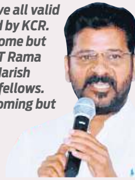
- Revanth Reddy, Chief Minister

What is your (KCR) sorrow and what is your (KCR) pain? Come to the Assembly. Let us have a debate. Come to the people and speak. The government is ready to solve all valid issues raised by KCR. KCR won't come but sent two (KT Rama Rao and T. Harish Rao) cheap fellows. KCR is not coming but two 'petty guys' are creating trouble