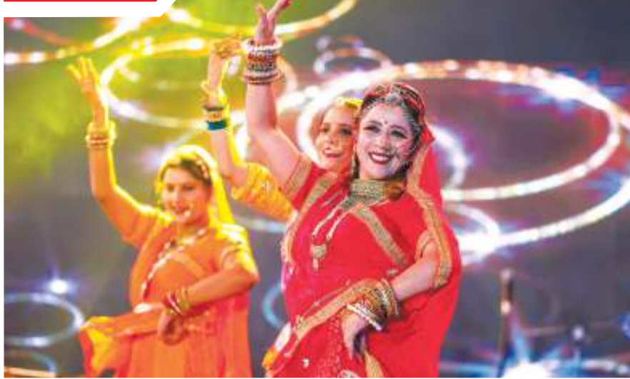
Folk dancers perform during the celebration of the 297th foundation day of 'Pink City', Jaipur