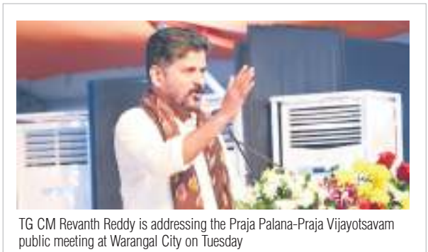
TG CM Revanth Reddy is addressing the Praja Palana-Praja Vijayotsavam public meeting at Warangal City on Tuesday

"What is your (KCR) sorrow and what is your (KCR) pain? Come to the Assembly. Let us have a debate. Come to the people and speak. The govern-