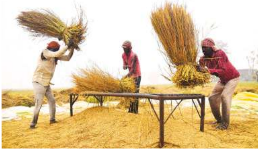
Labourers thresh paddy at a field on the outskirts of Amritsar