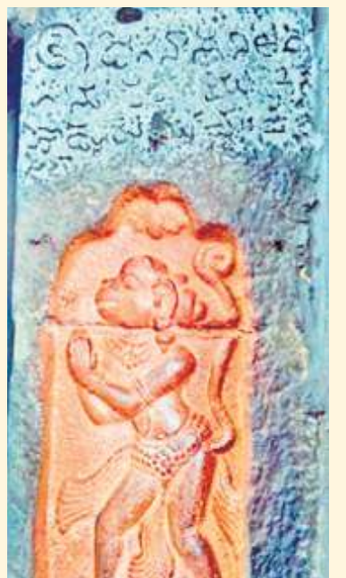
Telugu inscription seen on the wall of the statue of Lord Hanuman

As most inscriptions at Simhachalam are in Odiya, this Telugu inscription offers a unique glimpse into the temple's history and the diverse cultural influences that shaped it. As a prominent Narasimha shrine, Simhachalam continues to attract devotees and remains a vital pilgrimage site, preserving centuries of Vaishnavism tradition in the region.