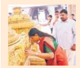
Home Minister Anitha visits Tirumala