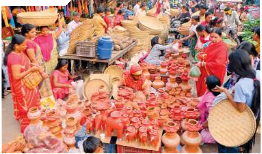
People purchase bamboo baskets and other items ahead of the 'Chhath Puja,' in Gurugram