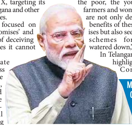
Modi expanded his criticism by asserting that Congress's governance style has affected the fiscal health and development trajectory of the states it controls

"Check any state where the Congress has governments like Himachal Pradesh, Karnataka and Telangana. The developmental trajectory and fiscal health are turning