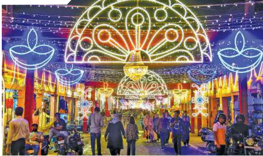
Illuminated Bapu Bazar on the eve of the Diwali festival, in Jaipur