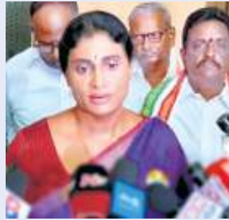
security and 4+4 security arrangement for Sharmila. Continued on Page 2

SN Raja, general secretary, incharge (administration and organisation), Andhra Pradesh Congress Committee (APCC) wrote a letter to DGP Ch Dwaraka Tirumala Rao, requesting the extension of 'Y' Category